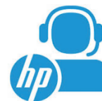
HP Smart Friend 1 Month SVC HG382E

The product could differ from the images shown. © 2015 Hewlett-Packard Development Company, L.P. The information contained herein is subject to change without notice. Specific features may vary from model to model. The only warranties for HP products and services are set forth in the express warranty statements accompanying such products and services. Nothing herein should be construed as constituting an additional warranty. HP shall not be liable for technical or editorial errors or omissions contained herein. Not all features are available in all editions or versions of Windows. Systems may require upgraded and/or separately purchased hardware, drivers and/or software to take full advantage of Windows functionality. See http://www.microsoft.com . All other trademarks are the property of their respective owners.