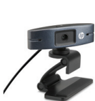
HP HD 2300 Webcam A5F64AA