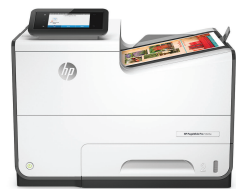
HP PageWide Pro 552dw Printer