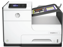
HP PageWide Pro 452dw Printer