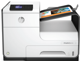
HP PageWide Pro 452dn Printer

Ultimate value and speed—HP PageWide Pro delivers the lowest total cost of ownership and fastest speeds in its class. 1,2 Get professional-quality color plus best-in-class security features and energy efficiency. 3,4