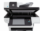
Digital Sender Flow 8500 fn1 Document Capture Workstation