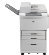
M9040 MFP / M9050 MFP