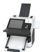
Scanjet Enterprise 7000n/nx Document Capture Workstation