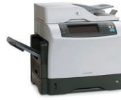
4345 MFP/ M4345 MFP