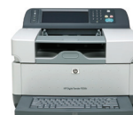
9250c Digital Sender