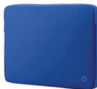
HP 14 in Spectrum Blue Sleeve M5Q16AA