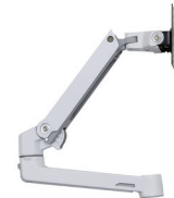
WHITE WITH GREY ACCENTS 98-130-216