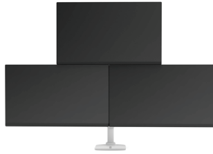
ONE LX ARM, EXTENSION AND COLLAR KIT SUPPORTS THREE DISPLAYS