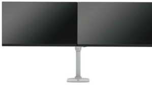
STANDARD CONFIGURATION SUPPORTS TWO DISPLAYS