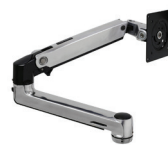
POLISHED ALUMINUM WITH BLACK ACCENTS 97-940-026

LX ARM, EXTENSION AND COLLAR KIT REQUIRED TO ADD A THIRD AND FOURTH ARM TO THE TALL POLE VERSION