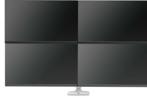
ONE LX ARM, TWO EXTENSION AND COLLAR KITS SUPPORT FOUR DISPLAYS