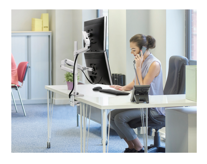
LX ARM, EXTENSION AND COLLAR KIT REQUIRED TO ADD A THIRD AND FOURTH ARM TO THE TALL POLE VERSION