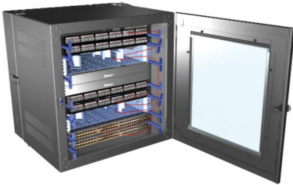
Figure 1: Application of a horizontal slack manager and bend radius posts installed in a wall mount cabinet