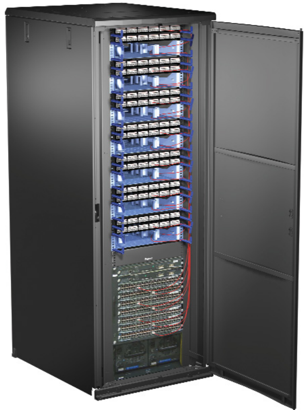
Figure 2: Application of a horizontal slack manager and bend radius posts installed in a full size cabinet

Dimensions are in inches [Dimensions in brackets are in millimeters]