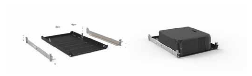
Figure 4. The HP Z2/Z4/Z6 Depth Adjustable Fixed Rail Rack Kit (2A8Y5AA) exploded view

The HP Z2/Z4/Z6 Depth Adjustable Fixed Rail Rack Kit (2A8Y5AA) includes a set of fixed-rail support brackets that attach directly to the rack and provide a secure mounting platform for the system-tray and Workstation. The fixed-rails are adjustable and can accommodate racks that are 24-30 inches deep. The system-tray is engineered to provide tool-free access to the Workstation, allowing the Workstation to be serviced without removing it from the rack.