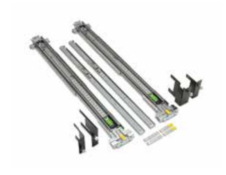
Figure 9. The HP Z640/Z840/Z8 G4 Rail Rack Kit (2FZ77AA) components