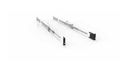
Figure 8. The HP Z8 Rack Rail Upgrade Kit (2FZ76AA) components

For customers looking to upgrade the HP Adjustable Rail Rack Flush Mount Kit (B8S55AA), HP is offering the HP Z8 Rack Rail Upgrade Kit (2FZ76AA). The kit includes a set of inner slide rails, front flanges, and hardware necessary to perform a seamless upgrade to the new, more powerful, HP Z8 G4–all without removing rack kit hardware from the rack. Simply attach the HP Z8 Rack Rail Upgrade Kit to the HP Z8 G4, remove the HP Z840 from the rack, and replace with the configured HP Z8 G4.