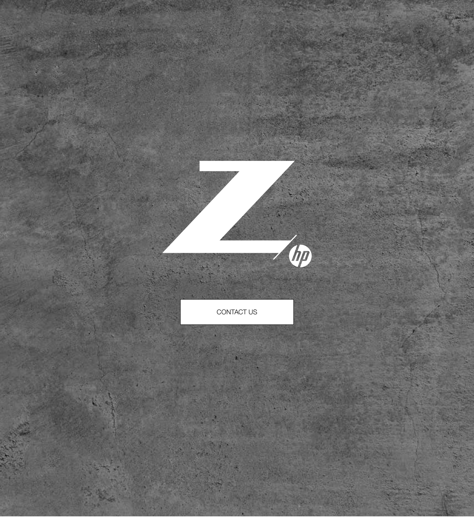
© Copyright 2021 HP Development Company, L.P. The information contained herein is subject to change without notice. The only warranties for HP products and services are set forth in the express warranty statements accompanying such products and services. Nothing herein should be construed as constituting an additional warranty. HP shall not be liable for technical or editorial errors or omissions contained herein.

Intel and Xeon are trademarks of Intel Corporation in the U.S. and other countries. Windows is a U.S. registered trademark of Microsoft Corporation.