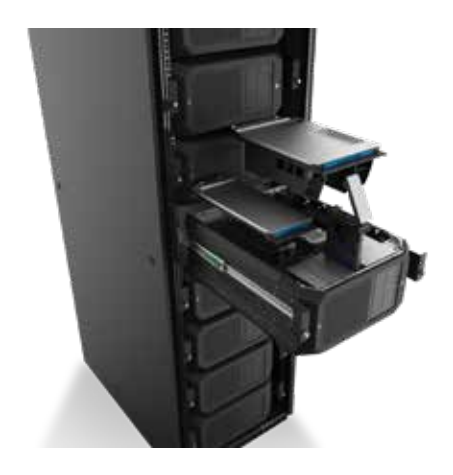
Figure 7. A Rack Mounted HP Z8 G4 installed with an HP Z640/Z840/Z8 G4 Rail Rack Kit (2FZ77AA) showing access to interior Workstation components

The HP Z640/Z840/Z8 G4 Rail Rack Kit rails installs into racks without using tools, making setup convenient and efficient. The inner slide and mounting flanges attach to the computer chassis using a set of screws for added strength and stability. The top mounting holes are concealed underneath the top plastic trim, which must be removed to attach the inner slide and mounting flanges.