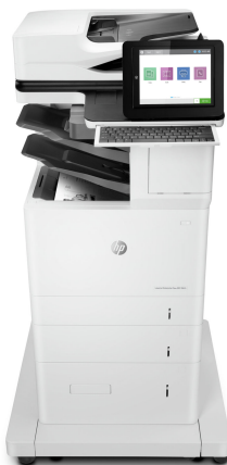
HP LaserJet Enterprise Flow MFP M635z