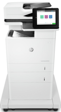
HP LaserJet Enterprise MFP M635fht