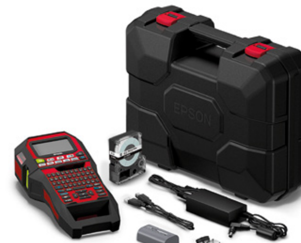
Full kit included