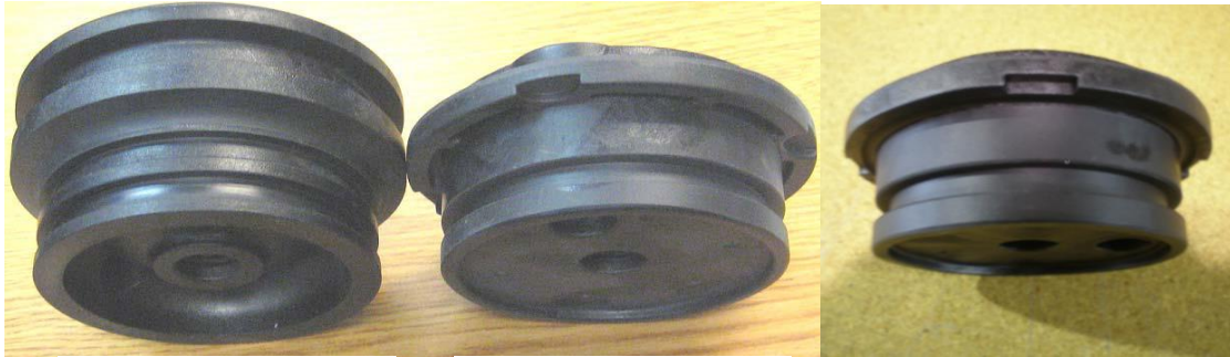
New Style End Cap (From Kit P/N W2T912032)