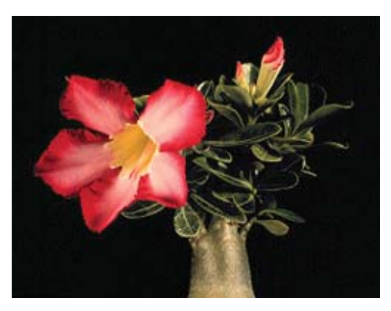
An Adenium flower.

For one thing, it has no thorns. But beyond that, it is totally unrelated to the rose family and doesn't really even look like one. So much for common names. The desert rose is scientifically known as Adenium obesum , or the fat adenium,