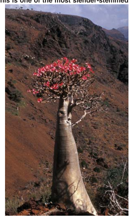
Adenium socotranum is the giant of the group, and is restricted to the island of Soqotra. It is also the rarest in cultivation.

Up until recently, relative few horticulturists were selecting improved cultivars or doing hybridizing. Several nice named cultivars are currently in the trade (see photos). In the past 10 years or so many nurseries in Asia, especially Taiwan and Thailand, have been producing dozens (maybe hundreds) of named cultivars. They are