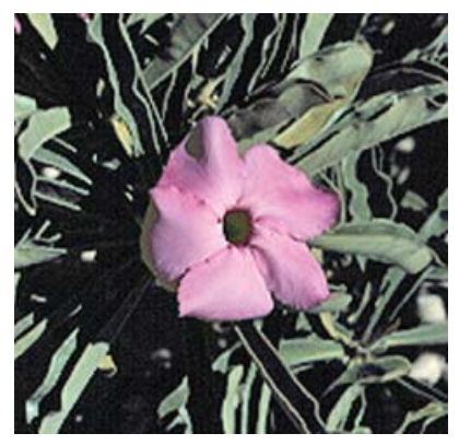
A. swazicum 'Perpetual Pink'

• Adenium swazicum is commonly available from specialist nurseries. It comes from Swaziland and adjacent areas in eastern South Africa and Mozambique. It is of easy cultivation but is very susceptible to spider mites. The flowers are uniform in color, varying from pale to deep pink to pinkish purple. Blooming is normally for a few months in late summer and fall, but the cultivar 'Perpetual Pink' has a longer blooming period. The soft succulent stems tend to droop, especially in plants that are too shaded. Larger plants have massive roots and thick trunks.