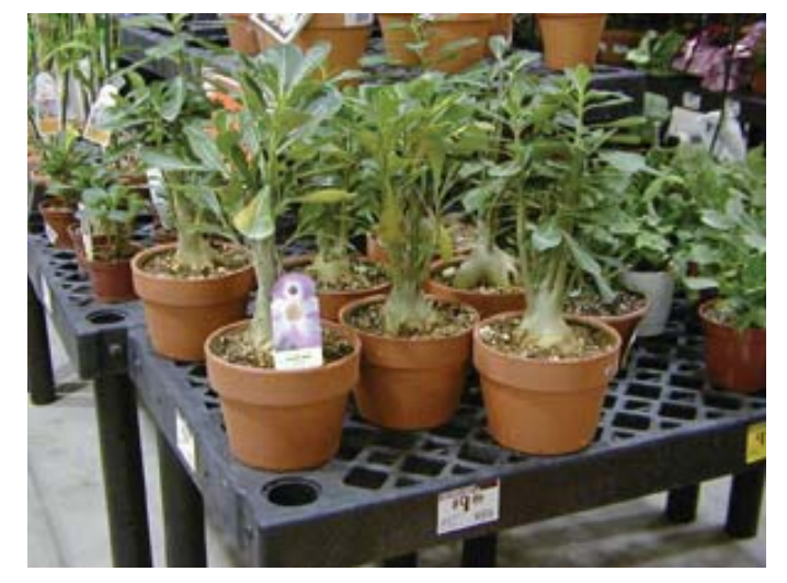
Adenium plants for sale at a local retailer.

Nicely established plants are becoming more commonly available at those garden centers that stock a good assortment of cacti and other types of succulent plants. They are also showing up at large national chain discount and hardware stores, including here in Wisconsin. Sometimes they are marketed outside of their flowering period, so you may have to look closely at the plants and labels (look for Desert Rose), or ask a knowledgeable sales person. Those that are most commonly available are standard Adenium obesum .