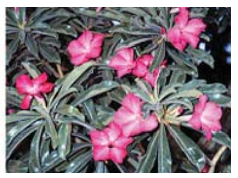
Adenium cultivars: (L) 'Red Everbloomer'; (C) 'Crimson Star' and (R) 'Endless Sunset'.

selecting for rapid growth, sturdy plant body, lengthened flowering time, larger flowers (to 4 inches!), and variety in flower color and form. U.S. nurserymen are importing such plants for propagation and to use in their own breeding programs. In recent years, pure-white flowered forms have become available, as well as various shades of pink and red. Many new hybrids have amazing flowers including bicolors and tricolors, striping, and complex patterning. With this tremendous diversity on the horizon, it is likely that the desert rose will become an even more popular houseplant.