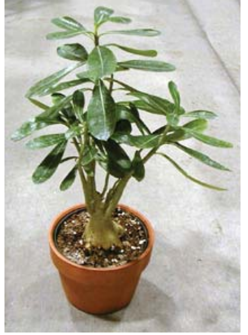
An Adenium plant.

referring to its grossly thickened trunk. It is in the Asclepiadaceae, or milkweed family, which, besides our garden milkweeds ( Asclepias spp.) includes the common garden periwinkle, oleander (frequently used as floriferous landscape shrubs in mild climates such as Florida and southern California), the spiny Madagascar palm (which, or course, isn't a palm at all), the fragrant frangipani, or Plumeria which is grown worldwide in tropical climates, and a myriad of African succulents with bizarre, often stinky, star-shaped flowers, collectively referred to as stapeliads.