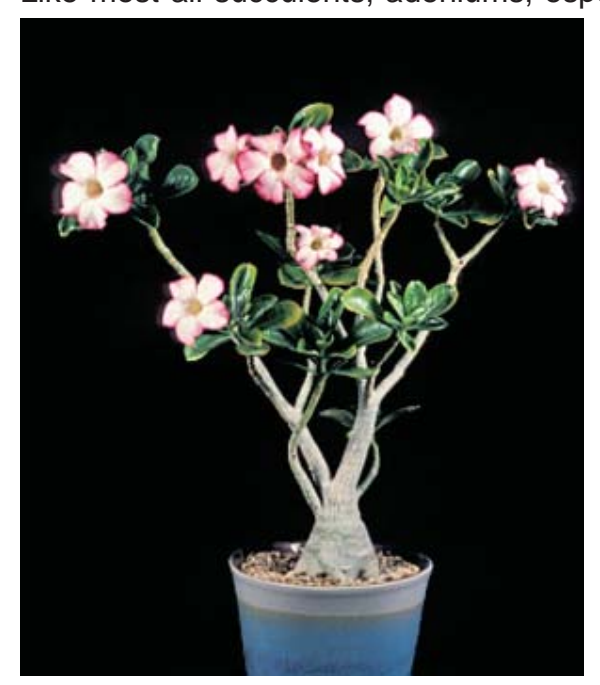
Adenium obesum, 30 years old and 20 inches tall. The photo was taken as the plant was beginning new growth and flowering in the spring (mid March).

Like most all succulents, adeniums, especially when dormant, are susceptible to root rot (which can