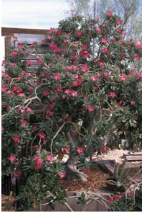
When given ideal conditions, plenty of root room, and a long growing season some Adeniums can grow quite large and colorful, such as these in an Arizona greenhouse. But their size can be kept in check by keeping them under-potted.

good quality balanced houseplant fertilizer, but only at half the recommended label rate.