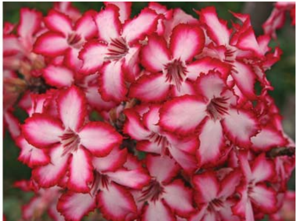
Adenium multiflorum planted at a rest camp in Kruger National Park, South Africa (L) and closeup of the bicolored petals (R).