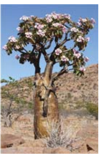
L: Two young seedlings of Adenium boehmianum in northern Namibia. This is one of the most slender-stemmed species. Note how prolific flowering can be in young plants. Also note that the plant on the left has very pale, almost white, petals. C: flowers of Adenium boehmianum from Namibia. R: An incredibly old plant of Adenium boehmianum in northern Namibia. Note the profusion of flowers.

• Adenium socotranum is currently the rarity of the group. It originates only from the isolated and often inaccessible (to Westerners) island of Socotra in the Indian Ocean south of the Arabian peninsula and east of the Horn of Africa. This is the giant of the group, with massive trunks up to 10 ft tall and 8 ft in diameter! For many years Socotra hosted a Soviet naval port and was off limits to most everyone, restricting the availability of plants and seeds. Now the local authorities are very protective of the natural resources and it is illegal to collect plant material of any type. Adenium socotranum occurs by the thousands in nature, but relatively few plants exist in cultivation. However, recent efforts to propagate this species are being successful and seedlings are occasionally available on eBay and from specialist succulent nurseries; they tend to be a bit pricey.