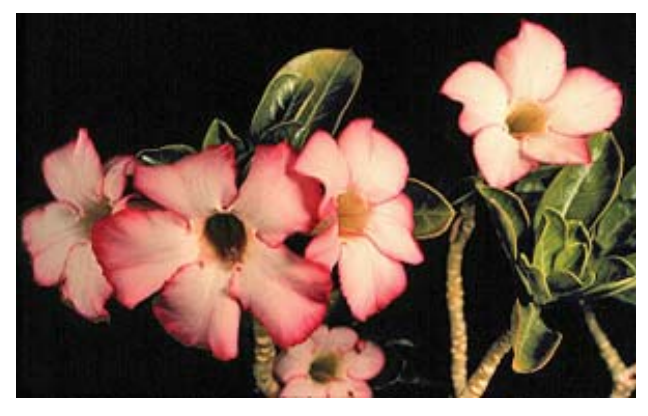
Adenium obesum blooming.

There has been considerable work done in selecting cultivars. horticultural primarily for flowering characteristics. Other cultivars have been developed through hybridization, using other species to cross with A. obesum. These named cultivars must be propagated from cuttings, which do not have a caudex, but which do eventually form thickened roots and trunk. To speed the process, cuttings are often grafted onto the fat bases of A. obesum seedlings. Flower colors range through various shades of pink and red, to bicolor flowers with white, and, recently, pure white forms. Purples, yellows, and even oranges are now being developed as either solid colors