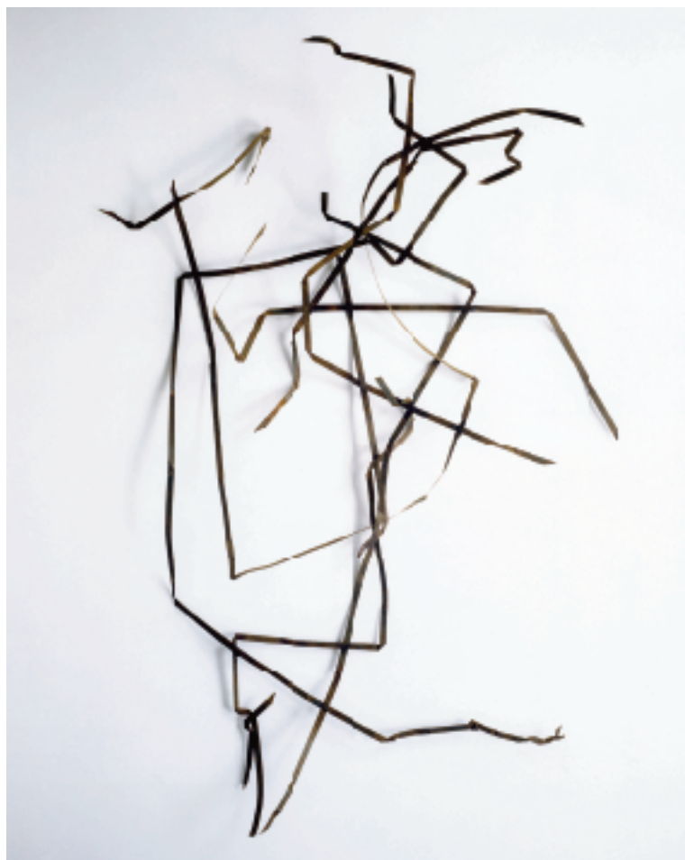
Above: City , 1993. Sprung steel, 110 x 152 x 38 cm. Below: Mode—module—modular , 2004. Wood and steel coat hook, 47.5 x 50 x 35 cm.

RW: But I think I'm proving him wrong. The funny thing is I'm not a photographer. It's such a complicated subject: What are images? Why do we see images? How do we nominate something to become an image or not? I'd really like to befriend a brain scientist or psychologist, someone with scientific or clinical experience of what it is we do when we look. Think how many images I've seen today and how brilliant I am at editing them. People often say they're bombarded by images, but images are passive. How we see and what we remember is mysterious. It's extremely luxurious to be educated enough or use one's time in such a way.