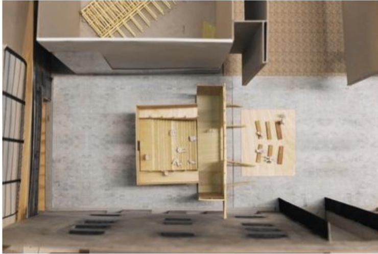
RELAY - Black Maria, by Richard Wentworth with GRUPPE at King's Cross

The structure will be used as a space for discussion, performance and moving image works.