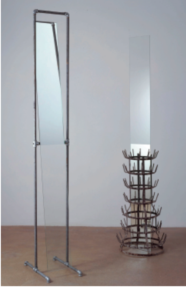
Above: Ifs and Buts , 2005. Galvanized steel with mirror, 2 elements, steel: 210 x 44 cm. diameter; glass: 35 x 50 x 230 cm. Below: Plume , 2012. Mixed media, 40 x 20 x 8 cm.

The Indianapolis Museum of Art has a very interesting architectural typology. I used the foyer space, which is like an enormous envelope, a vast porch or veranda housing escalators. It's the main circulation point of the museum and quite hard to read as a space. It has architectural vanity, and I wanted to make something to cut through that, but surreptitiously, because much of our information is received that way—like whispering. It's not as though I wanted to confront this atrium space, though; I just wanted to give it a good talking to and make something that was courageous yet gorgeous.