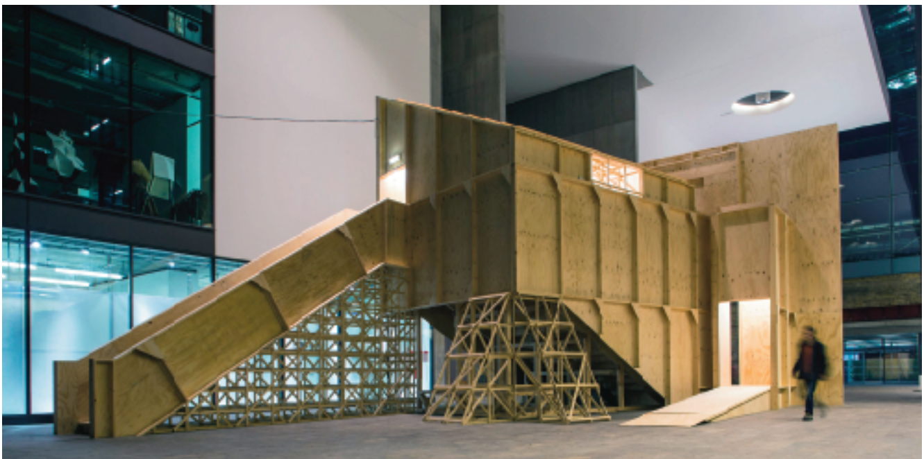
Black Maria , 2013. View of installation at King's Cross, London.