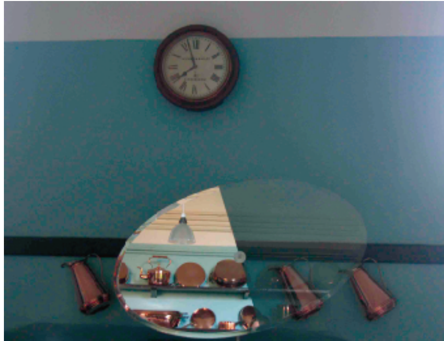
Above and below: 14 Rooms Upended , 2005. 20-kilogram weights, glass, mirrors, and galvanized steel, dimensions variable.

your head; it makes you very physically aware. It's odd for the body to be in that space, yet it's enjoyable and quite voyeuristic to watch people who are in it. It's not that they have a choice; that's what humans do. They look up, make sequences, and then realize they're defeated. Deeply contradictory things happen because the subject matter of one book could be completely different from the next.