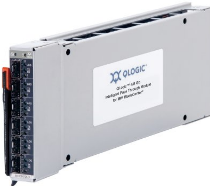
Figure 1. QLogic 4/8 Gb Intelligent Pass-thru Module for BladeCenter

Figure 1 shows the QLogic 4/8 Gb Intelligent Pass-thru Module. The 8 Gb module has an identical port configuration.