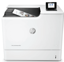
HP Color LaserJet Enterprise M652dn

This HP Color LaserJet Printer with JetIntelligence combines exceptional performance and energy efficiency with professional-quality documents right when you need them—all while protecting your network with the industry's deepest security. 1