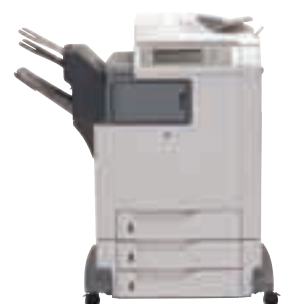
HP Color LaserJet 4730 mfp with optional multibin mailbox