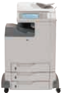
HP Color LaserJet 4730mfp