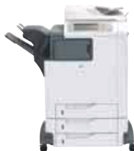
HP Color LaserJet 4730 mfp with optional stapler/stacker