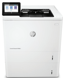
HP LaserJet Managed E60065x