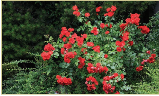
ROSES | JULY 3-5

Learn more about these and upcoming Floral Displays at WWW.LANSUGARDEN.ORG/FLORALDISPLAYS