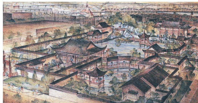
Original illustration of Lan Su Chinese Garden from the Suzhou Institute of Landscape Architecture Design prior to construction of the garden.

deal of hard work went into both of these historic commitments, and we look forward to 2020 and beyond to begin that journey in earnest.