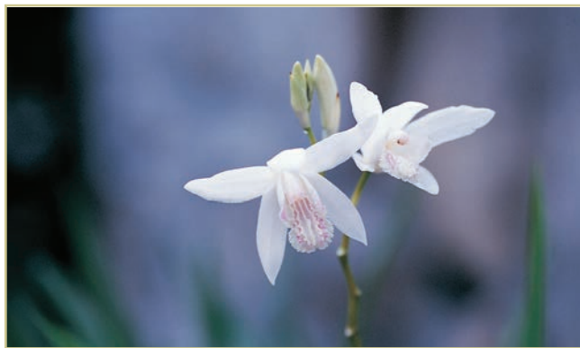
EAST ASIAN ORCHIDS | MAY 9-10