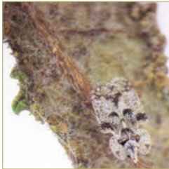
A Lacebug found in Lan Su

In 2020, Lan Su staff will present a series of six talks about the garden, familial history, and see “behind the scenes” looks at the programs, horticulture, facilities and more that make up the tapestry of the garden.