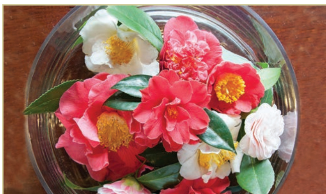
CAMELLIAS | MARCH 27-29