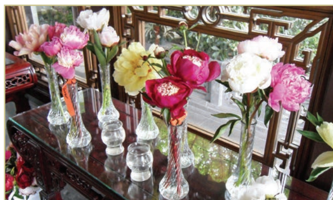
PEONIES | MAY 22-35