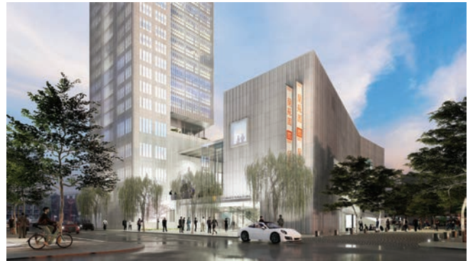
Rendering of proposed Cultural Center next to Lan Su Chinese Garden

We are very pleased that this hard work has paid off, in the form of an executed agreement to purchase the land, and a development partnership with Prosper Portland as we move forward. A great