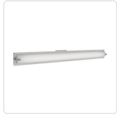
601002BN-LED Brushed Nickel