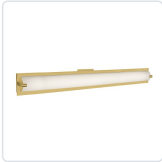
601002BG-LED Brushed Gold