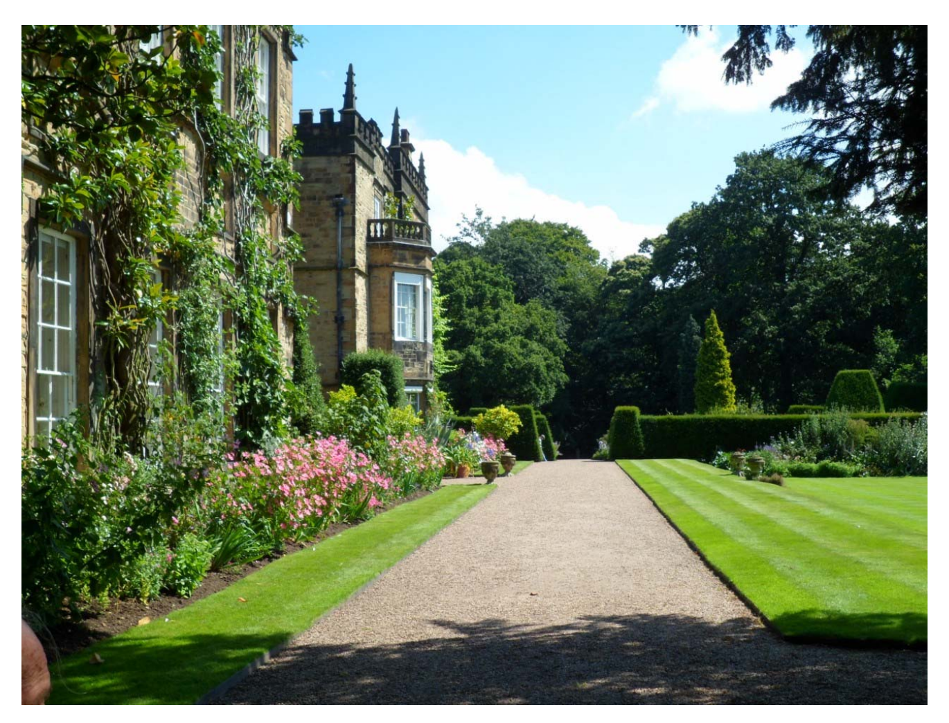
Firm gravel path