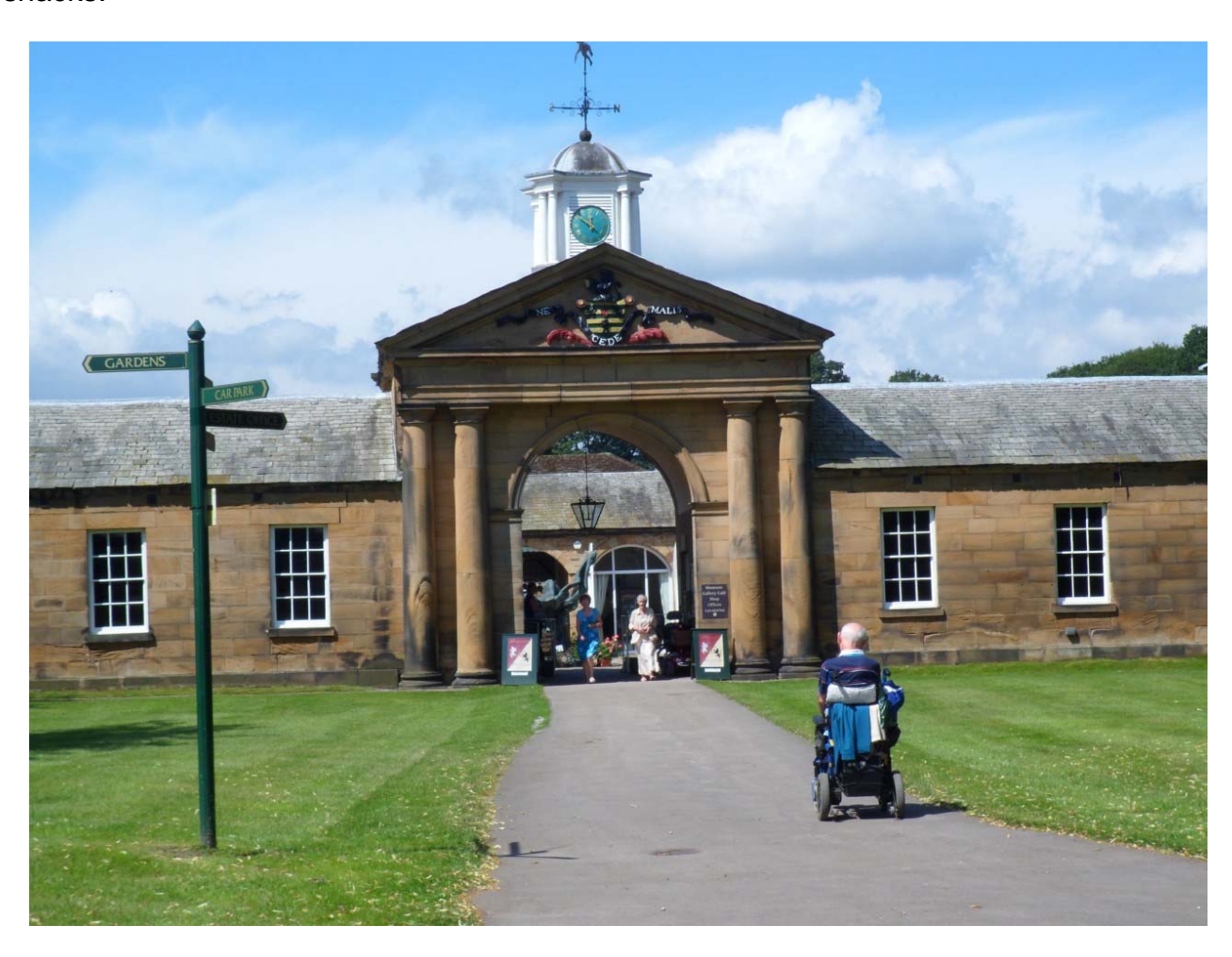
Renishaw Café & Shop Entrance

Café – The Gallery Café has inside & outside facilities and covers both meals & snacks.