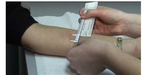
Figure 3. Skin test reading