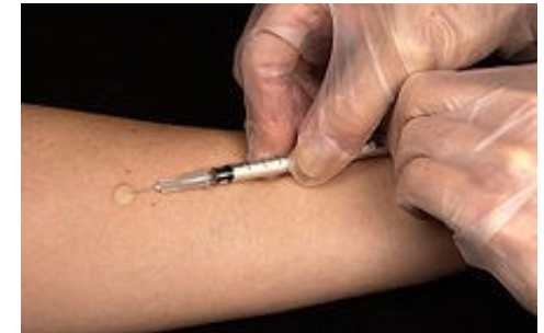
Figure 2. Skin testing injection