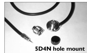
5D4N hole mount