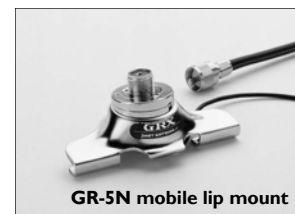
GR-5N mobile lip mount