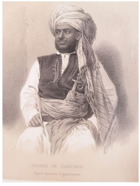
Fig. 3. Arab merchant of Zanzibar, dressed in dishdasha , vest, turban, waist sash, c. 1848. Not seen is his hip wrapper ( wizar ).

Lithograph from a daguerreotype by Charles Guillain. Public domain.