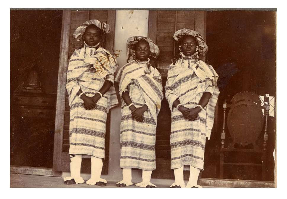
Fig. 11. Three Swahili girls wearing turbans of cotton-silk mashru similar to the cloth shown in Fig. 10.