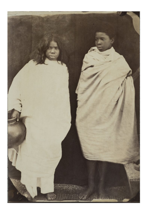
FIG. 1. Servant children dressed in wrappers likely made of unbleached American cotton sheeting. Madagascar, c. 1858–1863.