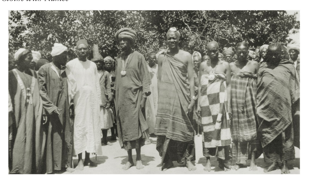
Fig. 17. The Sultan of Unyanyembe, centre right, with white ornament on head, 'showing himself to the people'. The striped wrapper he wears is likely the subaya striping style.

the costly end of imports, with five out of six of the most expensive 'cloths with names' in 1858. Increasingly, all-silk versions of western Indian-made cloth became a rarity, with rulers overwhelmingly demanding two Muscat styles, the subaya and stirbazi . Caravan packing lists from 1850 to 1880 show that despite their higher prices, Omani styles were carried into the interior by a margin of 2:1 over Indian types. The likely reasons for this shift include Oman's easy access to silk, growing wealth and desire for luxury in the interior, and the socio-political dimensions of fashion, which I explore in the final section below.