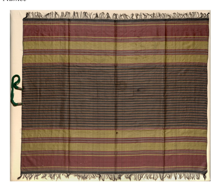
Fig. 10. An élite woman's headdress made of two seamed widths of mashru , with added side fringes and beaded loop for securing cloth to the forehead, collected in Zanzibar before 1880. Silk, cotton, beads. Satin weave and weft floats. 148.59 × 118.11 cm. Object i.d. 121973.