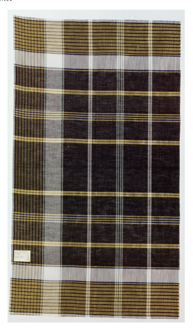
Fig. 9. A cloth industrially woven in the factories of Frohlich Brunnschweiler & Cie, Ennenda, Switzerland, for the Mozambique market, likely based on the Kachchh cloth style kunguru , but in a new colourway of yellow and brown. Cotton. c. 1905–1915. 75 × 42 cm. Object i.d. 13967.