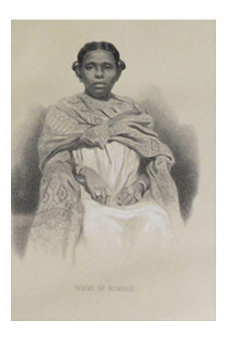
Fig. 5. A Swahili woman wearing a printed shoulder wrap with kisutu design, c. 1848. Lithograph from a daguerreotype by Charles Guillain .

of them as 'indigo blue upon a madder-red ground, spotted with white' is borne out by a few rare nineteenth-century samples (Fig. 6), which further reveal a classic Indian design: selvedges framed by a narrow floral meander and guards, a centrefield of small rosettes arranged in rows, with the most elaborate patterning — multiple rows of geometric motifs — reserved for the two ends.<sup>37</sup> Zanzibar alone imported 10,000 to 11,000 pieces annually.<sup>38</sup> Symptomatic of the era's entangled and hybrid production, dyers in Kachchh employed yellow mangrove bark ( mkandaa ) imported from mainland eastern Africa as a red colouring agent.<sup>39</sup> So, too, by 1860 at least, as printers throughout the world, they mainly employed British cottons as the ground fabric. There is convincing evidence that some printing was also done in situ in eastern Africa by resident artisans — either African, Indian or both.<sup>40</sup>