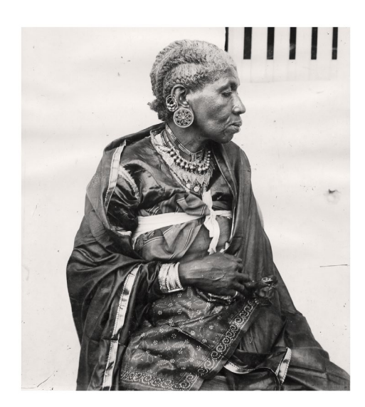
Fig. 15. An élite Antalaotra woman of the north-west coast of Madagascar, c. 1900.

From the late eighteenth century at least, major port towns in Oman, and nearby hinterland villages, teemed with weavers producing cloth for turbans, mantles and shoulder cloths. As in Kachchh, weavers were men, full-time professionals typically based in towns. They worked on pitlooms and relied mainly on imported thread and dyes. Their silk thread came via the Gulf, an important commodity flow controlled by Oman at the time. Finished 'Muscat cloth' was both consumed locally and widely exported, up the Gulf and around the rim of the western Indian Ocean. Sources specify that production became increasingly centred on the eastern Africa trade, Zanzibar in particular, with upwards of 100,000 cloths sent there annually from the late 1840s.<sup>79</sup> All the major Omani ports were involved over time, including Sohar and al Suweik and their hinterlands on the Battinah coast, the capital city Muscat and its sister port of Muttrah, with production later shifting southward to Qaryat, Sur and the latter's hinterland foothills.<sup>80</sup> In all likelihood reflecting weavers' reliance on African markets, Sur was precisely the region that continued the strongest trade ties to eastern Africa.