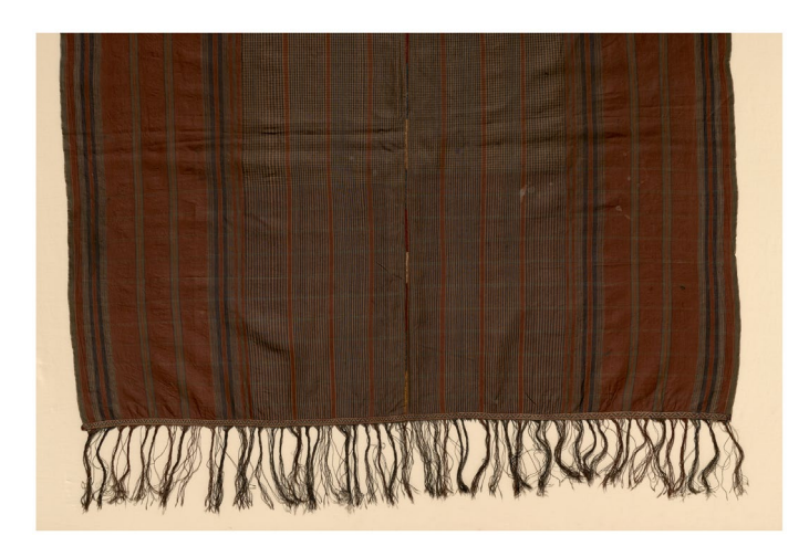
FIG. 12. Detail of a mostly silk cloth corresponding to descriptions of the deuli . Cotton, silk. Interlocking wefts and woven end bands. 229.87 × 113.66 cm. Object i.d. E4573.