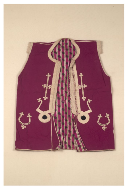
Fig. 2. The vest of an Arab trader from East Central Africa (former Belgian Congo). Broadcloth, embroidered trim, cotton print lining. Collected before 1900. Object i.d. 90.0/2700.