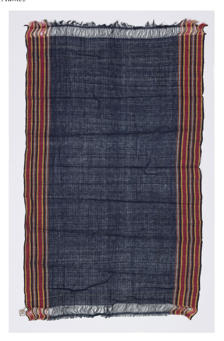
FIG. 7. 'Coloured cloth' corresponding to descriptions of the taujiri , made and collected in Kachchh, India, c. 1867. One length of a wrapper garment. Cotton, stripes on one selvedge, checked centrefield, with warp sets of six dark blue threads alternating with two light blue threads. Said to be for the "Arabian market". 165 x 96 cm. Victoria and Albert Object i.d. 5612 (IS).

later, as they likely represent Kachchhi imitations of striping styles associated with Oman. The kess made in Mandvi was probably a simplified, cotton version of the elaborate khess , a doubled-faced plaid of large checks, associated with Sind, although Burton observed the kess in Zanzibar to be a 'rare article', made of silk scarlet in Sind's major weaving centre in Tannah. The panchputty and possibly kitanee may in fact be cotton-silk mashru blends (see