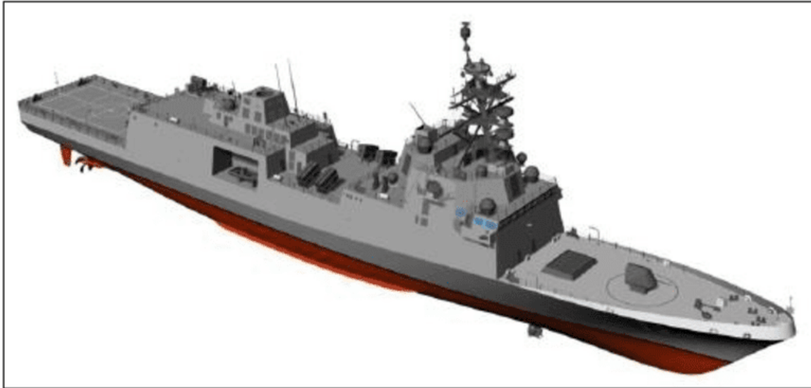
Figure 4. Constellation (FFG-62) Class Frigate Computer rendering of F/MM design