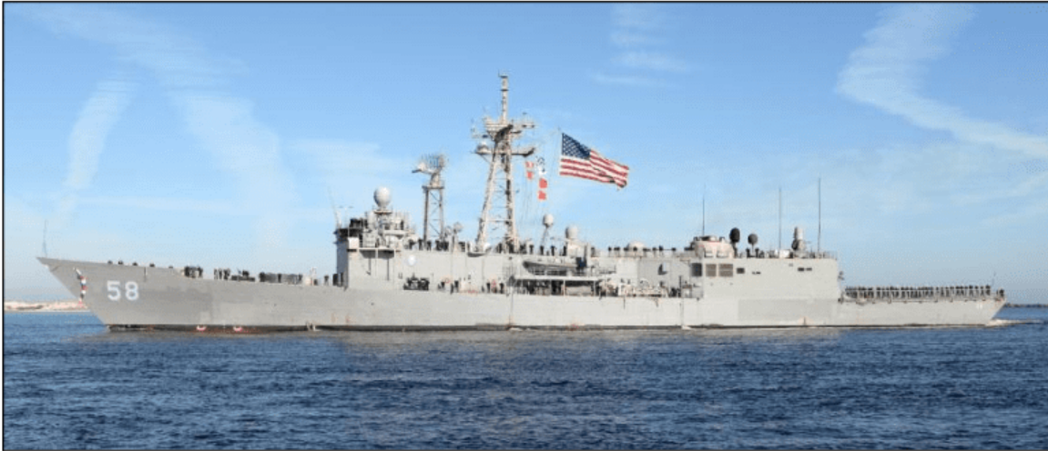
Figure 1. Oliver Hazard Perry (FFG-7) Class Frigate