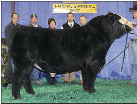
Mr HOC Broker Sire of Lots 318–321; several grandsons also sell

Lots 316 and 317 are a pair of flush brothers by On The Mark that are functional in their kind with balance and eye appeal. Maternal brothers sell as Lots 322 and 323.