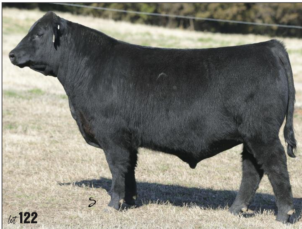
816G is just one of the many reasons we love our Class Time progeny. Some of our favorite two- and three-year-old Angus cows are sired by Class Time. He has also put a strong set of bulls on the ground, as you can see in Lots 121 and 122. 816G is backed by the famed 927K cow on the bottom side, which only adds to his maternal value in a breeding program. With tremendous length of body and a high degree of fleshing ability, this bull can work in all facets of the industry.