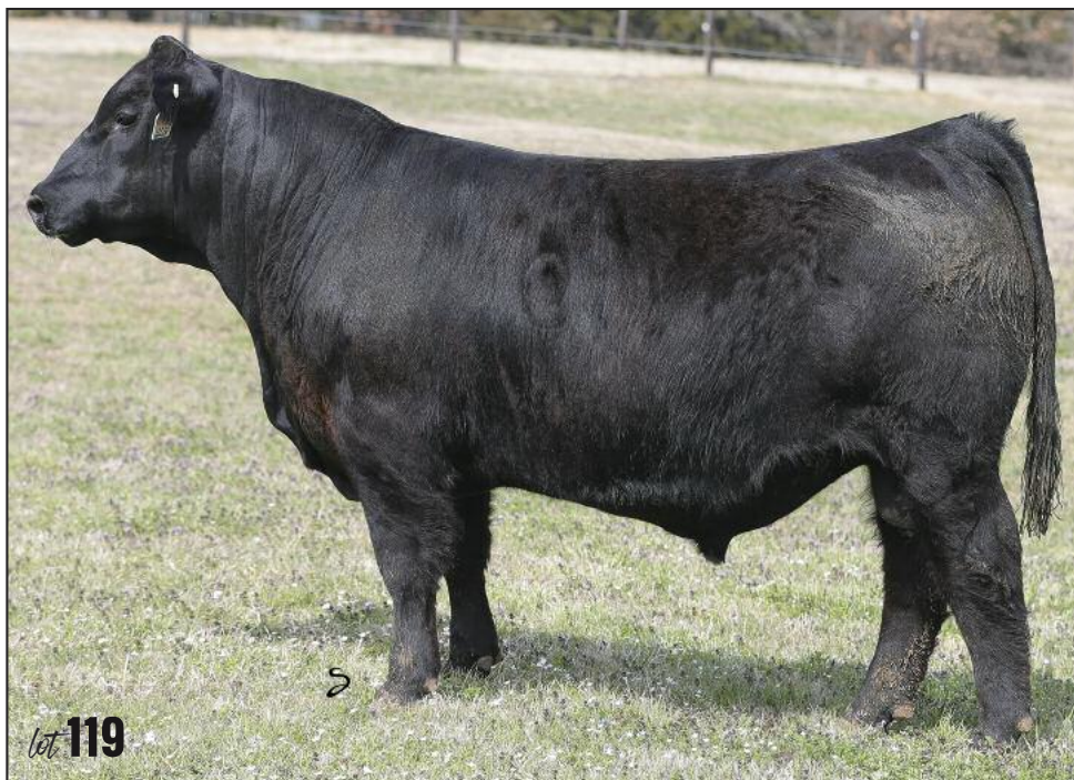
One of the first (and unfortunately one of the few) calves by The Natural we had in 2019. With added length and skeletal outline, this bull has the potential to pack a substantial amount of performance into his first calf crop. Out of a beautiful Masterlock daughter, 622G is a smooth shouldered, tall fronted bull with all the right angulation to his joints and the right kind of structure to his feet and legs to be a breeding bull deluxe that will add that extra punch to your cow herd.