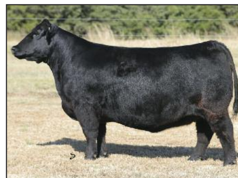
GCC Miss Boston 5501C2

Full sister to Lot 166 & maternal sister to Lots 164, 165, 167 & 168