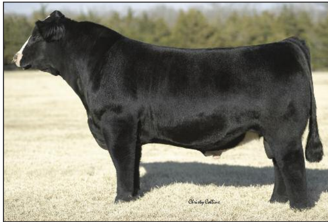
SVF Steel Force S701 Sire of Lots 331–334