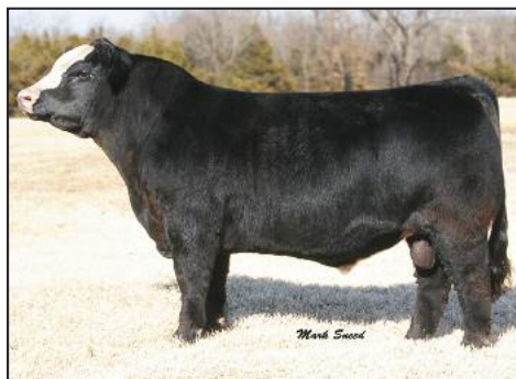
GCC Whizard 125W Sire of Lots 337 & 338

Low birth weight at 68 lbs. and a calving ease EPD that is above average in an outcross pedigree.