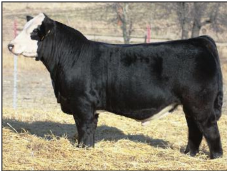
W/C Loaded Up 1119Y Sire of Lots 297-315

These older Simmental bulls are rugged made, stout ended bulls that have the pounds and performance to make a difference in one generation. Study the feet and legs on these bulls, and then look at the shape and power they have. Big time herd bulls that are ready to work.