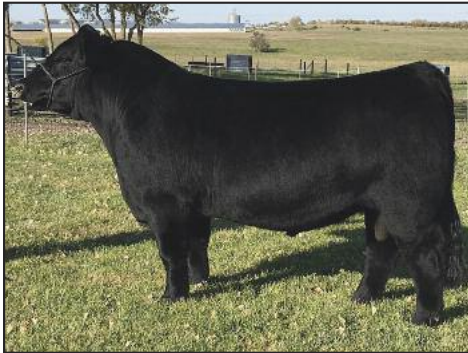
ETR Blitz 208E Sire of Lots 267–270

Dew North has proven himself a light birth option for purebred breeders across the country. Study the numbers on his sons selling and find the one that fits your need. We have supreme confidence in their genetic capability to do the job well. Lower birth with calving ease and growth in the end. That's a good combo for anybody.