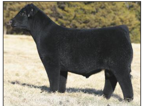
GCC Makin Time 404F ET

Maternal brother to Lots 161–163 & to dam of Lot 160