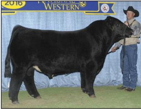
BOE Garth Sire of Lots 208-217