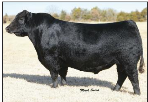
GCC Total Recall 806T Sire of Lot 117

This New Game son is a big topped, huge footed bull with power to spare. Check out the scan data and you can see for yourself...a 16.4 sq. in. REA! Take this one home and inject some carcass into those calves and then collect the maternal benefits later with the replacement females.