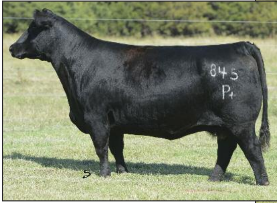
Duff NE 9375 Georgina 845 Dam of GCC New Game 5654C