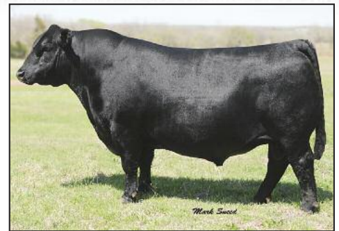
GCC Legacy 647X Sire of Lot 104

Here is a Legacy son that is certain to leave one of his own when it's all said and done. Huge rib shape, angled right down to the ground with muscle shape and dimension throughout. 808G lives up to the low birth weight promise we had hoped for in his genetic package. With an actual birth weight of 68 lbs. and a dam who has an average birth weight ratio of 92 on her progeny, one can have all the confidence that 808G will be a heifer bull deluxe. A deep bodied, soggy middled bull with extra fleshing ability and a moderate frame size, 808G is built with replacement females in mind. Use him with confidence and reap the rewards!