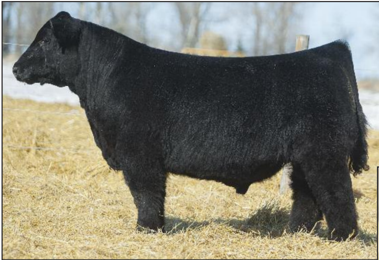
Maternal Made 15 sons sell