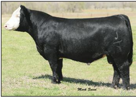
KMJ Poker Face 2227 Sire of Lot 289