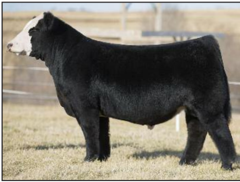
Jass On The Mark 69D Sire of Lots 316 & 317