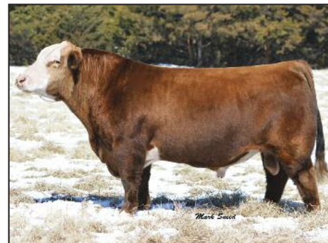
Houston X01 Sire of Lots 324 & 325