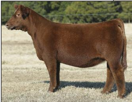
GCC ETR Pink 9205G $77,000 full sister to Lots 228 & 230

If you didn't find this one, then we probably can't be friends anymore! As unique an individual as we have in the Simmy bulls selling. His full sister was the high selling female at the 2019 Classic. And this guy is just as good. Study the rib shape, the smooth shoulder, the ultra cool build and balance, and it's easy see the targeted value within this bull. You don't find them constructed this way while maintaining this much power and shape very often. It's hard to think of another solid red purebred bull ever presenting himself like this one. Stand up and be counted first in this deal! Full brother to Lots 230 and 232.