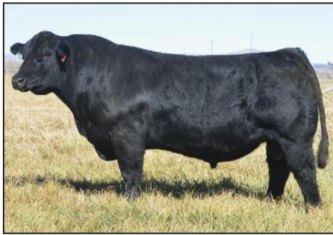
Yardley Utah Y361 Sire of Lot 280