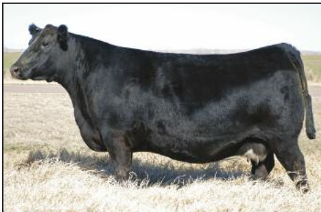
OCC Dixie Erica 841M Maternal granddam of Lot 320