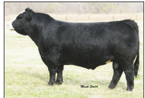
ZKCC Chopper 844U Maternal grandsire of Lot 283