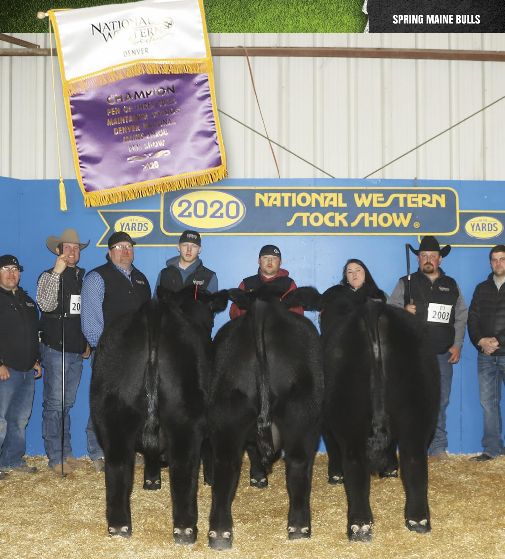
Our 2020 National Western Stock Show Grand Champion Pen of Three MaineTainer Bulls sell as Lots 150, 152 & 169!