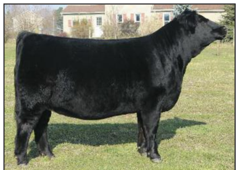
TJSC Knockout Dam of Lot 246