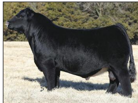
GEFF County O Sire of Lots 271-277