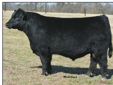
GCC King George 650A Maternal grandsire of Lot 279

Check out this data: 16.5 sq. in. REA and 7.01% IMF. A real world bull with exceptional data. Sired by Hammer Time and out of a King George daughter that is awe-some.