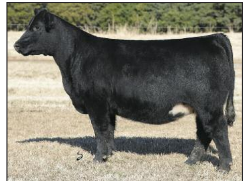
GCC Miss Whiskey 447F