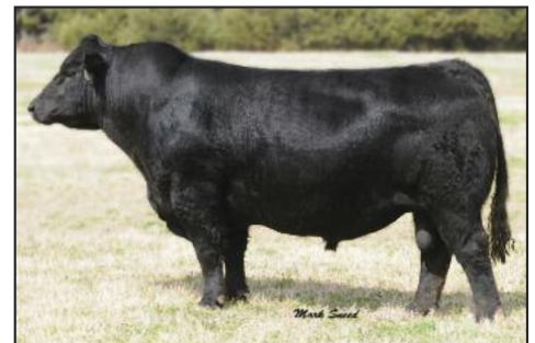
GCC Black Watch 849T Maternal granddam of Lots 197, 201 & 204