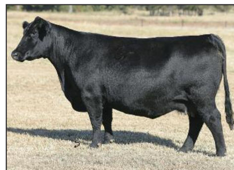
GCC Dixie Erica 918A Dam of Lot 330

This bull's mother was a featured Angus donor the last three years. This is her natural calf that combines a low birth weight with an exceptional look.