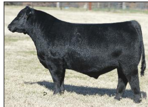
GCC Standard Time 924D ET Sire of Lots 129 & 130

The Standard Time progeny have exceeded our expectations and continue to do so every day with his first daughters now in production.