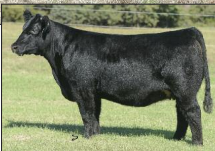
GCC Blackbird A604 Dam of Lots 169–172

Maternal Made × Blackbird A604 flush brothers...Lots 169–172