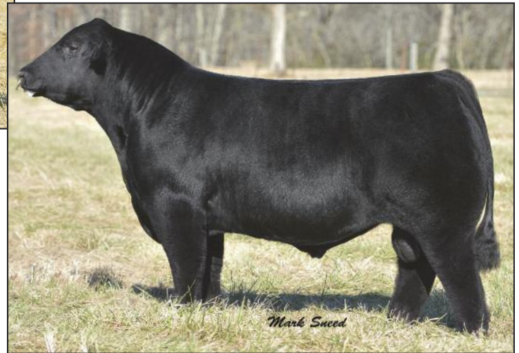
Daddys Money 55Z Sire of Lots 219-222