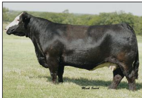
SVF Sheza Beauty L901 Dam of Lots 249 & 250