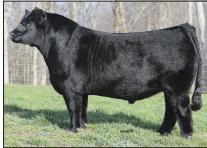
HB Guyman 485 Sire of Lots 141 & 142