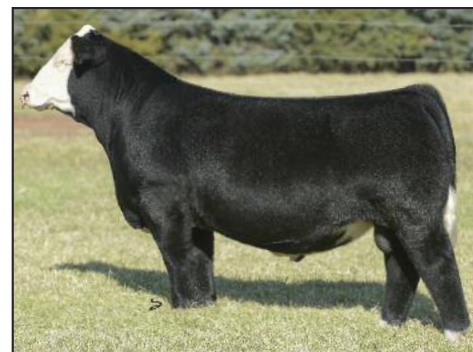
Conley GCC Shocker C19 Sire of Lots 326-330