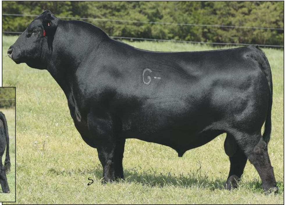
GCC New Game 5654C Sire of Lots 136-140