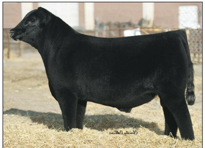
Silveiras Style 9303 Sire of Lots 109-111