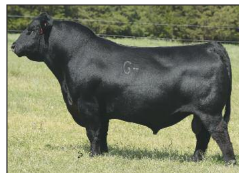
GCC New Game 5654C Sire of Lots 105-108

Lot 105 is a bull that is the perfect blend of the old and the new. GCC New Game has sired exceptional calves in every one of his calf crops...this bull continues that streak. With a dam backed by the powerful 932L cow, the proven genetics on the bottom side of 644G's pedigree only add more consistency to his genotype. 644G is a smooth shouldered, square built bull that is solid to the ground with longevity built into him with every step.