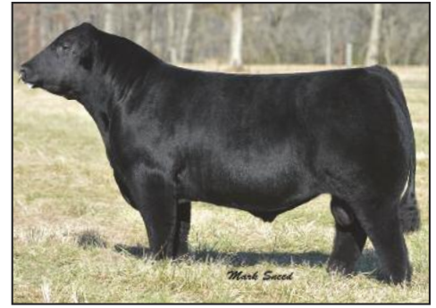
Daddys Money 55Z Sire of Lot 192