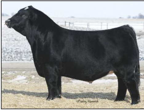
GSC GCCO Dew North 102C Sire of Lots 263–266 & Lot 278

Dew North has proven himself a light birth option for purebred breeders across the country. Study the numbers on his sons selling and find the one that fits your need. We have supreme confidence in their genetic capability to do the job well. Lower birth with calving ease and growth in the end. That's a good combo for anybody.