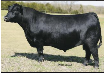
GCC Gold Standard X615 Sire of Lot 243

A Gold Standard out of a purebred Momentum daughter. He has the Angus look and build with Simmental growth curve and mass to his skeleton. Open Range is a bull to make a set of replacements with the maternal traits and longevity needed in today's industry. His dam has produced three bulls that have averaged $5,750 in past Grass to Grid sales. With calving ease built in, this bull will make a name for himself.