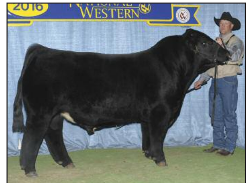
BOE Garth Sire of Lots 150-163

This bull hails from one of our top donors. Granddam Merle 319 is one that never misses. His maternal sister was one of the lead off bred heifers two years ago, and it's easy to see why...good looks run in this family. With plenty of rib and shape through his middle and a big, powerful top with power down through his lower one-third, he comes from the kind of cattle you'd like to carbon copy a thousand of.