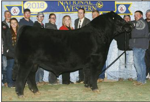
TJSC Hammer Time 35D Sire of Lots 233-237