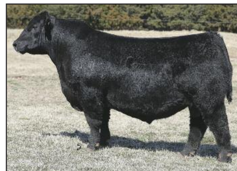
GCC Standard Design 933E ET Sire of Lots 131, 132 & 134