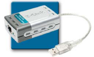
D-Link DUB-E100 Hi-Speed USB 2.0 Fast Ethernet Adapter