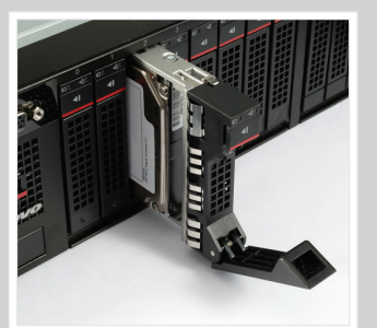
GREATER SCALABILITY* 25% greater storage, up to 32TB, to support your database, virtualization and email workloads

27% greater performance with optimized memory and IO for demanding workloads