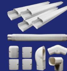
Line Cover Kit