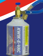
Line Set Flushing Kit