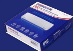
UVC Bacterial Disinfection Kit