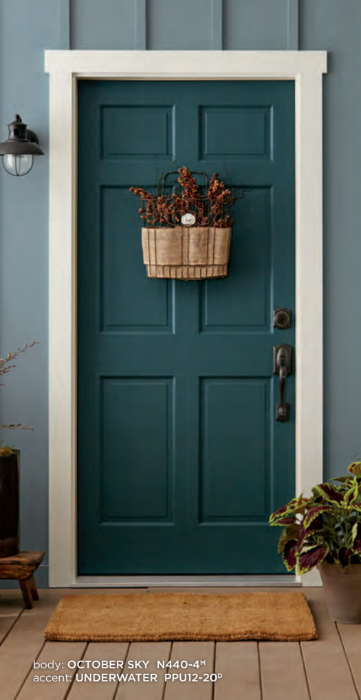
body: OCTOBER SKY N440-4 M accent: UNDERWATER PPU12-20 D