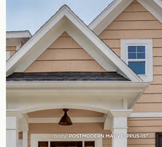
body: POSTMODERN MAUVE PPU5-15 M