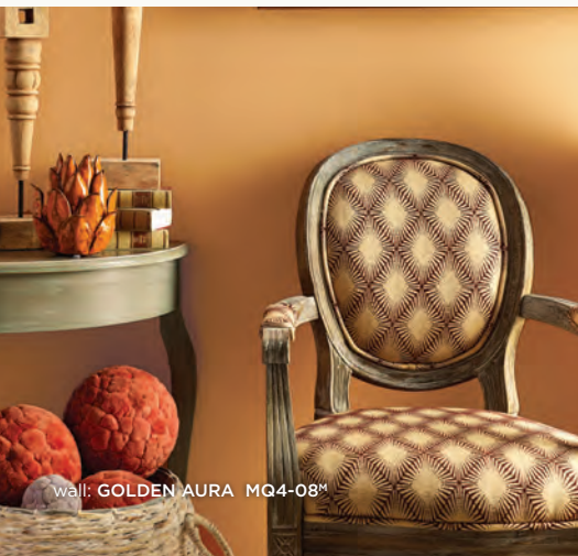
wall: GOLDEN AURA MQ4-08 M