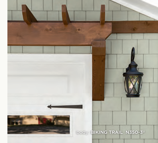
body: BIKING TRAIL N350-3 U