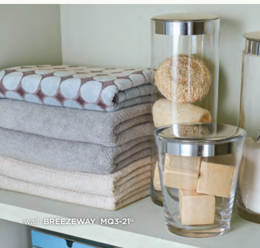
wall: BREEZEWAY MQ3-21 U