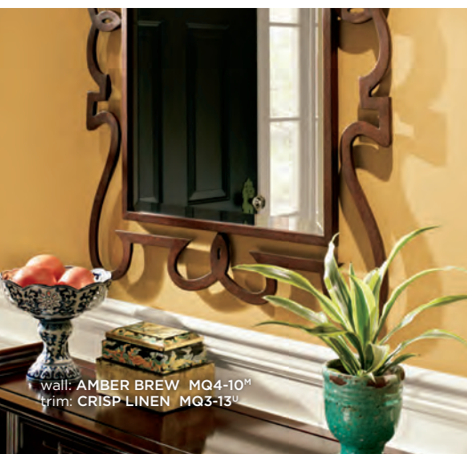
wall: AMBER BREW MQ4-10 ® trim: CRISP LINEN MQ3-13 ®