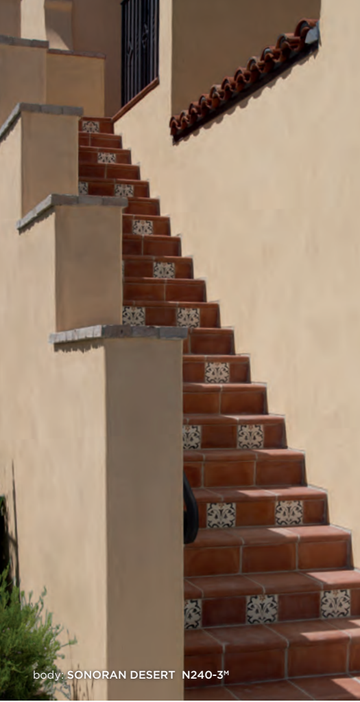
body: SONORAN DESERT N240-3 M