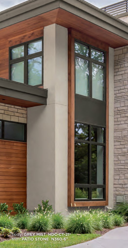
body: GREY MIST ® HDC-CT-21 ® trim: PATIO STONE N360-6 ®