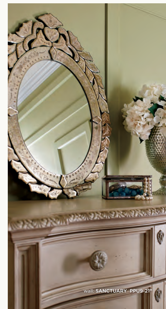
wall: SANCTUARY PPU9-21 M