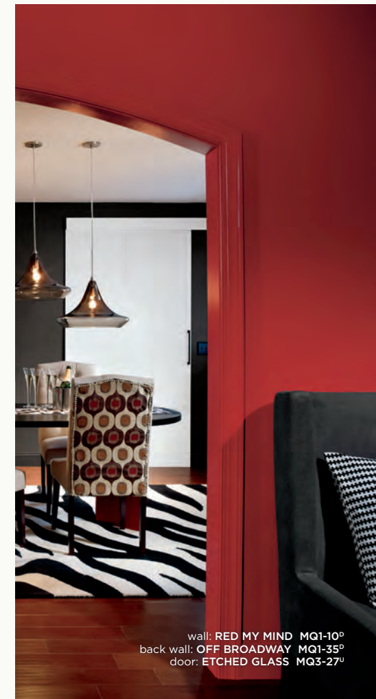
wall: RED MY MIND MQ1-10 D back wall: OFF BROADWAY MQ1-35 D door: ETCHED GLASS MQ3-27 U