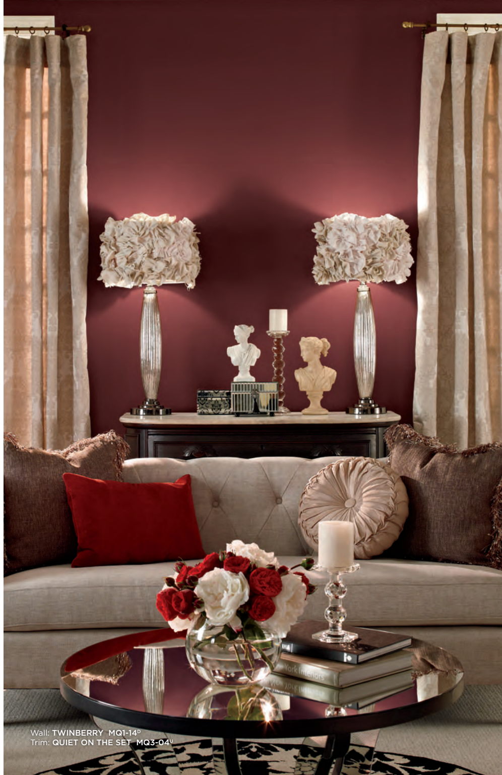
Wall: TWINBERRY MQ1-14 ® Trim: QUIET ON THE SET MQ3-04 ®