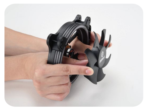
Detachable blade for easy cleaning

Shockproof rubber pads minimize vibration during operation