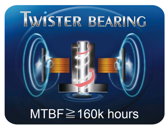
Long life and low noise