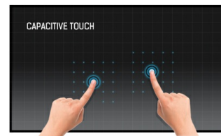
Touch technology - Capacitive

IPS displays are best known for wide viewing angles and natural, highly accurate colours. They are especially suited for colour-critical applications.