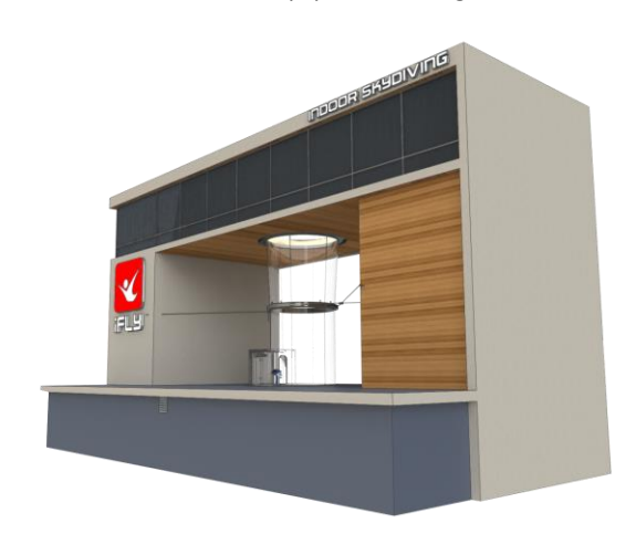
Gen 9 - 14R4 Design Sample