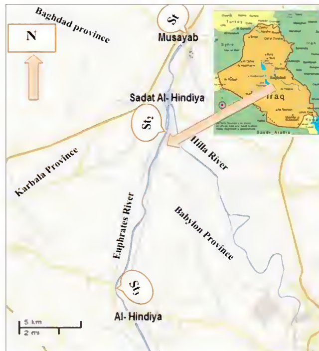
Fig. 1. Map of the study area in the mid sector of River Euphrates, Iraq

Ekman dredge (15X15cm) has been used to collect Surface bottom sediments samples during the study period from October 2013 to June 2014. Three random replicates, were washed with water through 0.2 \mu\text{m} mesh size sieves in the field and then brought to the laboratory. In the large worms, like Tubificid worms were easily sorted with the aid of a magnifier using a white tray for spreading sediment during sorting. For sorting smaller micobenthos worms, like Naidid worms, small amount of sediments were transferred to a clean Petri dish containing little amount of tap water, and the worms sorted carefully using dissecting microscope. Sorted worms were place in a watch class containing little amount of clean tap water, few drops of 4 % formalin was then added drop by drop to the dish to kill the worms. The worms were then preserved in 75% ethanol. For the purpose of identification, the preserved worms were transferred to 30 % alcohol, left for few minute before they transferred to distilled water. A temporary slides were prepared by adding a drop of polyvinyl lactophenol on a microscopic slide and then immersed the worms. The cover slip was added and gently pressed. The slides were left for few days before examined under a compound microscope. Species identification was conducted using appropriate keys [19;7].