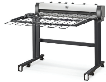
HP Designjet Stacker