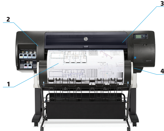
HP Designjet T7200 Production Printer