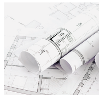
CAD drawings (color and black-and-white)

You can use the HP Designjet T7200 Production Printer to print any combination of applications on a wide range of media from bond paper to glossy photo paper for maximum versatility including: