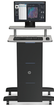
HP Designjet SmartStream