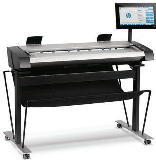
HP Designjet HD Pro Scanner