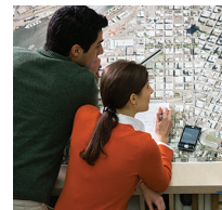
Maps and orotophotos