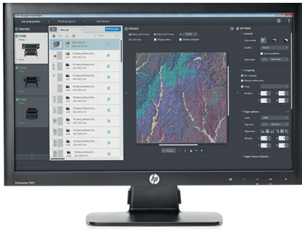
HP Designjet SmartStream

The HP Designjet T7200 Production Printer is ideal for repro houses, central reprographics departments (CRDs), and enterprises looking for correct and easy PDF management that want to boost overall print production and decrease total cost of ownership by increasing efficiency and confidently managing PDFs with HP Designjet SmartStream software.