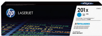
Original HP Toner cartridge with JetIntelligence

Original HP Toner cartridges with JetIntelligence give your business more pages, 3 peak printing performance, and the added protection of anti-fraud technology—something the competition can't match.