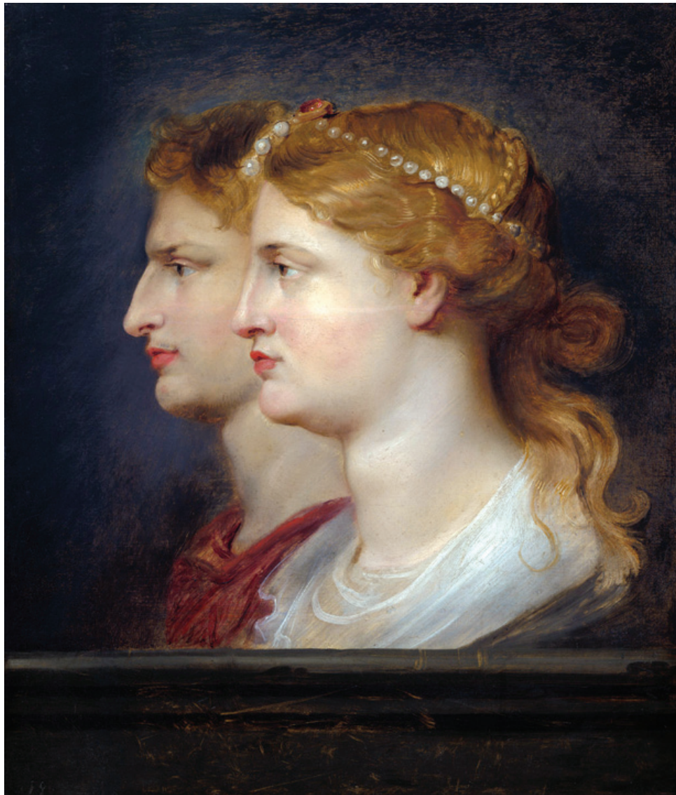
Peter Paul Rubens, Agrippina and Germanicus , c. 1614, oil on panel, National Gallery of Art, Washington, DC, Andrew W. Mellon Fund, 1963.8.1.

Exhibited at the Academy Art Museum, Easton, MD, April 25 – July 5, 2015.