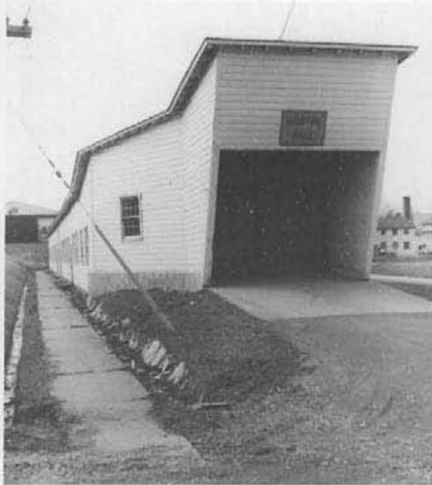
The LST mock-up building at Fort Knox.