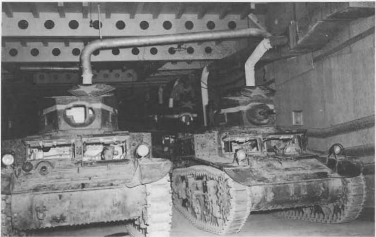
General view of mock-up bay with duct work and hose collectors installed for local exhaust test (above). View of bay from a point just above incline leading to bow opening, with thirty-nine light tanks in position (below).