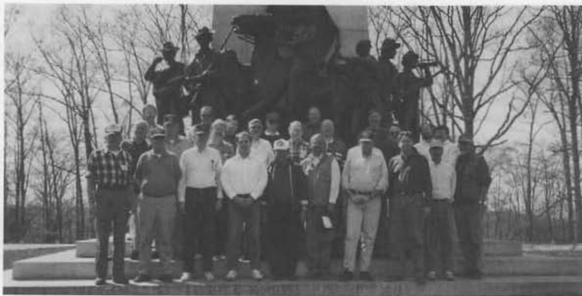
Historians gather at the Virginia Memorial, Gettysburg National Battlefield Park.