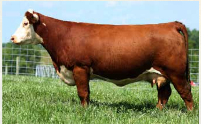
GV CMR MARILYN A315 ET - Lot 108