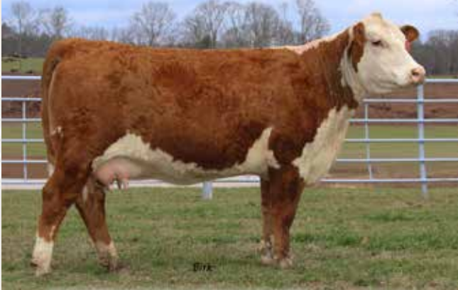
GRNDVW CMR P606 CATALINA Y448ET - Dam of Lot 67.