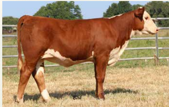
DSB 404C B284 HOLLY 132E - Lot 34A