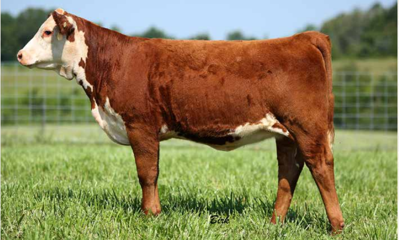
DSB 414Z 332 TRENDA 148E - Lot 14A