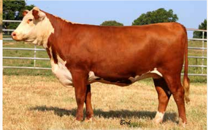
RKH SMITH CAROLINE 223R 5414ET - Lot 201