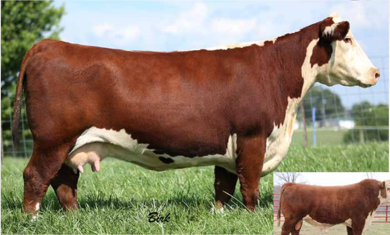
NLC 719T MS GIDGET 1090 - Lot 144