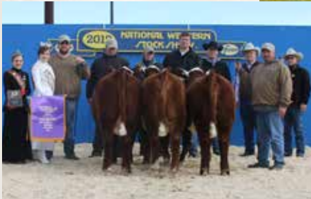
2012 Denver National Champion Pen of 3 Heifers with pen members Lots 1 and 2.