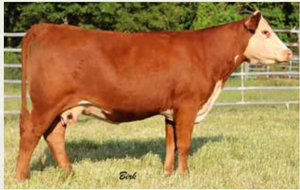
CSR A315 90X MARILYN 101C - Lot 66

It is with great pride that we offer these impressive females. They are sired by some of the elite bulls in the Hereford breed and the heifers and bulls at their side have unlimited potential. These females have certainly exceeded our expectations and we anxiously await your appraisal on Oct 1st.