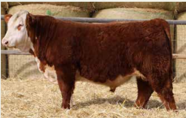
NJW 76S 88X CIRCLEBOSS 157C ET , (pictured as a yearling at NJW) Service Sire and a maternal brother to NJW 76S P20 Beef 38W ET.