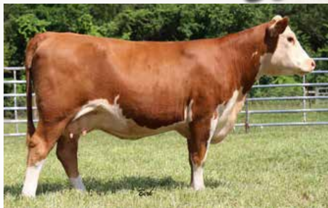
DSB 0051 0124 MISSIE 125C - Lot 39