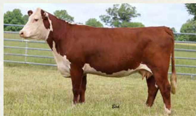
GV CMR 1L BETTY 0109 A177 ET - Lot 88