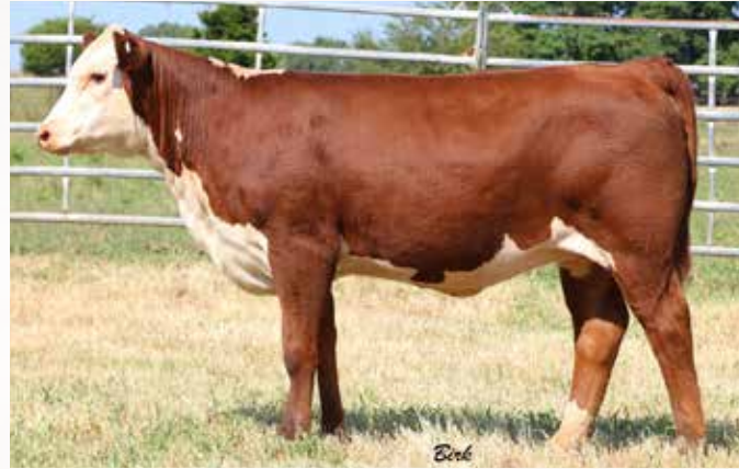
DSB 403C B284 HOLLY 327D - Lot 33A