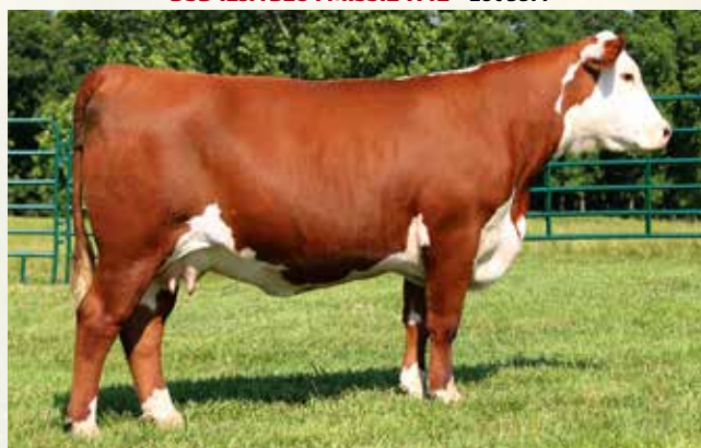
LF CMR Y311 LADY DOM 94B - Lot 40