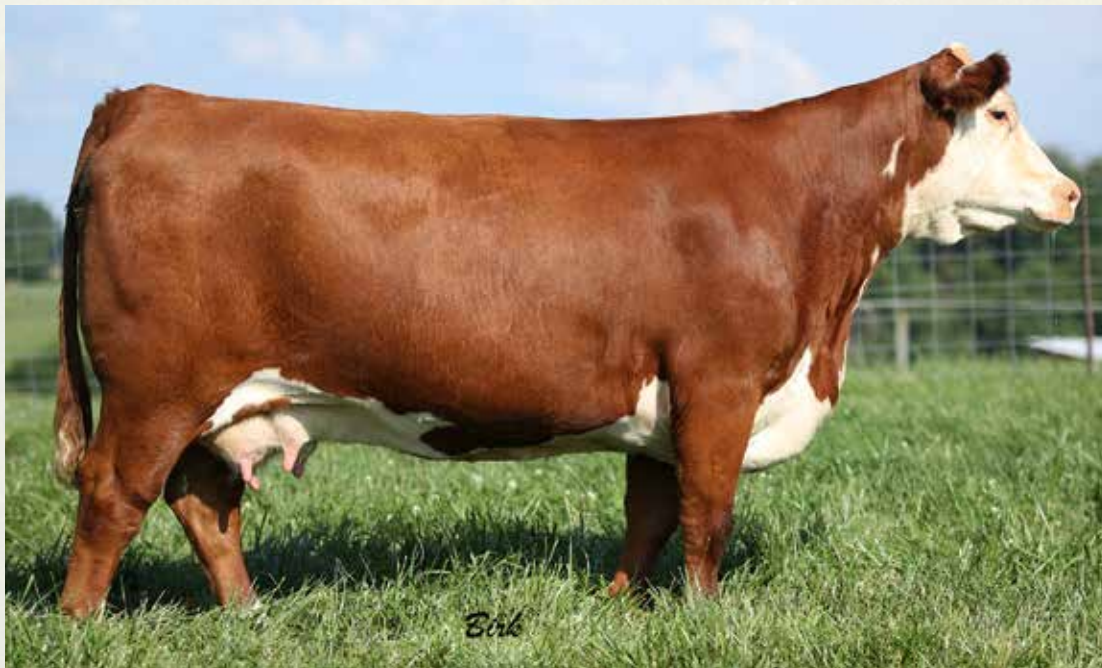
TH 38M 755T DANI 167X - Lot 153