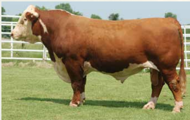
GV CMR STRONG 156T Y449 ET - Sire of Lot 73.