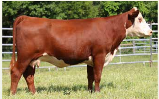
DSB 1X 50S GLORIA 140C - Lot 44