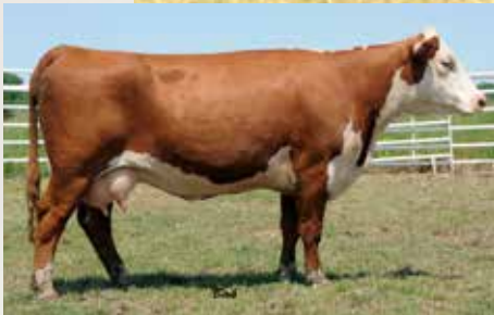
CMR MS P606 JENNY 58T 278T ET Dam of Lot 232.