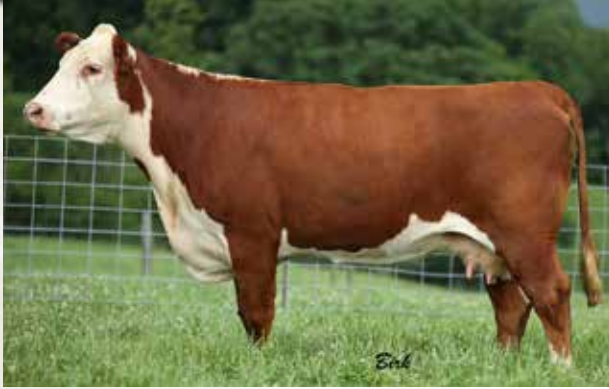
TH 358 755T VICTRA 89X - Lot 174