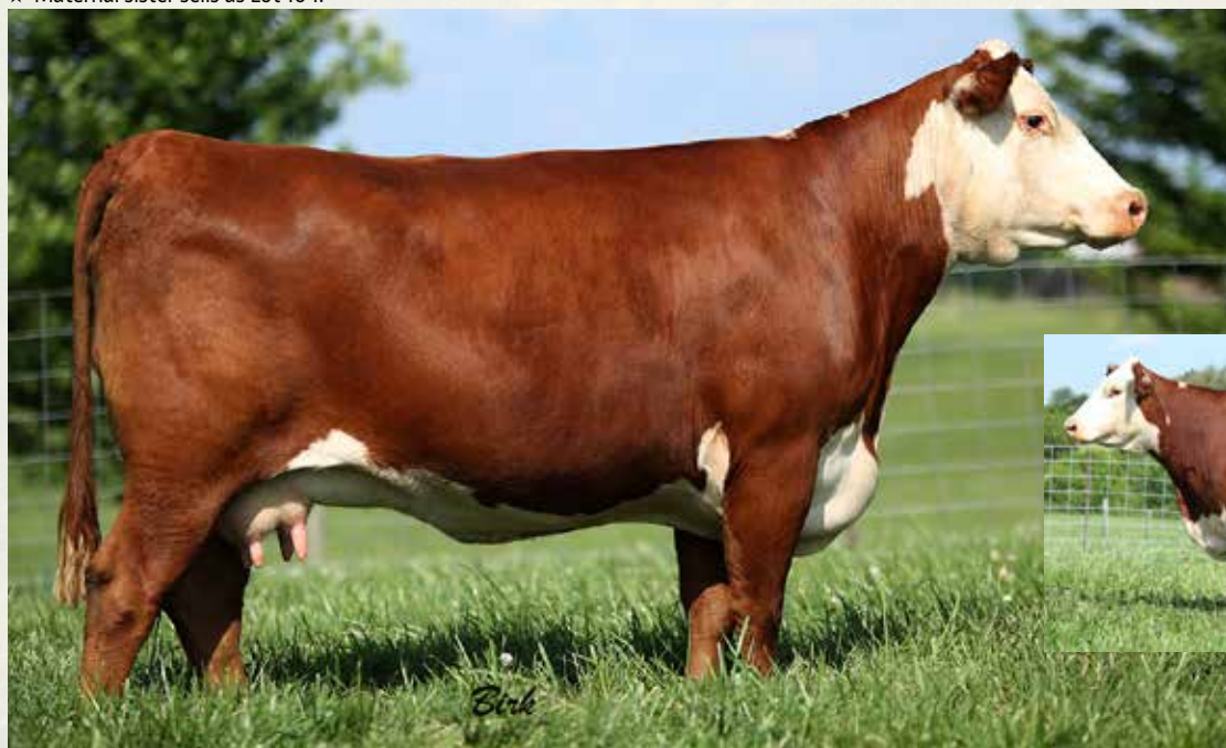
TH 89T 719T GEMINI 504Z - Lot 132