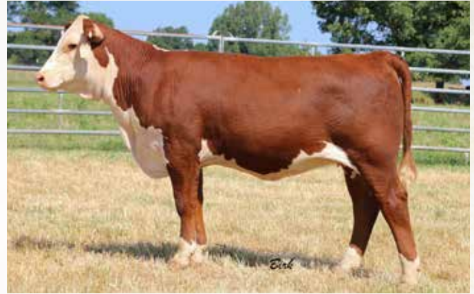
DSB 41819 B284 NANCY 125E - Lot 78A