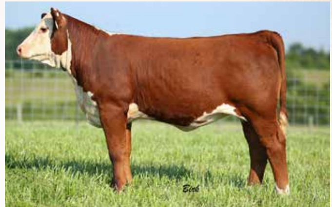
DSB 2832 332 REBA 170E - Lot 163A