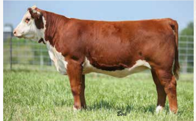
DSB 19X 332 DANI 131E - Lot 139A