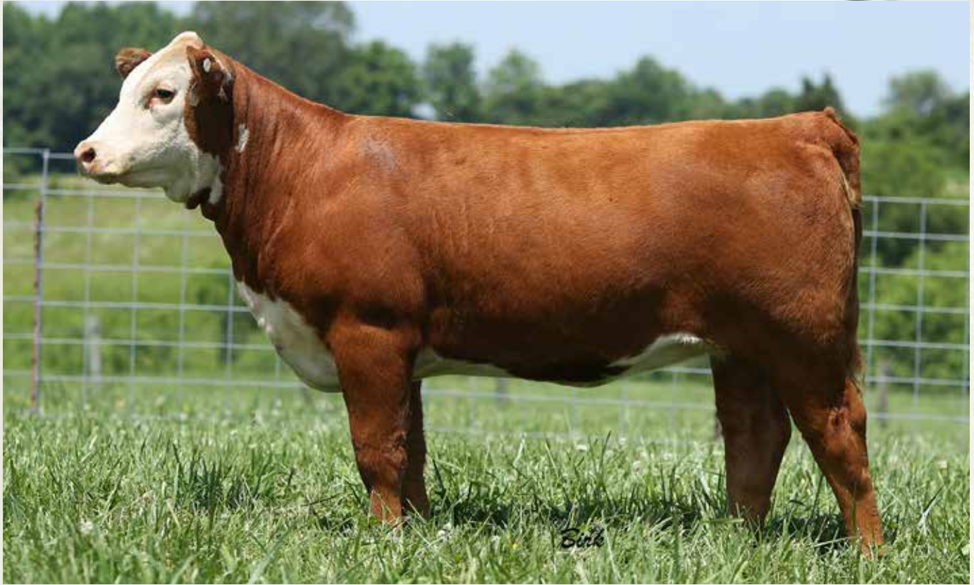
DSB 7155 X51 DOMINETTE 311D - Lot 157A