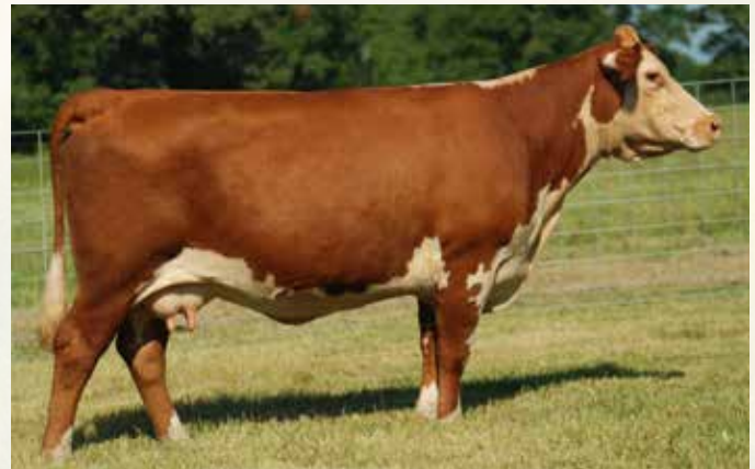
PF P606 ALEXIS 67 - Dam of Lot 120.