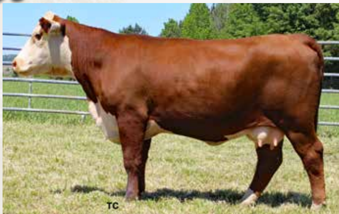
DSB 29X 50S GLORIA 185C - Lot 45