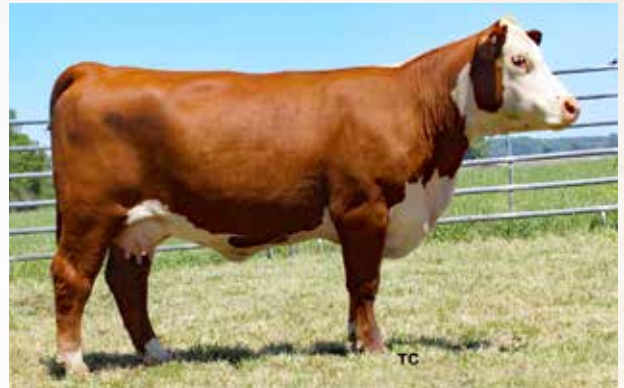
DSB Y21 332 VICTORIA 177C - Lot 54