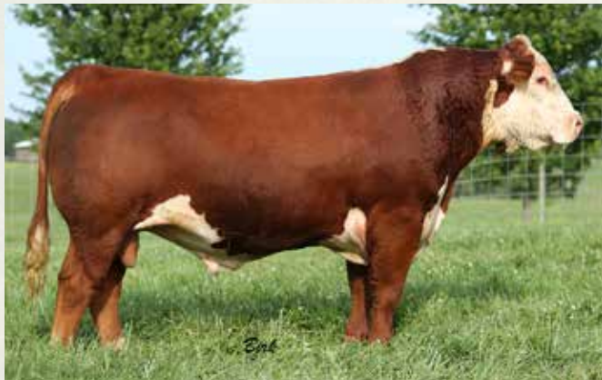
DSB 120W EQUITABLE 416B ET Son of Lot 9, selling as Lot 230.