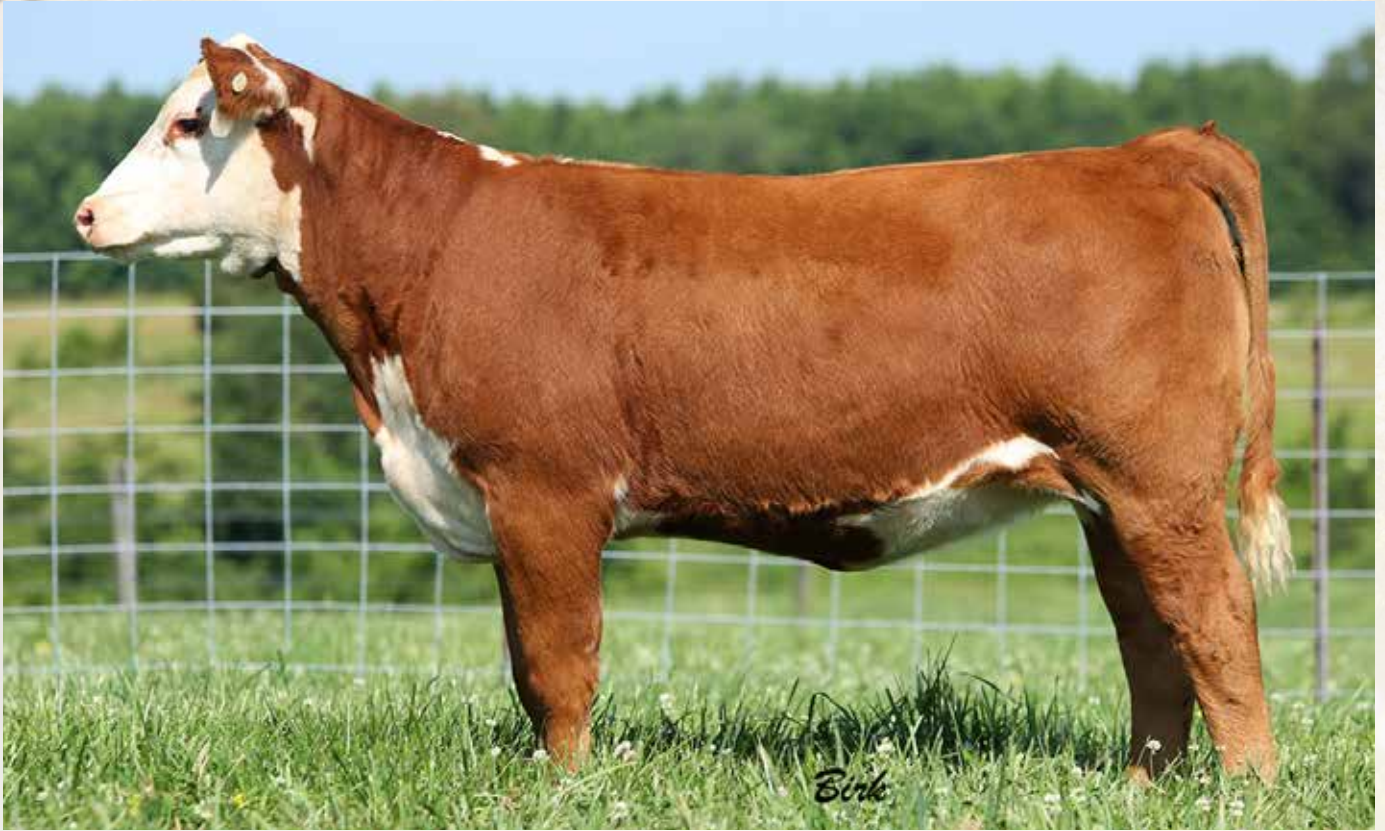
DSB 102W X51 CALLICO 305D - Lot 159A