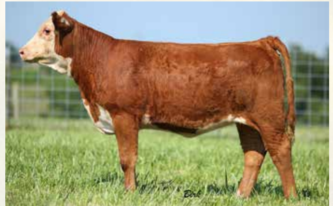
DSB 13X 332 VICTRA 167E - Lot 140A