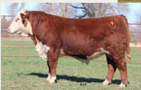
SHF CANNON Z210 C95 - Sire of Lot 1A.