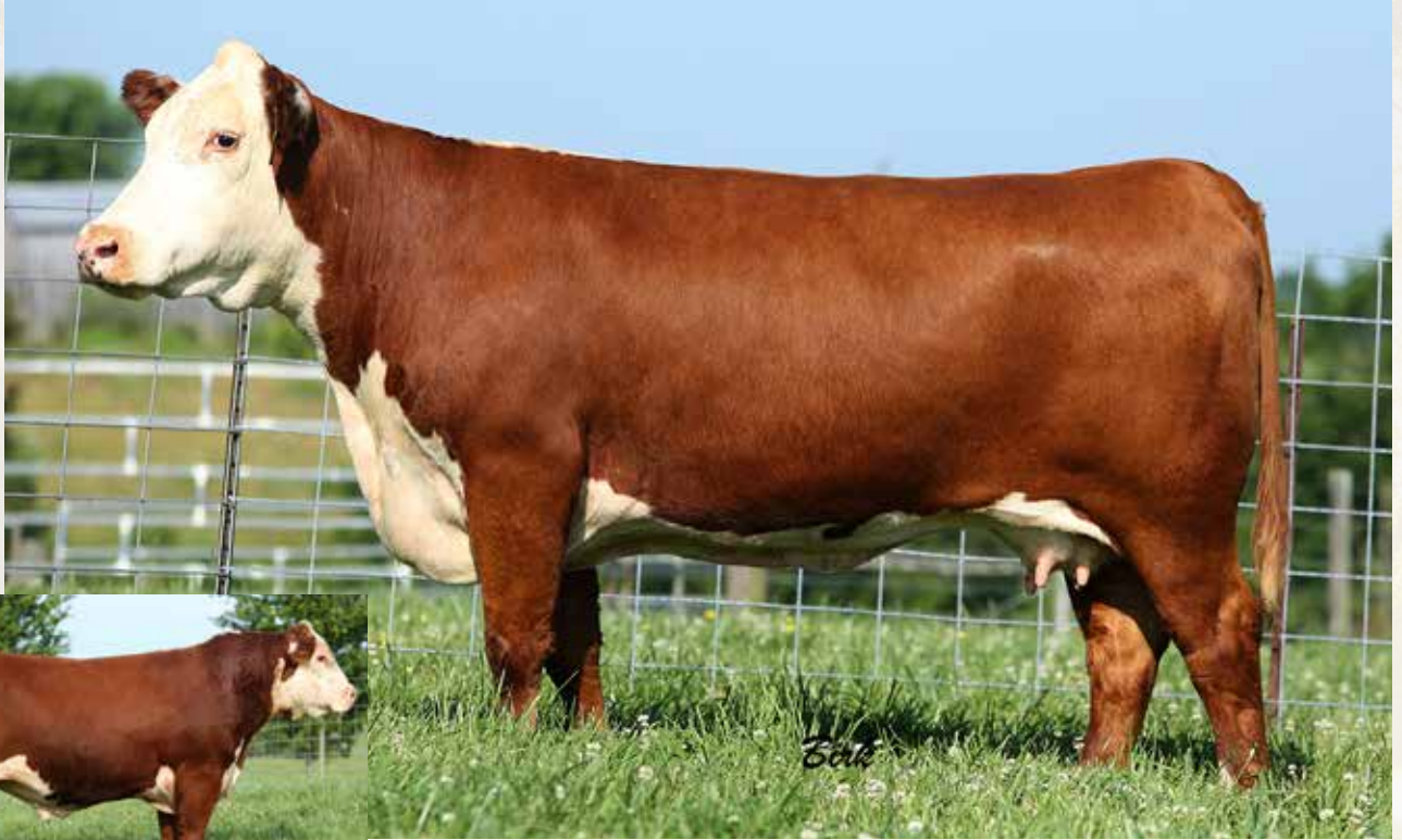
NLC 719T MS BETTY 1056 - Lot 133

DSB 120W EQUITABLE 416B ET Service Sire, selling as Lot 230.