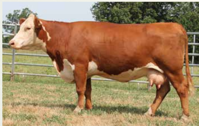
3D 40U ALEXIS 37A - Lot 120