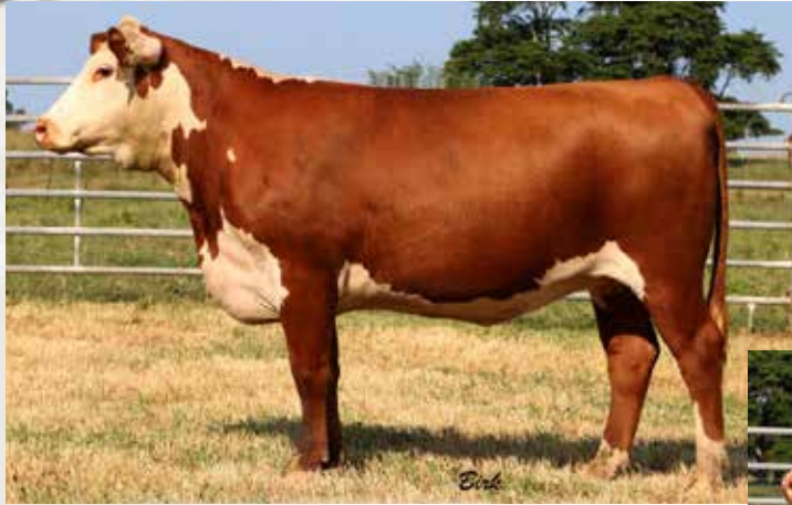
RKH SMITH CAROLINE 223R 5411ET - Lot 200