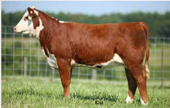
DSB 448X 332 DONNA 122E - Lot 11A

★ AI on 5/8/17 to NJW 135U 10Y Hometown 27A. ★ PE 5/12 to 6/30/17 to DJB BCB R117 Sinatra 14C ET. Safe PE.