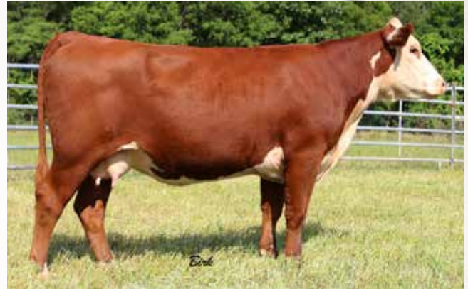
DSB 8106 50S DOLLY 329B - Lot 43