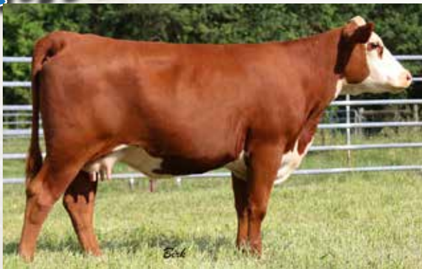
DSB 742 50S GLORIA 132C - Lot 59