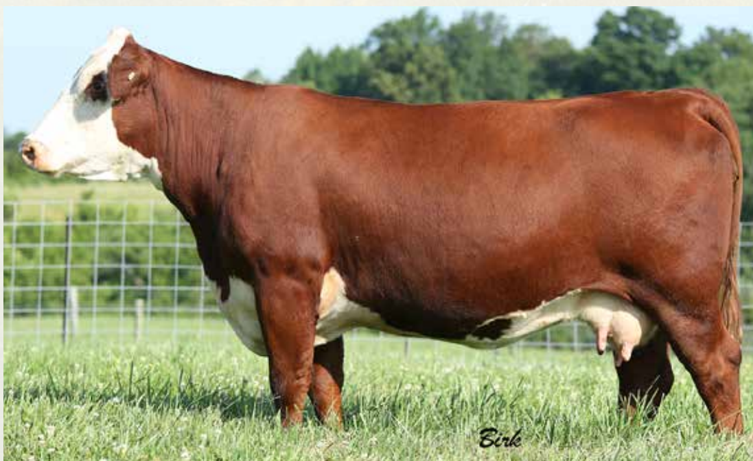
WLB WINCHESTER 50S GLORIA 128Z - Lot 154