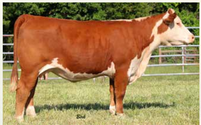
DSB 90Y 332 ELLIE 156C - Lot 28