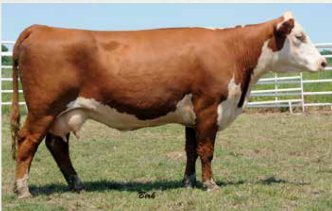
CMR MISS P606 JENNY 58T 278T ET - Dam of Lot 210.