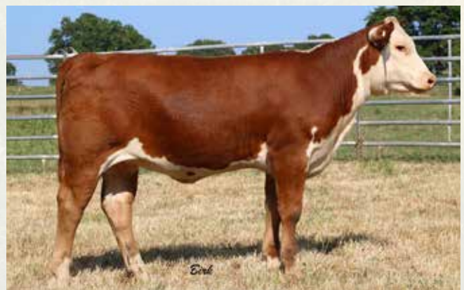
DSB 156C B284 ELLIE 107E - Lot 28A