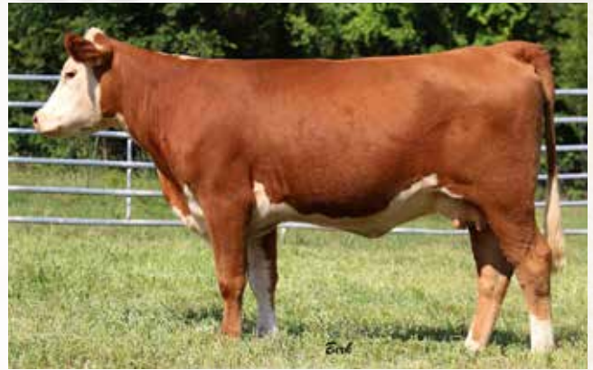
KCF MISS 936 B339 - Lot 31