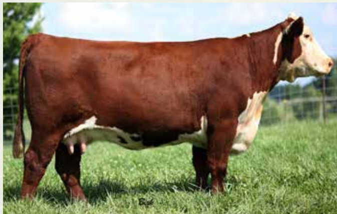
DMR VICTORIA 408Z ET - Lot 150