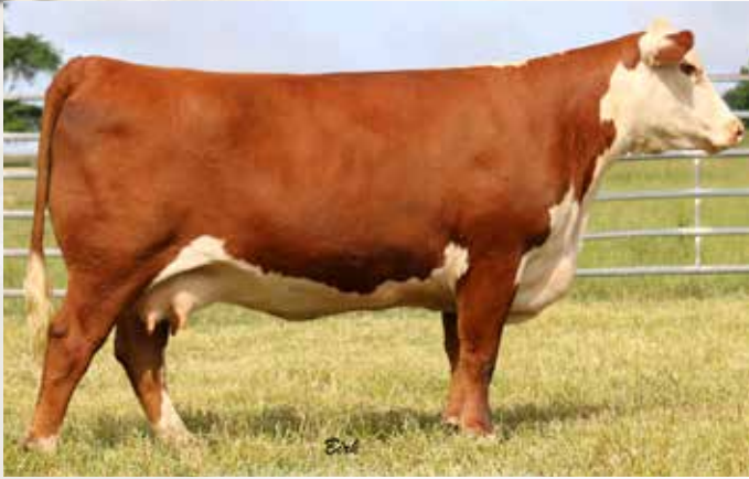
GRANDVIEW CMR MS 424 X151 ET Dam of Lots 225 and 226, selling as Lot 4.