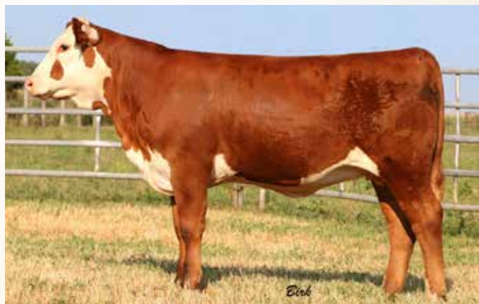
CMR C95 731 MISS E112 - Lot 7A