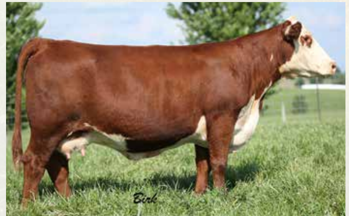
TH 505U 719T BURGUNDY 83X - Lot 145