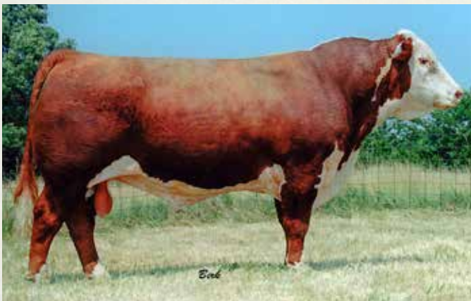
PW VICTOR BOOMER P606 - Sire of Lots 193-199.