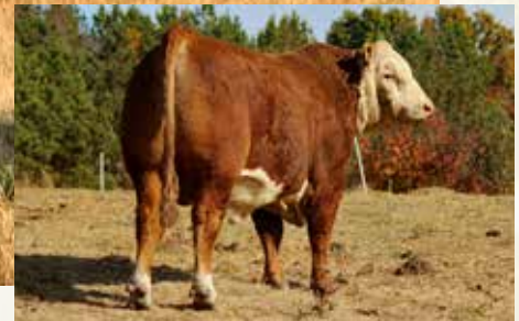
INNISFAIL WHR X651/723 4013 ET Sire of Lots 92A and 93A.