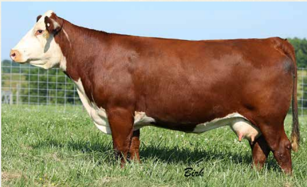
TH 74U 719T DOMINETTE 58X - Lot 143