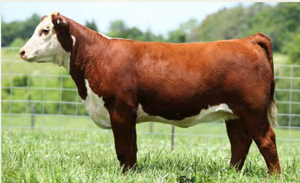
DSB Y143 B284 HOLLY 318D - Lot 2A