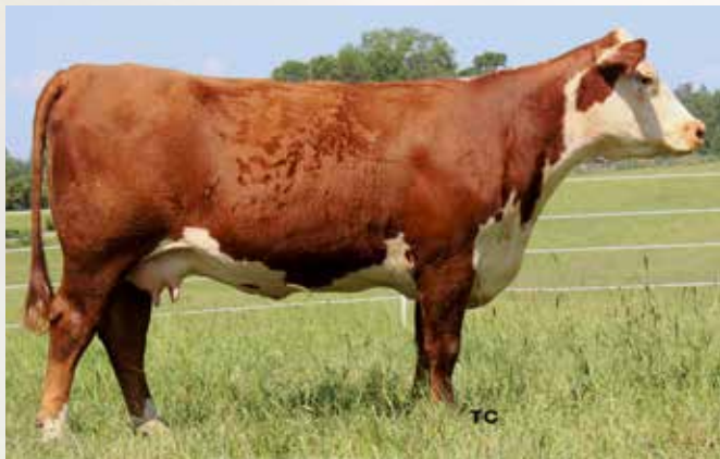
DMR VICTORIA 201Y - Lot 184