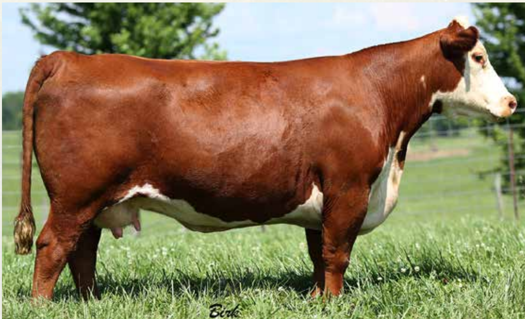
SPARKS 120W R23W DOMA Y24 - Lot 10