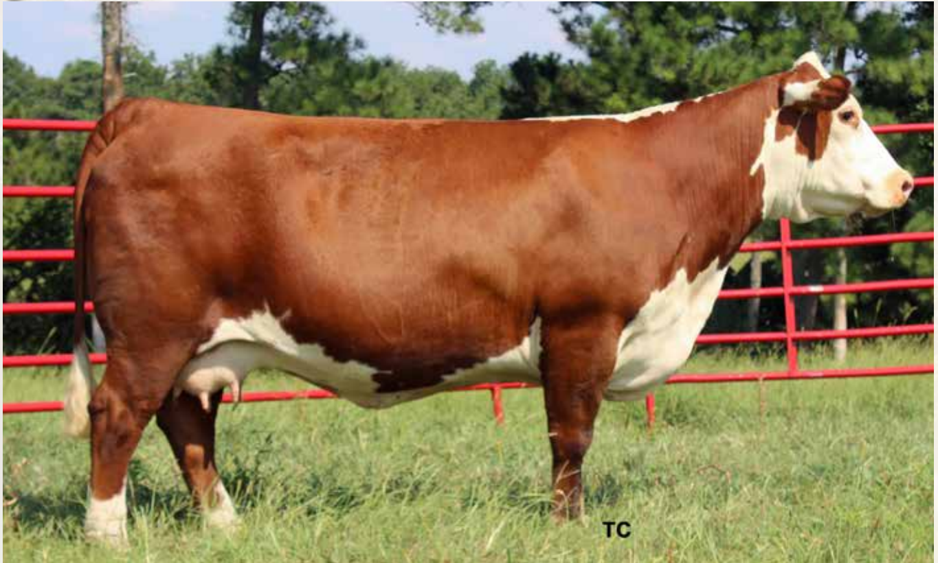
TH 122 45P DOMINETTE 120W - Lot 9