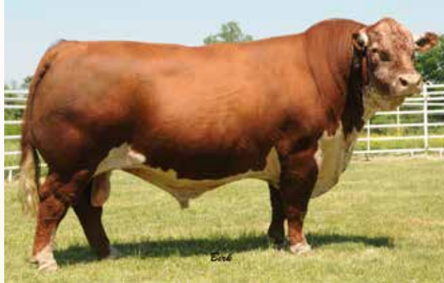
CMR GVP MR MATERNAL 156T - Sire of Lot 116.