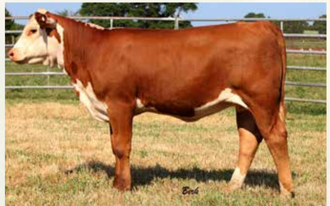
DSB 4131 B284 DOLLY 323D - Lot 22A