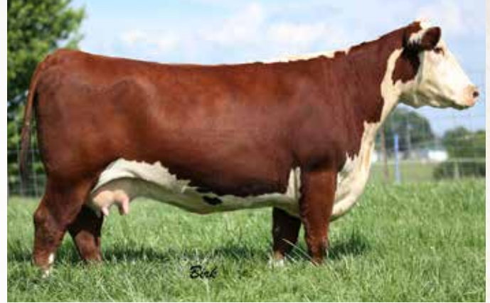
NLC 719T MS GIDGET 1090 - Dam of Lot 216, selling as Lot 144.