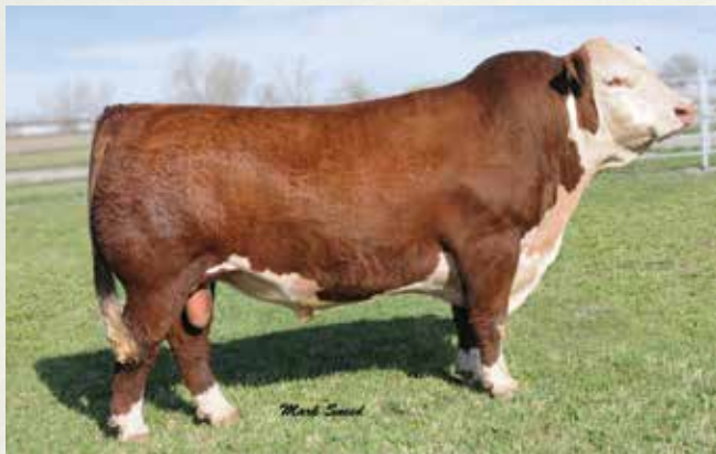
TH 122 71I VICTOR 719T

Full brother to Lots 11, 12 and 13. 19 daughters of 719T sell.