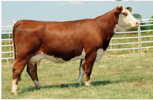
GRANDVIEW LADY PATRIOT 7171 ET - Dam of Lot 115.