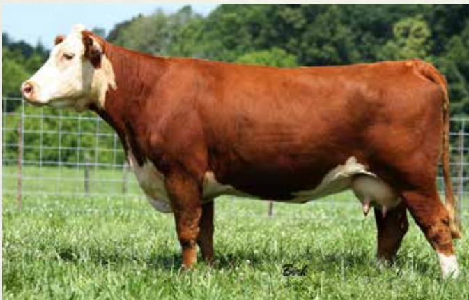
NLC 719T MISS LASS 1116 - Lot 141