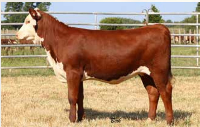
DSB 411B 111B DONNA 124E - Lot 25A