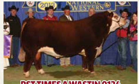
RST-TIMES A WASTIN 0124

719T has stood the test of time and his progeny are some of the elite in the breed today. 19 daughters of 719T sell, along with 3 full sisters.