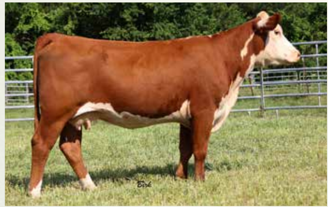
CSR U601 2059 LASS 413B ET - Lot 30