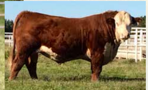
KCF BENNETT INFLUENCE Z80 Full brother to Lot 24.