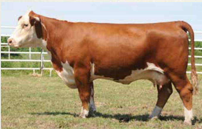
GRANDVIEW CMR MISS SUPER 9324ET Dam of Lots 228 and 229 and donor dam for Atlas Polled Herefords.

225 CMR Z311 X151 MISS D651 ET Calved: 11/16/2016 Cow P43821076 Tattoo: D651 Polled