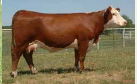
DJB BCB R117 SINATRA 14C ET - Lot 231