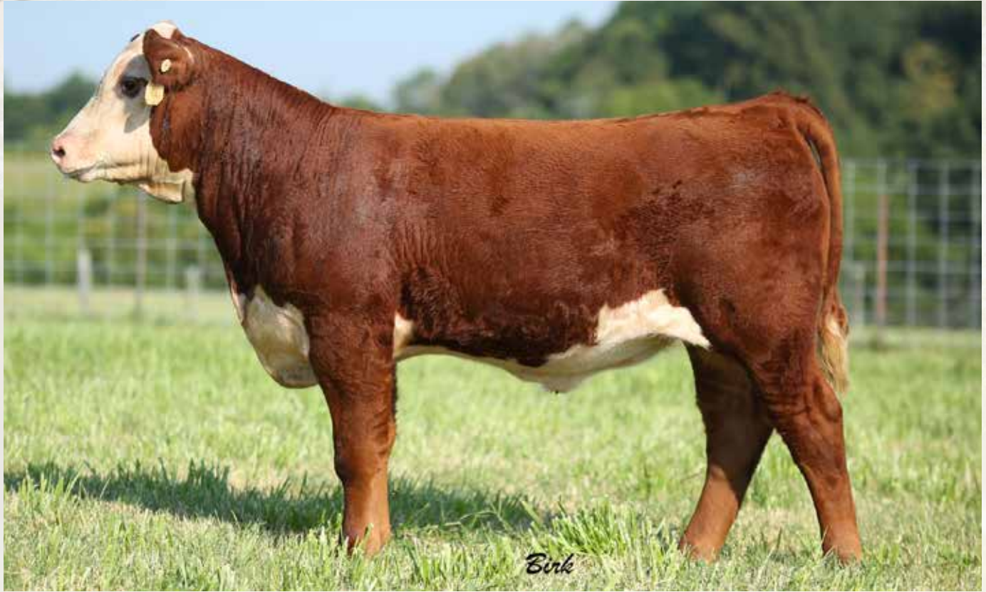
DSB 6X 10Y HOMETOWN 171E - Lot 146A