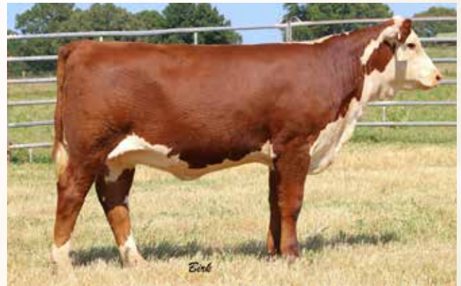
DSB 329B B284 DOLLY 139E - Lot 43A