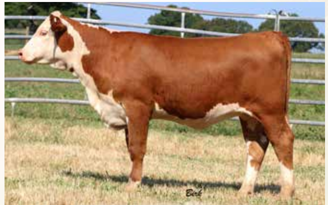
DSB B339 200Z TARON D302 - Lot 31A