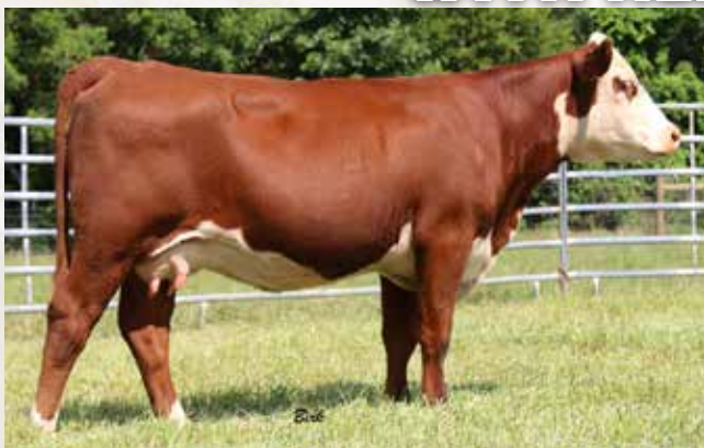
DSB 406Z 0124 VICTORIA 142C - Lot 37

37 DSB 406Z 0124 VICTORIA 142C DLF,HYF,IEF Calved: 01/24/2015 Cow P43563507 Tattoo: 142C Polled