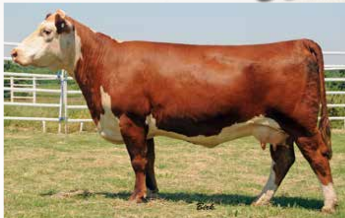
WPHF PRM JH MISS 13P 143L 731 - Lot 7