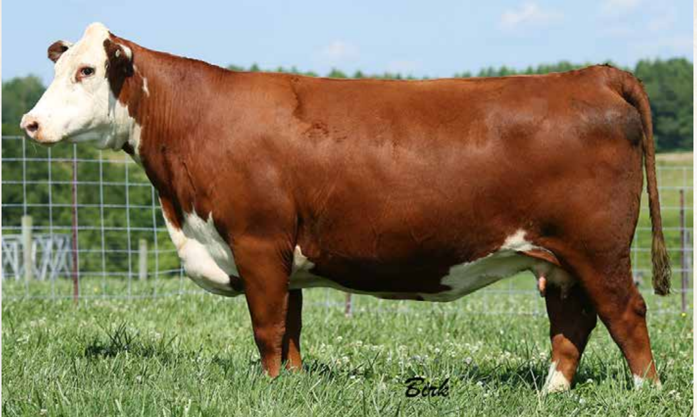
TH 14H 45P SUZIE 30X - Lot 189