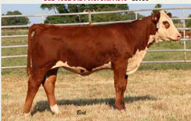
DSB 131C B284 VICKIE 160E - Lot 38A

38A DSB 131C B284 VICKIE 160E Calved: 02/07/2017 Cow P43794964 Tattoo: 160E Polled