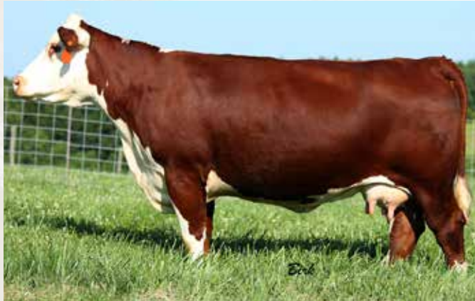
WLB 83T ELLIE 90Y - Sire of Lot 165.