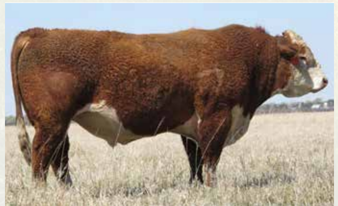
HYALITE ON TARGET 936

Full brother to Lots 11, 12 and 13. 19 daughters of 719T sell.