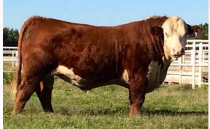
KCF BENNETT INFLUENCE Z80 - Full brother to the Sire of Lot 170A.