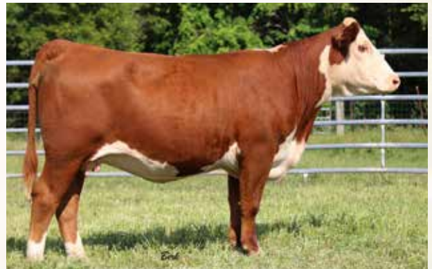
DSB 71Y 0124 SAMANTHA 121C - Lot 55