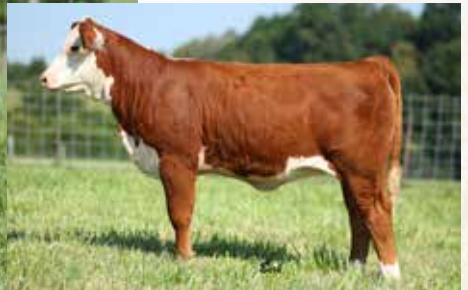
DSB 120W EQUITABLE 416B ET - Lot 230