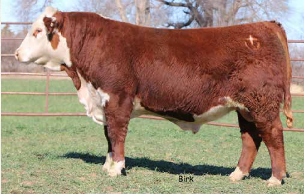
SHF CANNON Z210 C95 - Sire of Lots 83A-86A.