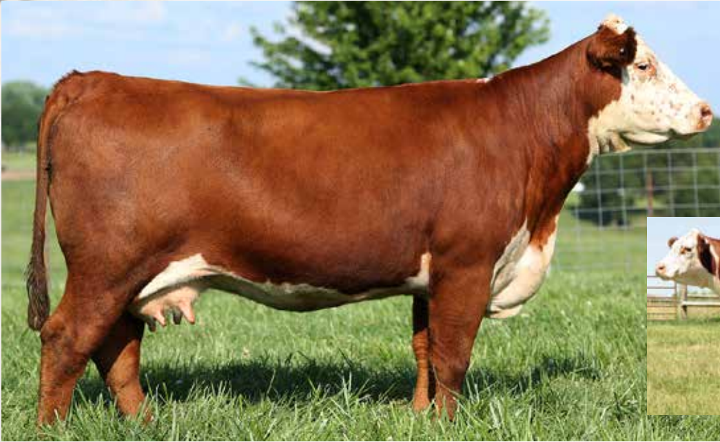
NJW 78P88X LADYSPORT 186Z ET - Lot 18