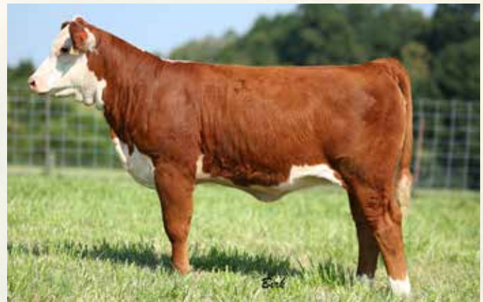
DSB 2222 416B LETTIE E117 - Lot 164A

If you are unable to attend this sale and would like to place a bid or have any questions, please call us or any of our sale staff listed on page 1. The sale will be broadcast live on DV Auction. www.dvauction.com