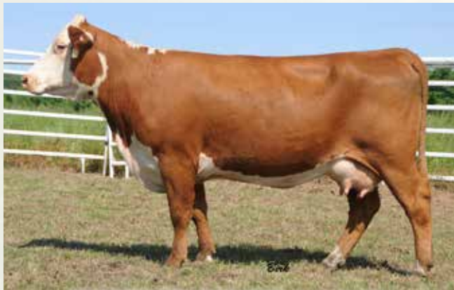
GRANDVIEW CMR MS P606 X103 - Dam of Lot 68.