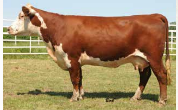
GRANDVIEW CMR P606 LASS U601ET - Dam of Lot 70