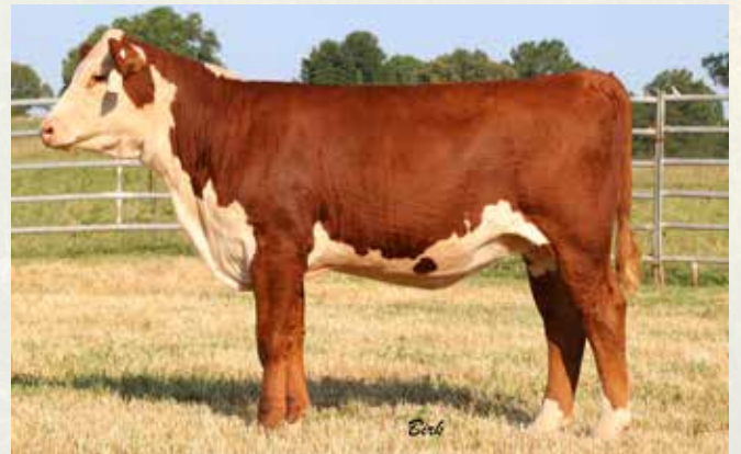
DSB 161C B284 VICKIE 101E - Lot 48A

The Dispersal Sale offers you an opportunity to select from 220 Registered Hereford Females, bred to start calving Jan 6th to Registered Hereford Bulls and 190 Open Heifers and Bulls that are 8 to 11 months old. They are adapted to the Southern Environment and ready to work in your program.