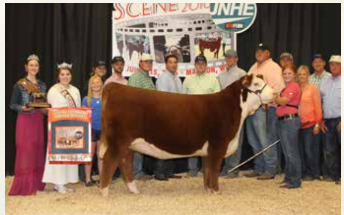
ECR CANDI 5451 ET - 2016 JNHE Champion Hereford Female and paternal sister to Lot 89A.