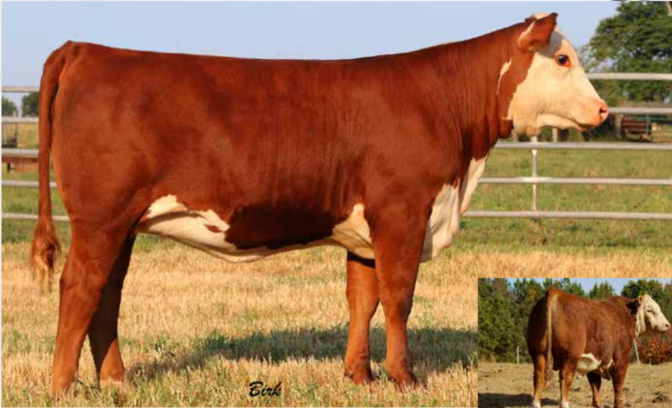
CMR 4013 A296 MISS E80 - Lot 92A