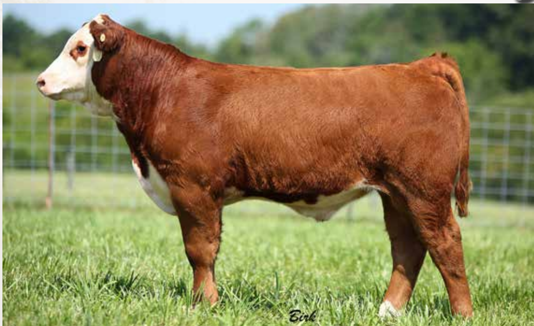
DSB 128Z LONGMIRE 203E - Lot 154A