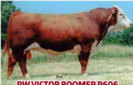
PW VICTOR BOOMER P606

P606's legacy continues.... 15 daughters of this Breed Icon sell!