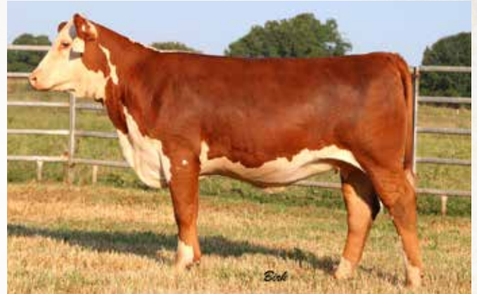
DSB 412B 111B LASS 133E - Lot 29A