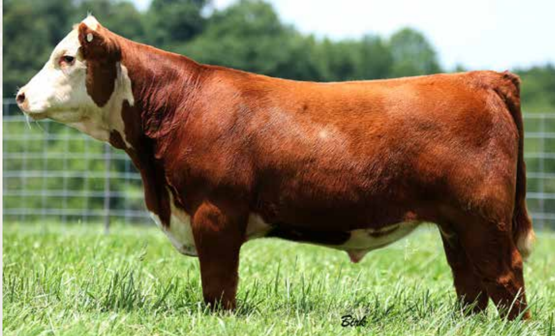
DSB 167X X51 REVOLUTION 309D - Lot 153A