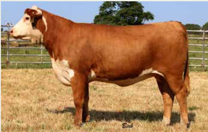
RKH SMITH RENEE 3C12 5P27 ET - Lot 198