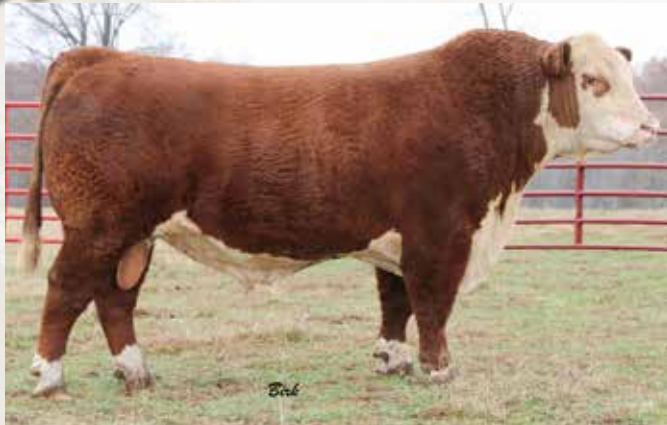
WALKER AUTHOR X51 W19 332 - Sire of Lot 163A.