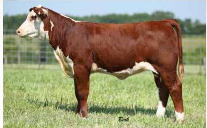
DSB 90Y 407B ELLIE 204E - Lot 165A