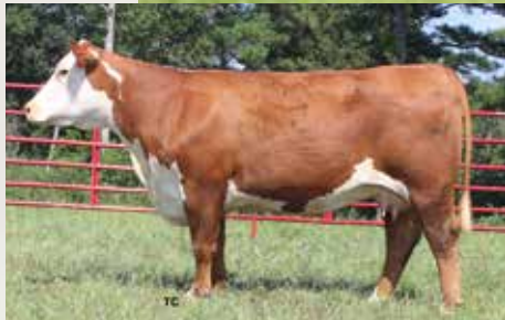
DSB 125A 10Y VICKIE 157E - Lot 102A