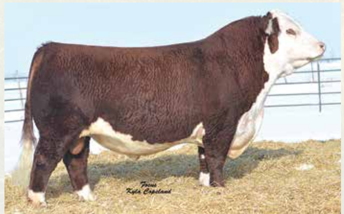
CRR 719 CATAPULT 109 - Sire of Lot 127A.