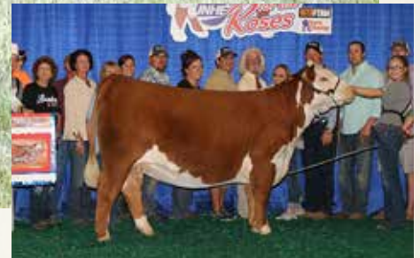
BR AMY RIELLE 5538 ET 2017 JNHE Bred and Owned Champion Female and paternal sister to Lot 19A.