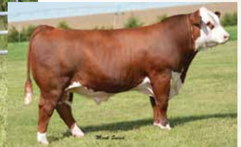
R LEADER 6964 AI Service Sire.