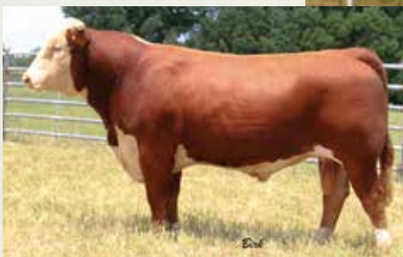
CMR A152 RIGHT TIME C215 ET Service Sire, selling as Lot 232.