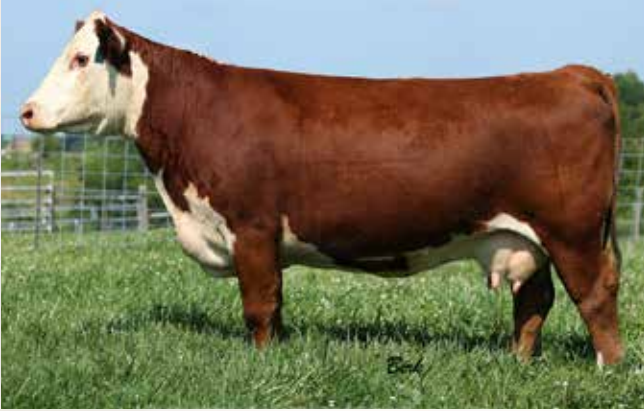
TH 99U 719T VICTORIA 146X - Lot 136