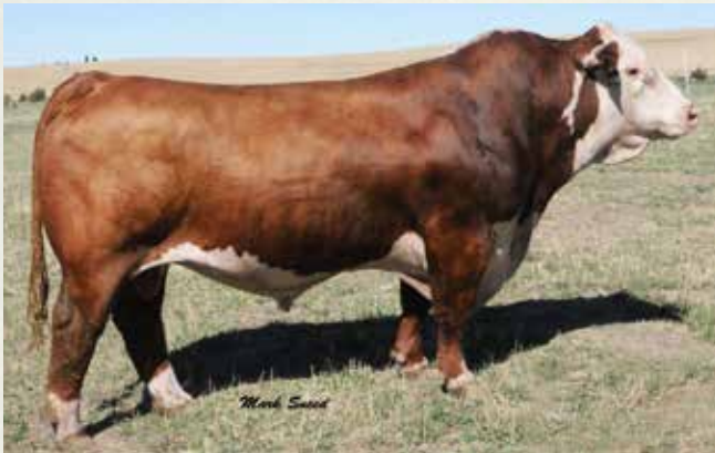
TH 223 71I VICTOR 755T - Maternal brother to Lot 15.