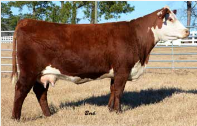
CES BLOOM 145R H100 Dam of Lot 227 and donor dam for Stonegate Farm.