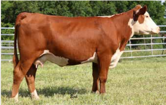
DSB 33X 50S GLORIA 165C - Lot 47