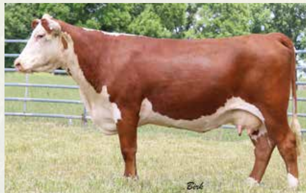
GV CMR L1003 MISS 860U Z218 ET - Dam of Lot 204, selling as Lot 123.