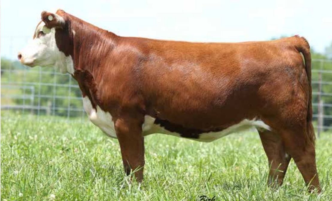
DSB 504Z 10Y GEMINI 308D - Lot 132A