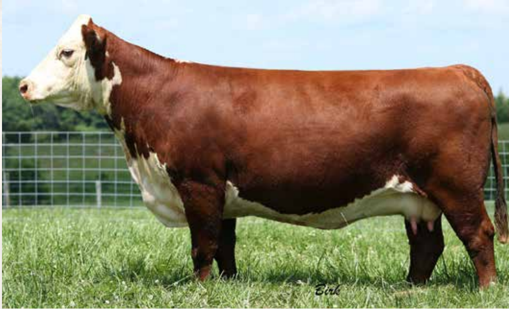
TH 202T 719T WILDROSE 32X - Lot 142