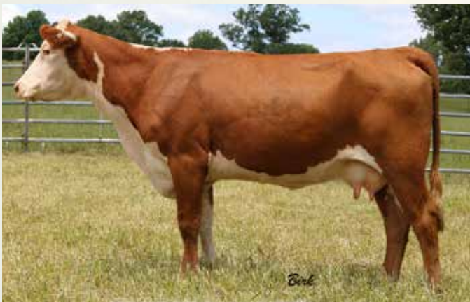
CMR 8050U X414 LADY A707 ET - Lot 79