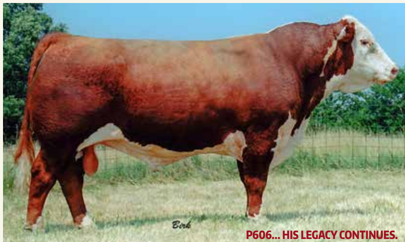
P606... HIS LEGACY CONTINUES.

Dispersal will include the DRUMMOND SPARKS BEEF herd unit in its entirety!