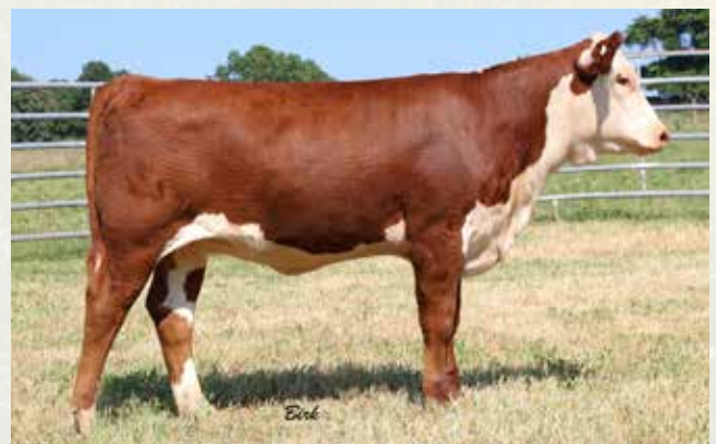
DSB 140C B284 GLORIA 325D - Lot 44A