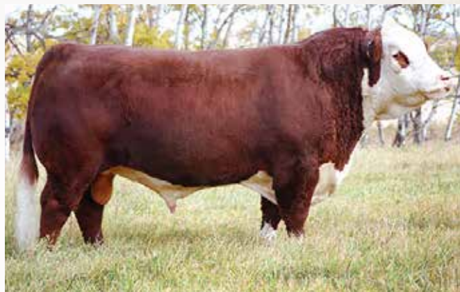
WLB GLOBAL 72M 50S - Sire of Lots 43-48.