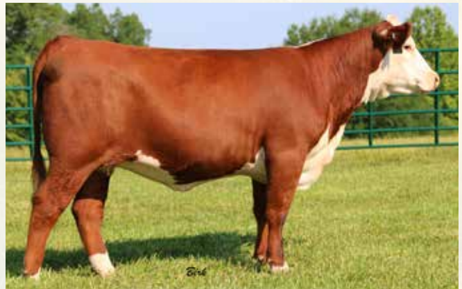
LF CMR 0109 SUZIE 90C - Lot 223