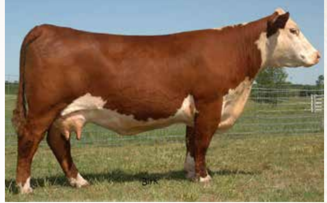
HAROLDSONS WLC MONA ET327N - Dam of Lots 89 and 90.