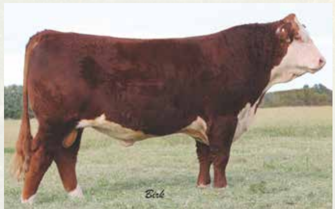
MPH Z3 BOXTOP C16 - AI Service Sire.