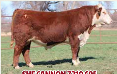
SHF CANNON Z210 C95

Times A Wastin is the 2013 Denver National Champion Bull. His progeny are among the most sought after in the breed. Selling 13 daughters in production and 2 bred heifers sired by 0124.