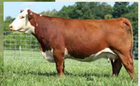
TH 89T 755T GEMINI 447A Maternal sister to Lot 132, selling as Lot 104.