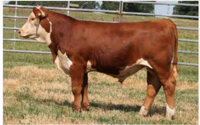
3D CMR 904B ECHELON 706E - Lot 120A