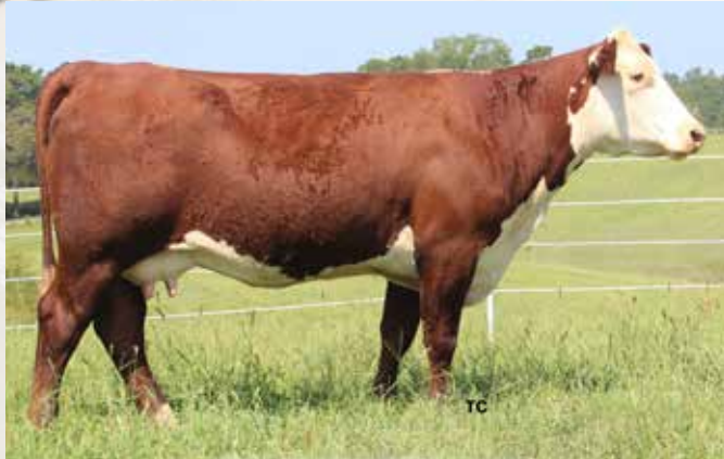
DMR Y143 HOLLY 122A - Lot 99