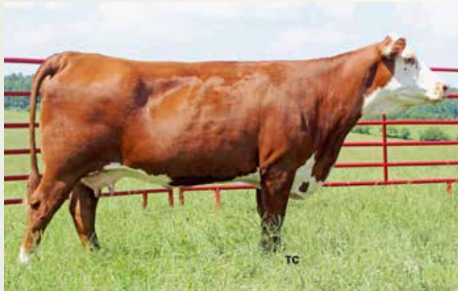
TH 599 719T VICTRA 13X - Lot 141