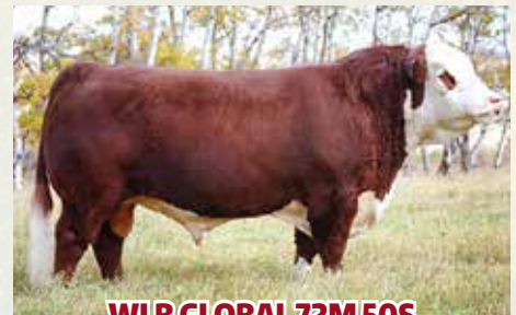
WLB GLOBAL 72M 50S

With the genetics of A723 you combine two of the highest maternal bulls in the breed, 8050 and P606. A723's progeny will not disappoint you. Selling 4 bred heifers, 6 open heifers and 8 bulls sired by A723.