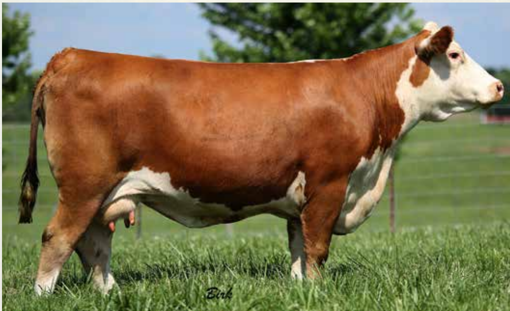
TH 42R 112U EMBRACE 184X - Lot 182