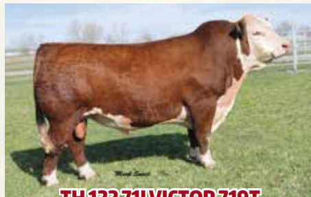
TH 122 71 VICTOR 719T

Hometown is a past Denver National Champion and a trait leader in 14 traits. Hometown has 231 daughters in production with a nursing ratio of 101.5. 13 progeny of Hometown sell, including herd sire prospects and exceptional open heifers.