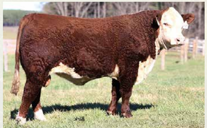
KCF BENNETT PROVIDENT B284 - Sire of Lot 141A. $47,000 high selling bull of the Dec. 2015 Knoll Crest Farm bull sale.