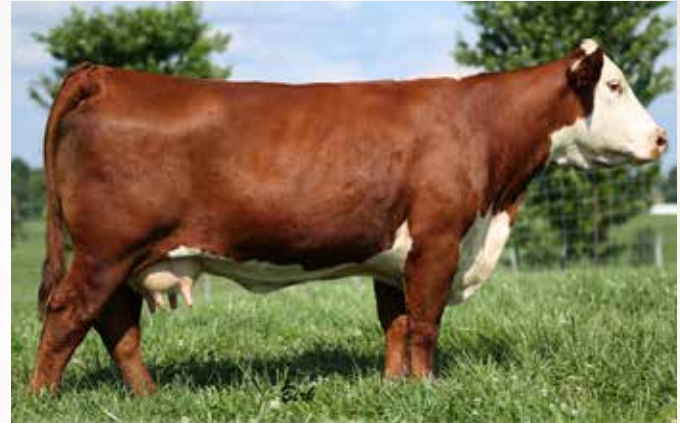
GRNDVIEW CMR P606 HOLLY Y143ET - Dam of Lot 99, selling as Lot 2.