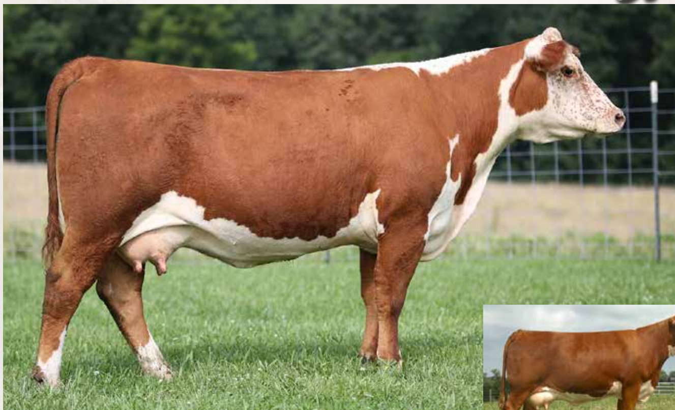
GRNDVW CMR 156T MATTIE Y511 ET - Lot 87