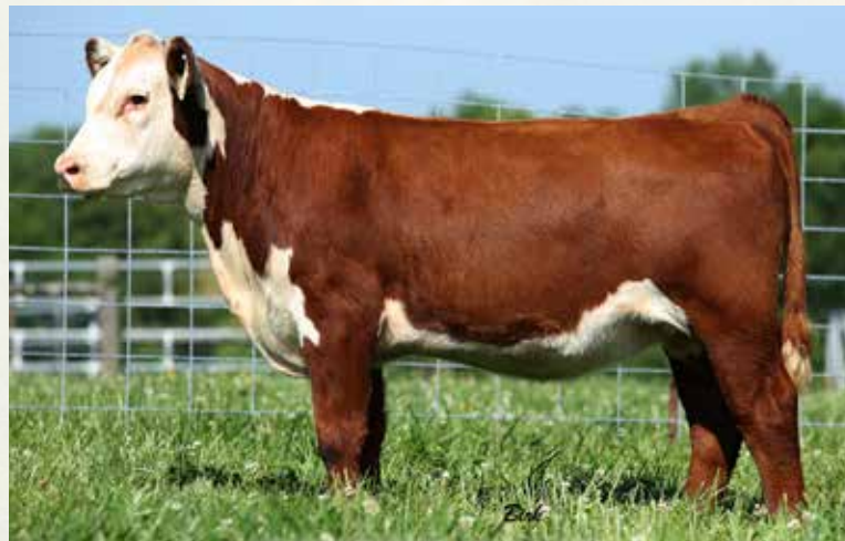
DSB 5001Y 3116 ENID 319D - Lot 166A