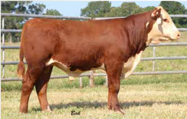
DSB 406B 104C CALLIE 127E - Lot 41A