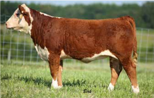
DSB 146X 10Y VICKI 155E - Lot 136A