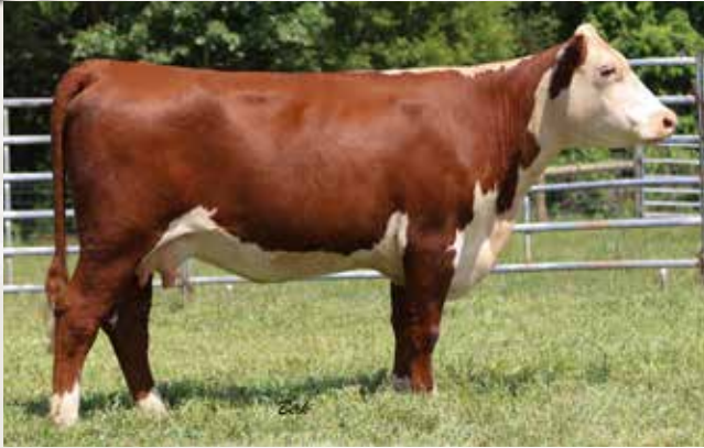
DSB 61235 11X CALLIE 406B ET - Lot 41