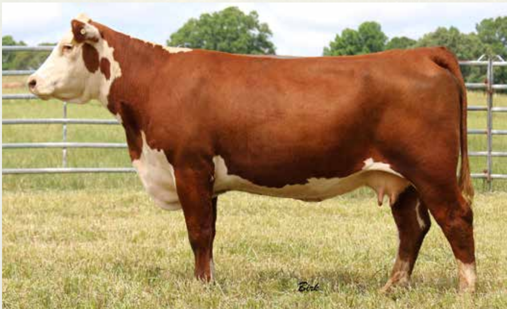
RKH SMITH VICKY OA20 2D07 - Lot 126