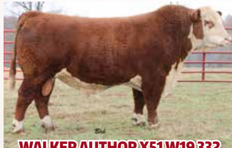
WALKER AUTHOR X51 W19 332

P606's legacy continues.... 15 daughters of this Breed Icon sell!