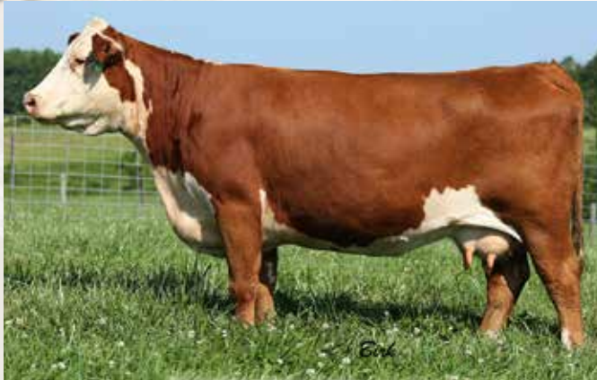
GB L1 DOM PRCS 907N - Lot 167