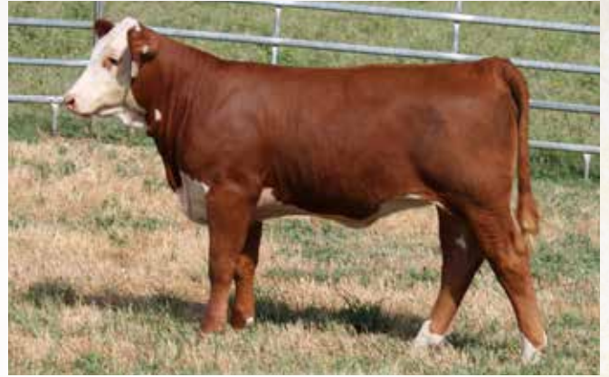
3D CMR HF 904B EMERALD 707E - Lot 94A