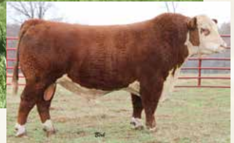
WALKER AUTHOR X51 W19 332 - Sire of Lots 143A-145A.