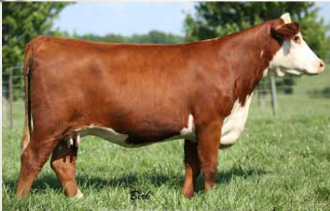
DMR 1X WINNIE 163A - Lot 109