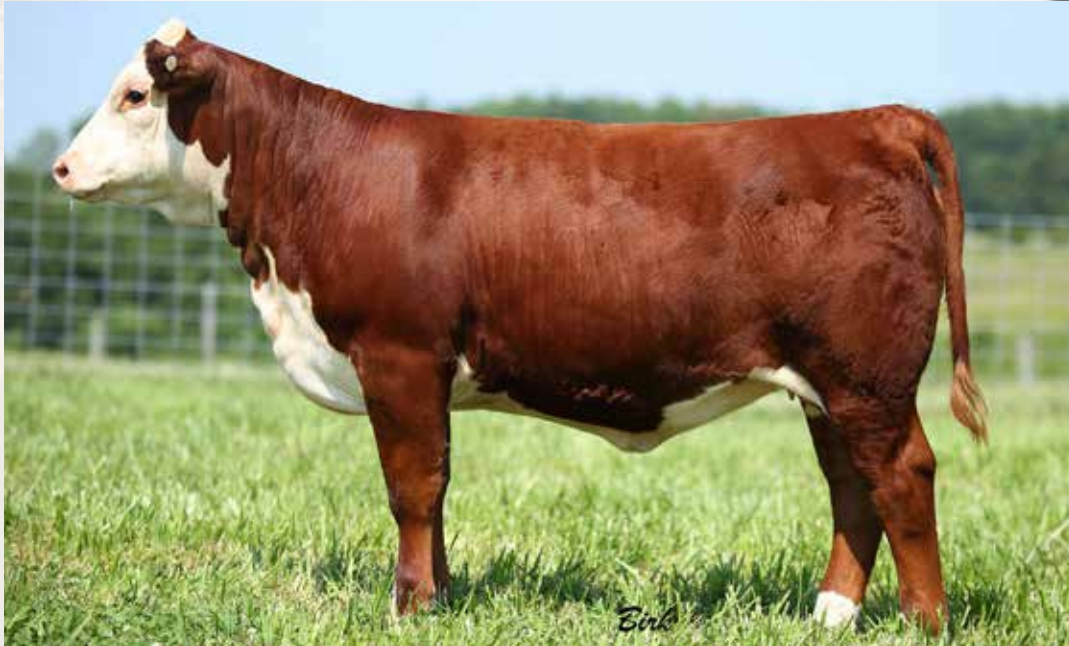
DSB Y24 10Y DIANNA 307D - Lot 10A