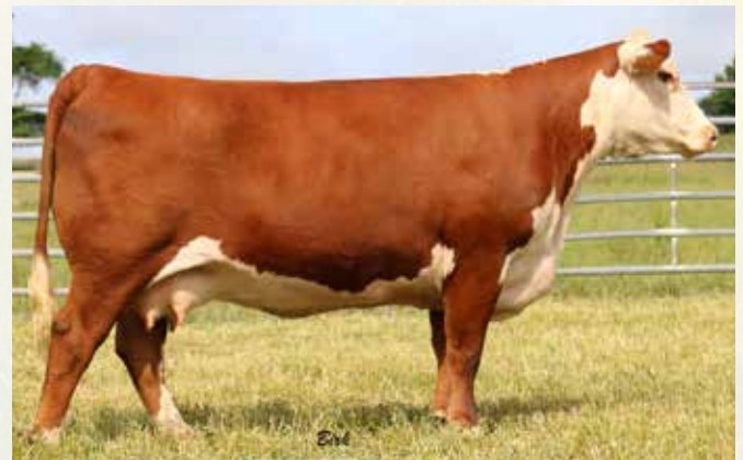
GRANDVIEW CMR MISS 424 X151 ET - Dam of Lot 73, selling as Lot 4.