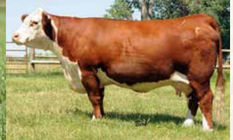
NJW BW LADYSPORT DEW 78P ET Dam of Lot 18 and a breed icon.