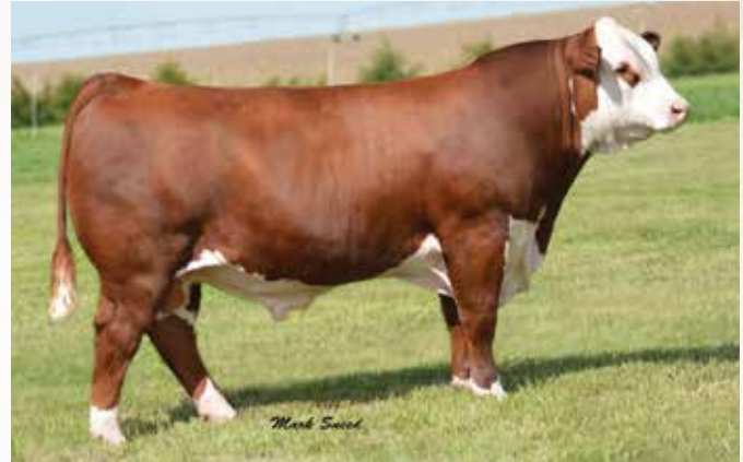
R LEADER 6964 - AI Service Sire.