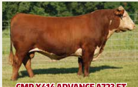
CMR X414 ADVANCE A723 ET

C95 is the $20,000 son of GV CMR X151 Mr 847 Z210 that we chose to use AI in our program and we are thrilled with his progeny. 6 open heifers sired by C95 sell, along with his service.