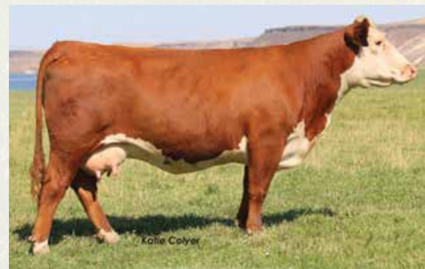
C 88X NOTICE ME 1311 ET Full sister to C Stockman 2059 ET, sire of Lots 29 and 30.