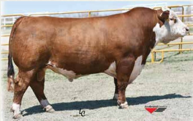
UPS SENSATION 2504 ET - AI Service Sire and maternal brother to Lot 18.