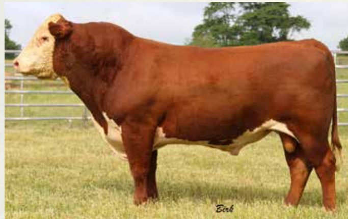
CMR Y509 IMAGE 130B ET - Lot 233