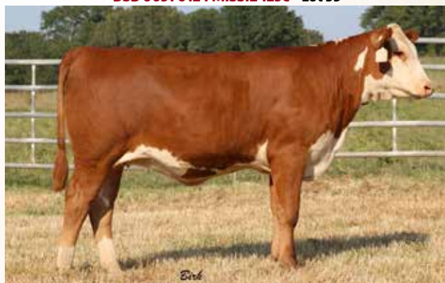
DSB 125A B284 MISSIE 114E - Lot 39A