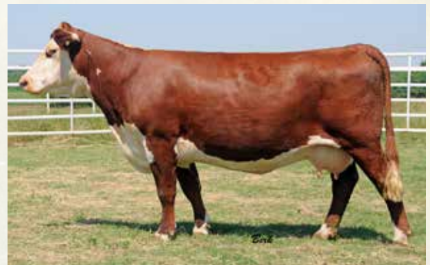
CMR GRANDVIEW MISS 1236 60S - Maternal great granddam of Lot 71 and donor dam for NJW Polled Herefords.