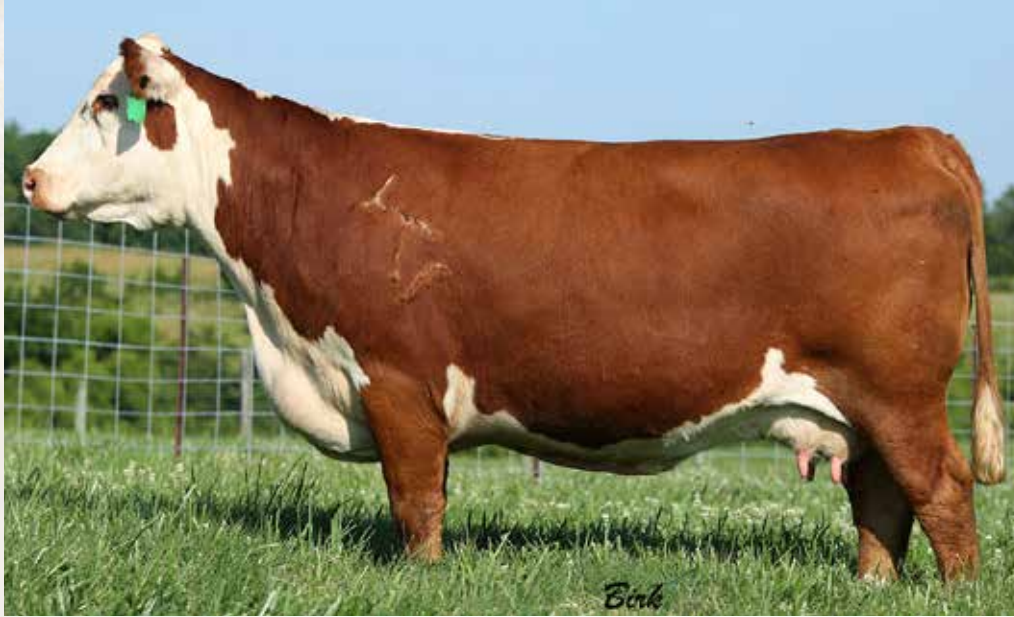
TH 605F 63N PRIMROSE 508U ET - Lot 181