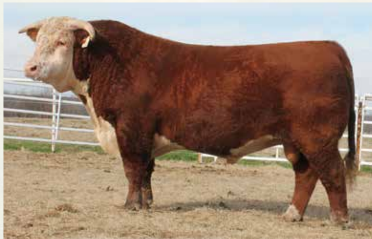
GRANDVIEW CMR HAWK L1 ADV 918X - Sire of Lots 94 and 95.