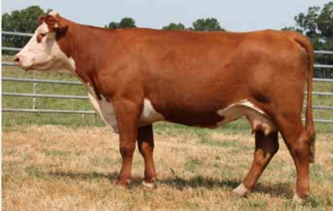
GV CMR 5008 MISS 918X A436 - Lot 94