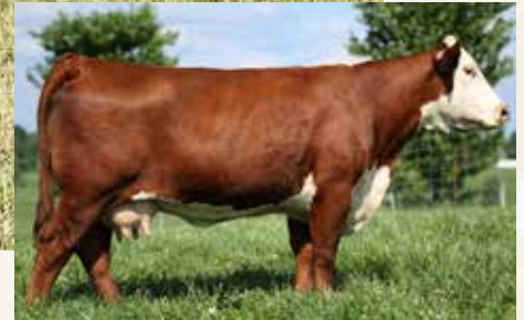
GRNDVIEW CMR P606 HOLLY Y143ET Dam of Lots 33-36, selling as Lot 2.