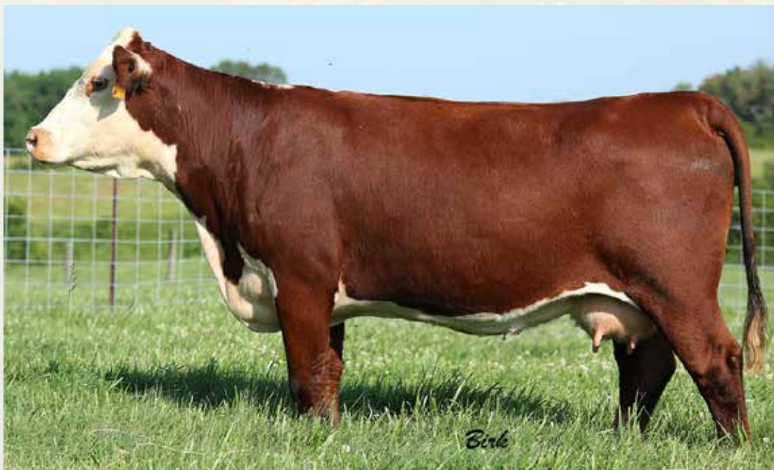
NLC 719T VICTORY 1039 - Lot 148