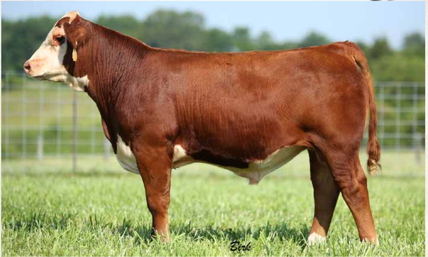
DSB 440W PROVIDENT 141E - Lot 151A