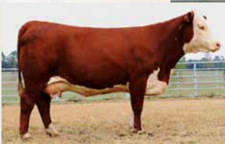
GRANDVIEW CMR MISS VIC X221 Dam of Lot 83 and donor dam for Barnes Herefords and White Hawk Ranch.