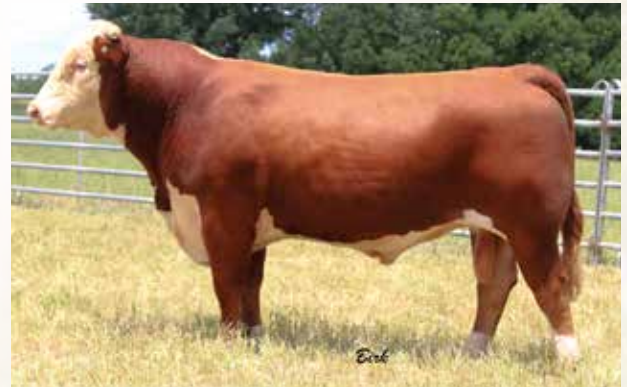
CMR A152 RIGHT TIME C215 ET - Sire of Lot 70A, selling as Lot 232.

Maternal granddam of Lot 71 and donor dam for WMC Cattle Company.