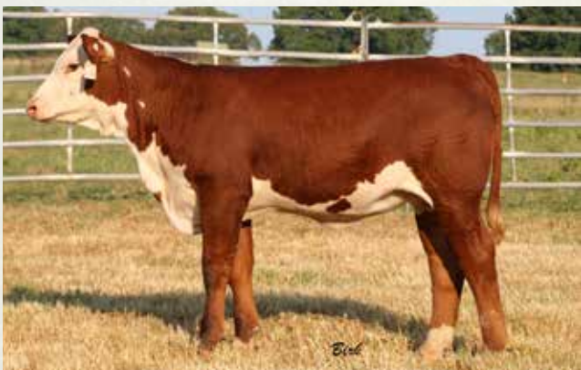
DSB 187C B284 CORIE 147E - Lot 26A