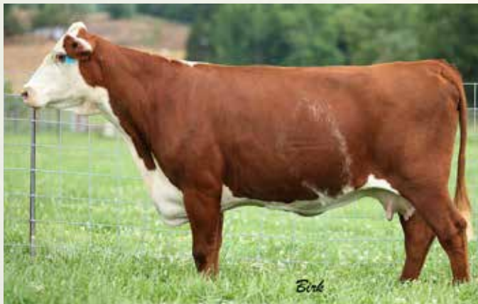
TH 122 71I DOMINETTE 516X ET - Lot 12