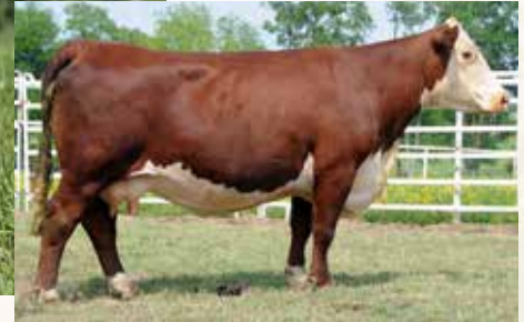
STAR OGIN HOLLY 526P ET - Dam of Lot 2.