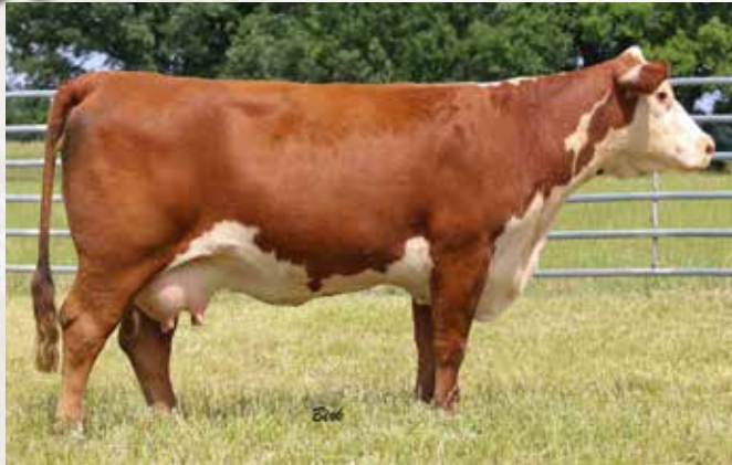
SPARKS 141U 2007 RITA 17X - Lot 183