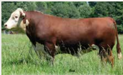
GRANDVIEW CMR NO WORRIES 9064 ET Full brother to Lots 200-201.