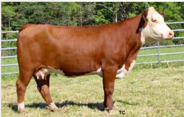
DSB 13X 50S VICTRA 328B - Lot 60