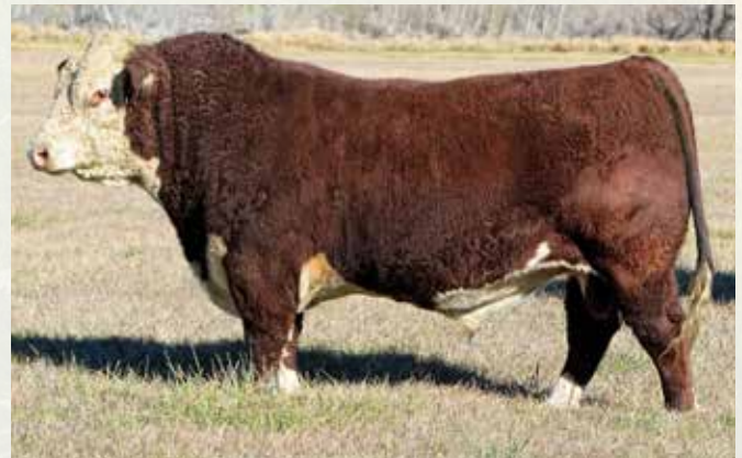
NJW 135U 10Y HOMETOWN 27A Sire of Lot 9A.