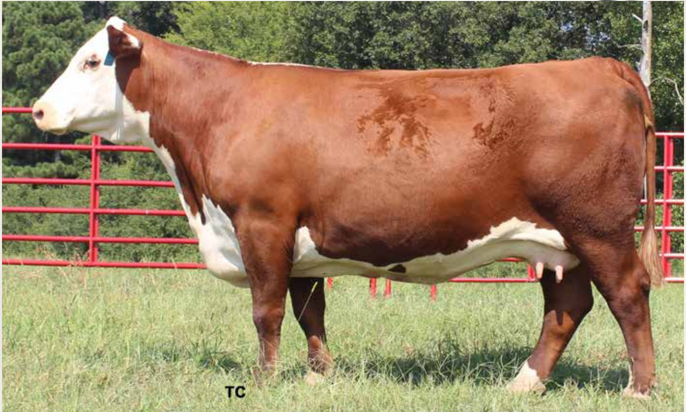
TH 122 71I DOMINETTE 447X ET - Lot 13