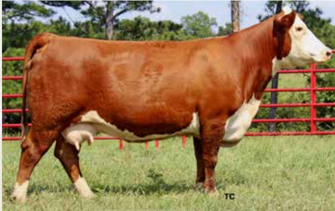
LH MISS TERRI 9201 ET - Lot 170