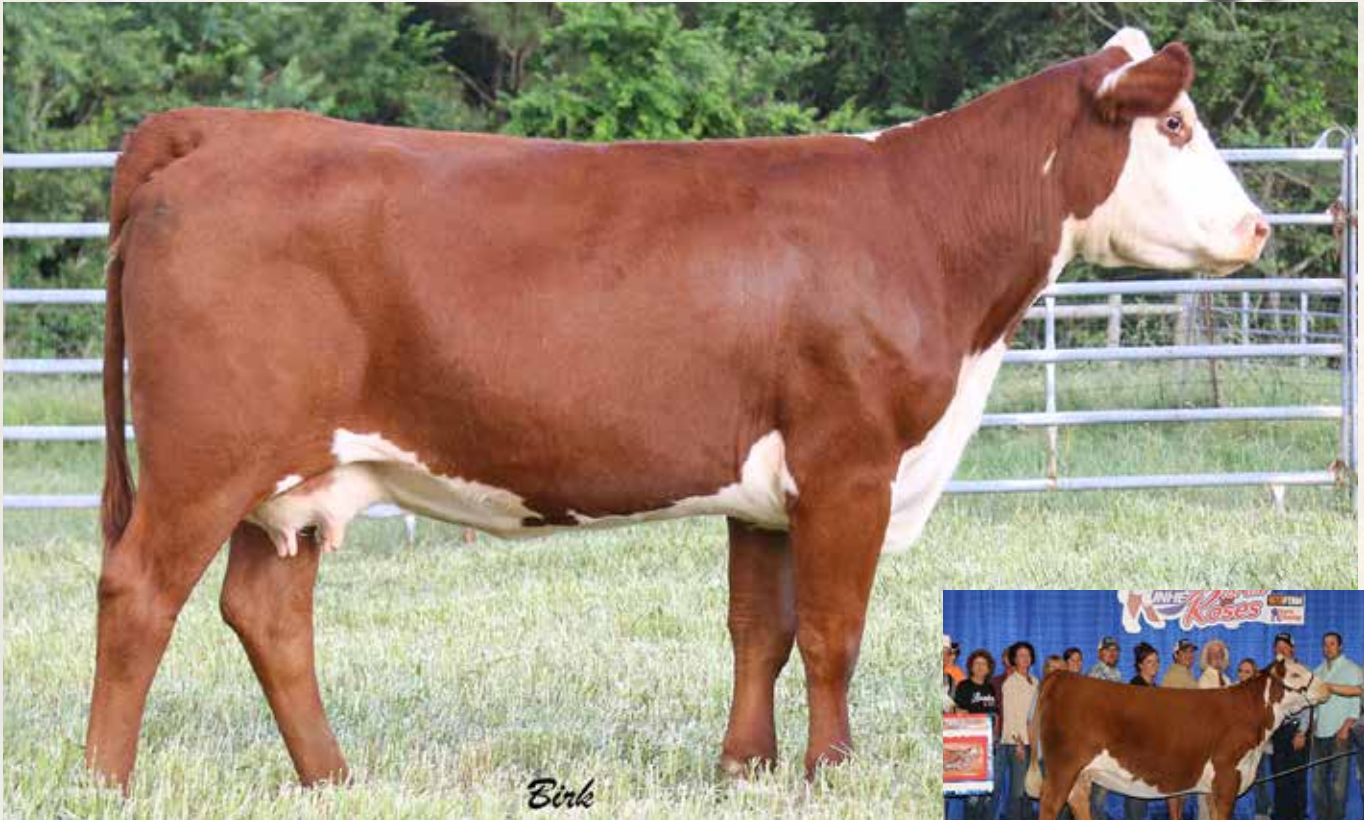
CMR 10Y 649 LADY B227 ET - Lot 19