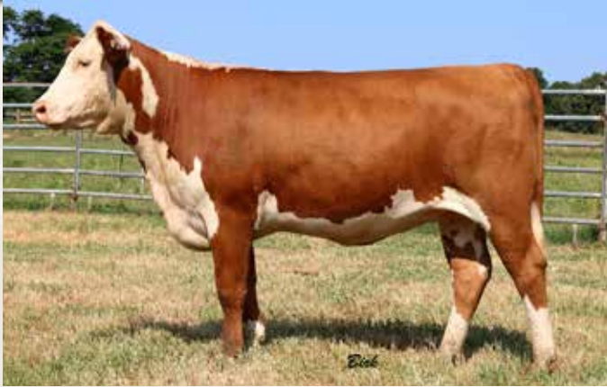
CMR Z311 412B LADY 610D - Lot 205