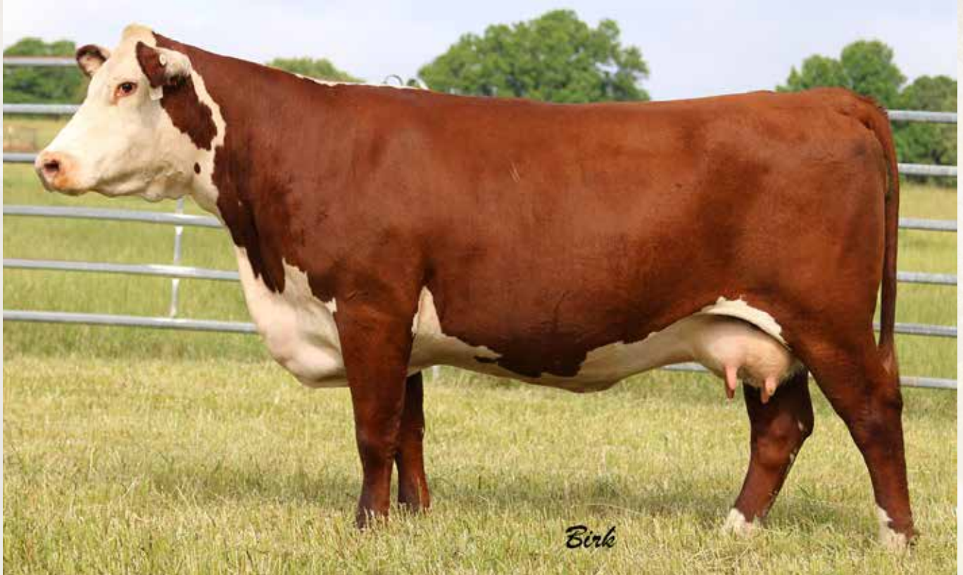
CMR 63 SARA P606 A408 ET- Lot 5