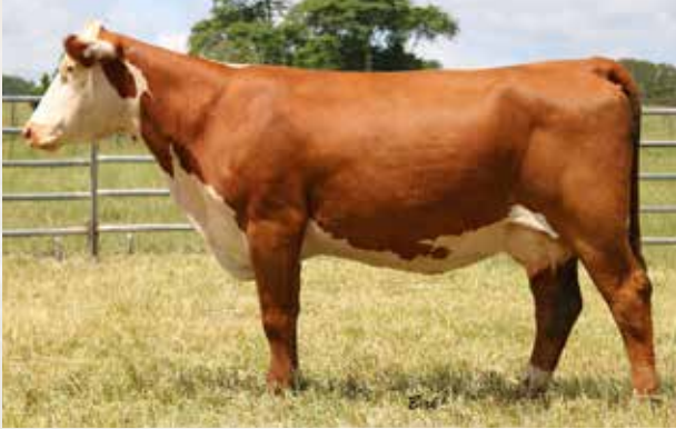
CMR 2059 U601 LADY B234 ET - Lot 70