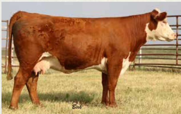
SHF L388 Z210 C96 ET - Two-year old daughter of Z210 in production at Sandhill Farms.