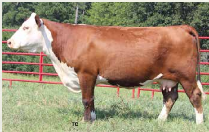
NLC 719T ROSIE 1031 - Lot 147