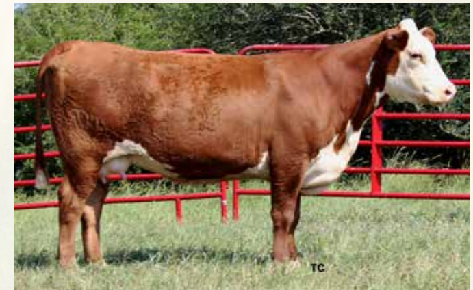
TH 9N 63N BURGUNDY 60X - Lot 171