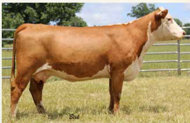
GV CMR E27 MISS 918X A449 - Lot 117