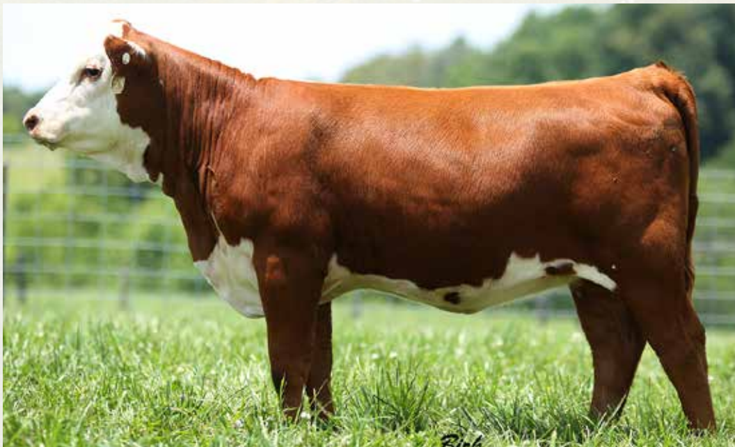
DSB 186Z 407B LADYSPORT 110E - Lot 18A