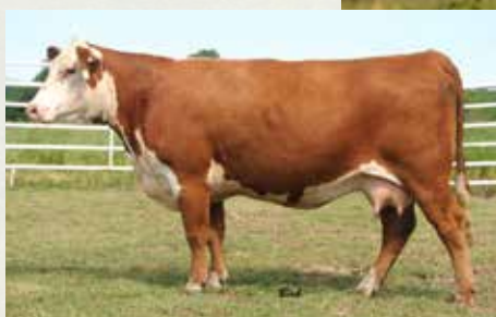
JWR M41 PRINCESS 1675 - Dam of Lot 4.