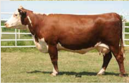
LPH ROXIE P606 L1003 - Dam of Lot 123.