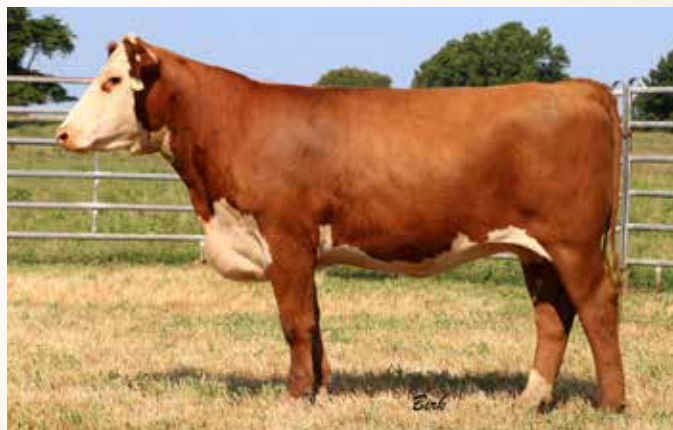
CMR Z3 A714 LADY 604D - Lot 212