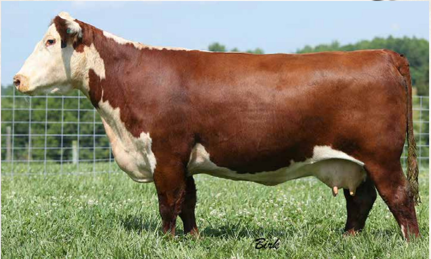
TF BURKS P49 BETH 122L 011 ET - Lot 127