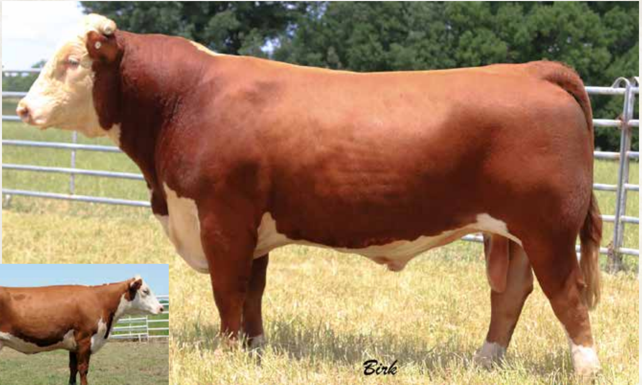
CMR A152 RIGHT TIME C215 ET - Lot 232