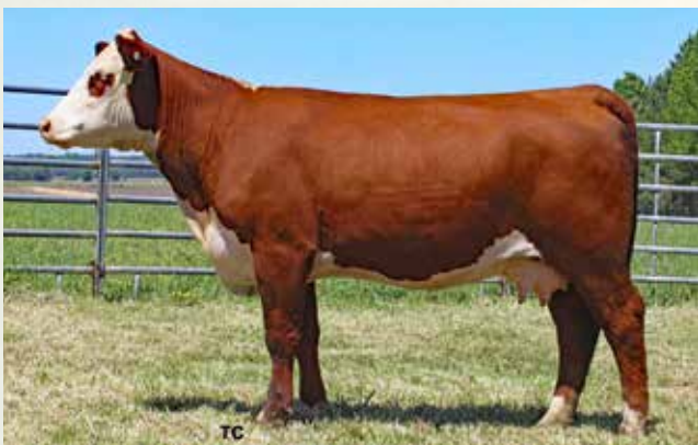
DSB 1069 332 CORIE 187C - Lot 26