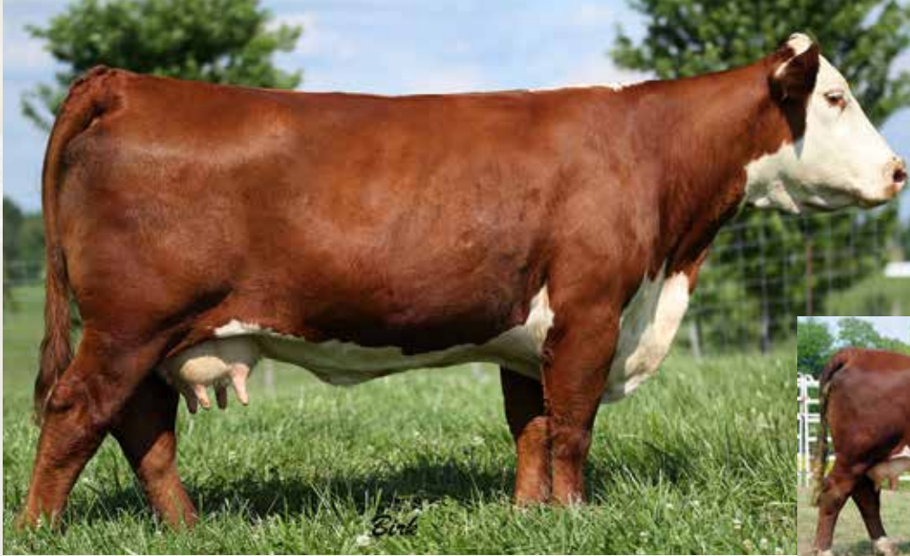
GRNDVIEW CMR P606 HOLLY Y143ET - Lot 2