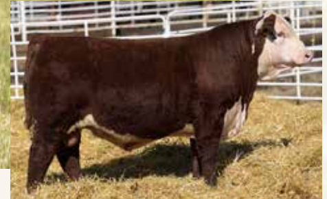
TH 403A 475Z PIONEER 358C ET Paternal brother to Lot 65.