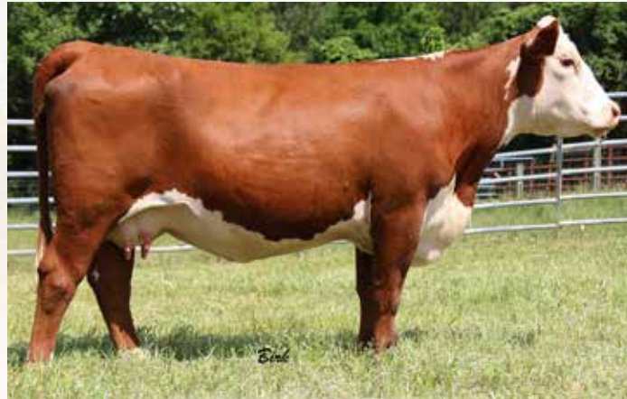
DSB 6123 4R CALLIE 408B ET - Lot 21