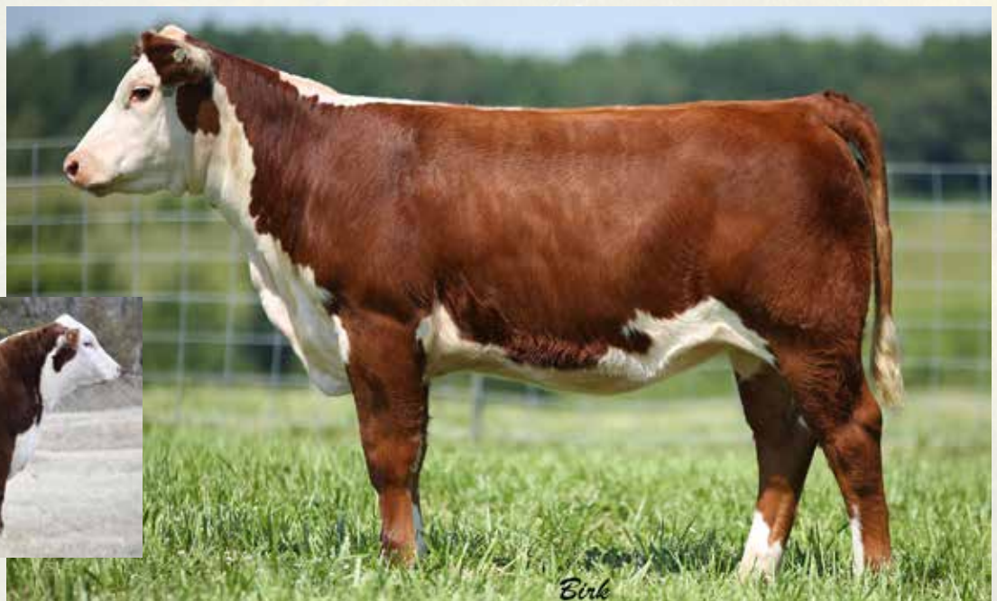
BURKS 428X BETH 881E - Lot 128A