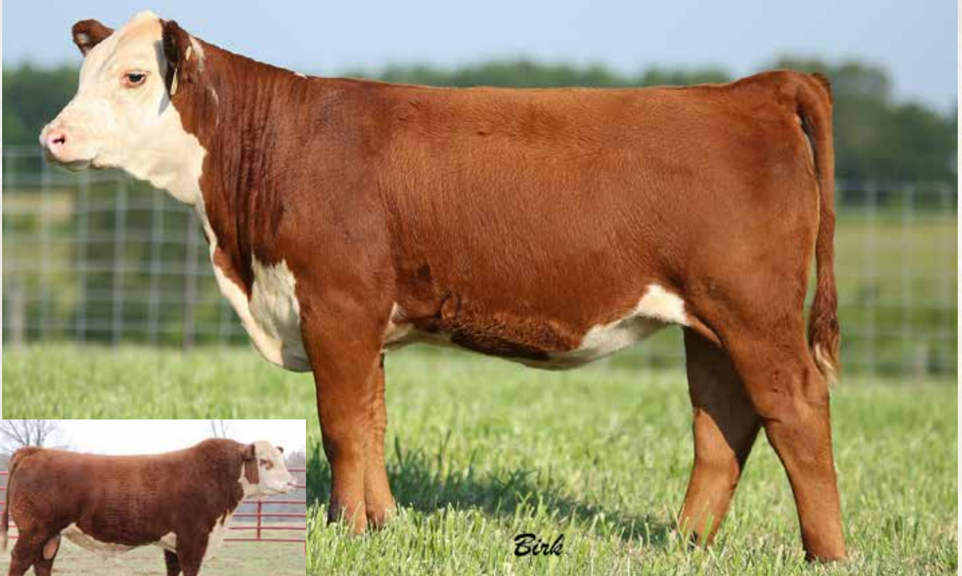
DSB 108B 332 CALICO 172E - Lot 76A

WALKER AUTHOR X51 W19 332 - 38 progeny of this $64,000 valued son of KCF Bennett Revolution X51 sell.