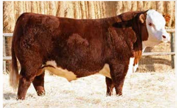
NJW 73S W18 HOMETOWN 10Y ET - Sire of Lot 72A. 13 progeny of Hometown sell.