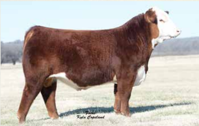
GV CMR X161 TIMES UP A152 - Sire of Lot 220.