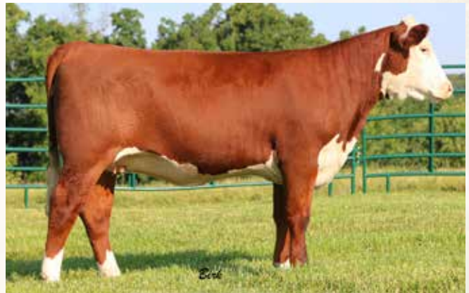
LF 0124 MALLORY 30D - Lot 222