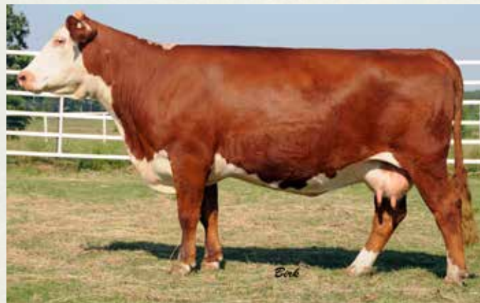
CMR MISS P606 223R - Dam of Lots 200 and 201, and Grandview CMR No Worries 9064 ET.