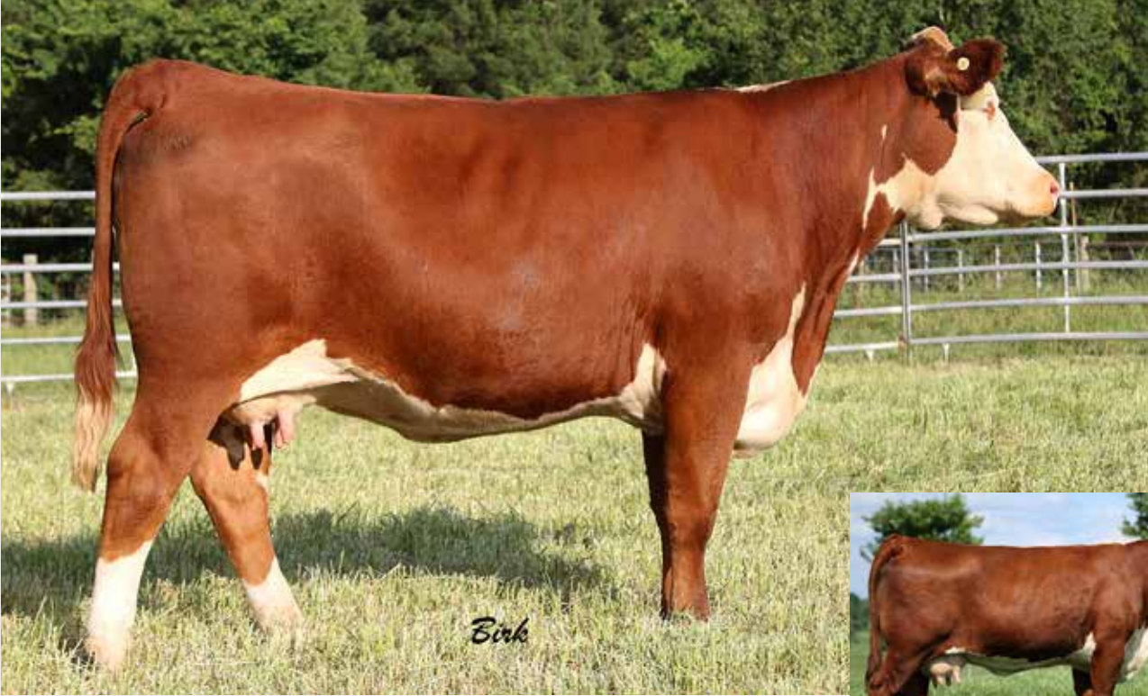
DSB Y143 0124 HOLLY 413C ET - Lot 35