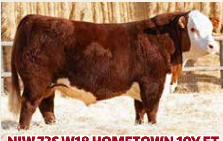
NJW 73S W18 HOMETOWN 10Y ET

B284 is the $47,000 high selling bull of the Dec. 2015 Knoll Crest Farm bull sale. On Oct 1st, you have the opportunity to appraise the largest selection of B284's progeny, offered to-date, of this up and coming breed star. 22 open heifers and 14 bulls sell sired by B284.