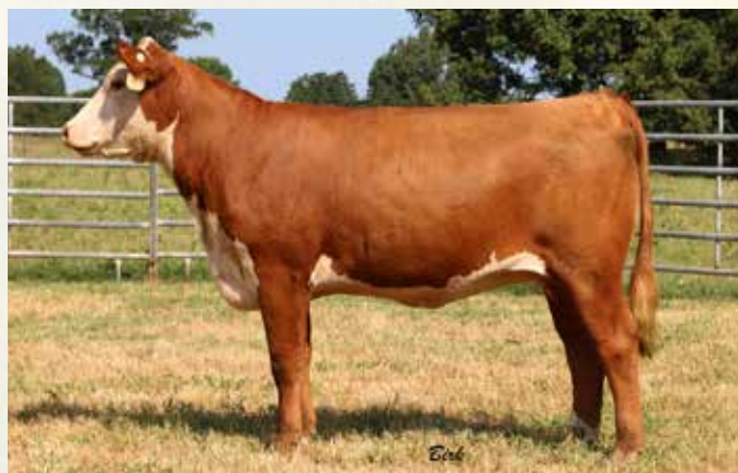
CMR Z3 A711 LADY 619D - Lot 213