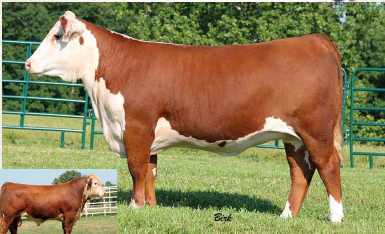
LF Z210 MORGAN 20D - Lot 203