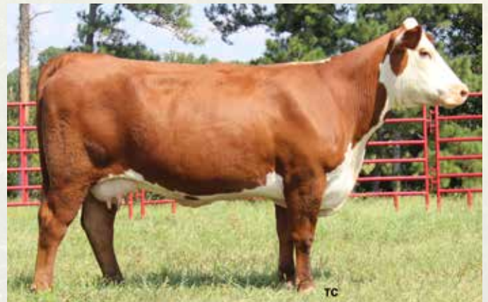
SPARKS 86S 2007 MOLLY 28X - Lot 152