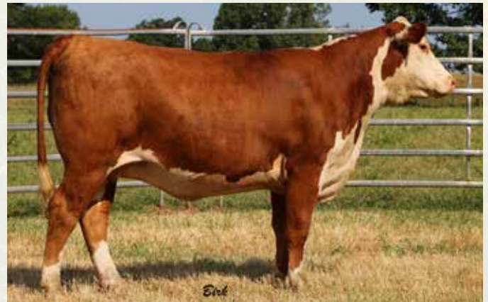
RKH SMITH RENEE 3C12 5P24 ET - Lot 197