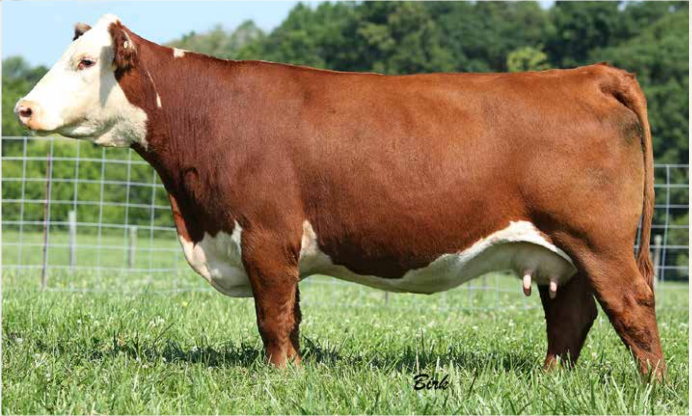
TH 89T 755T GEMINI 447A - Lot 104