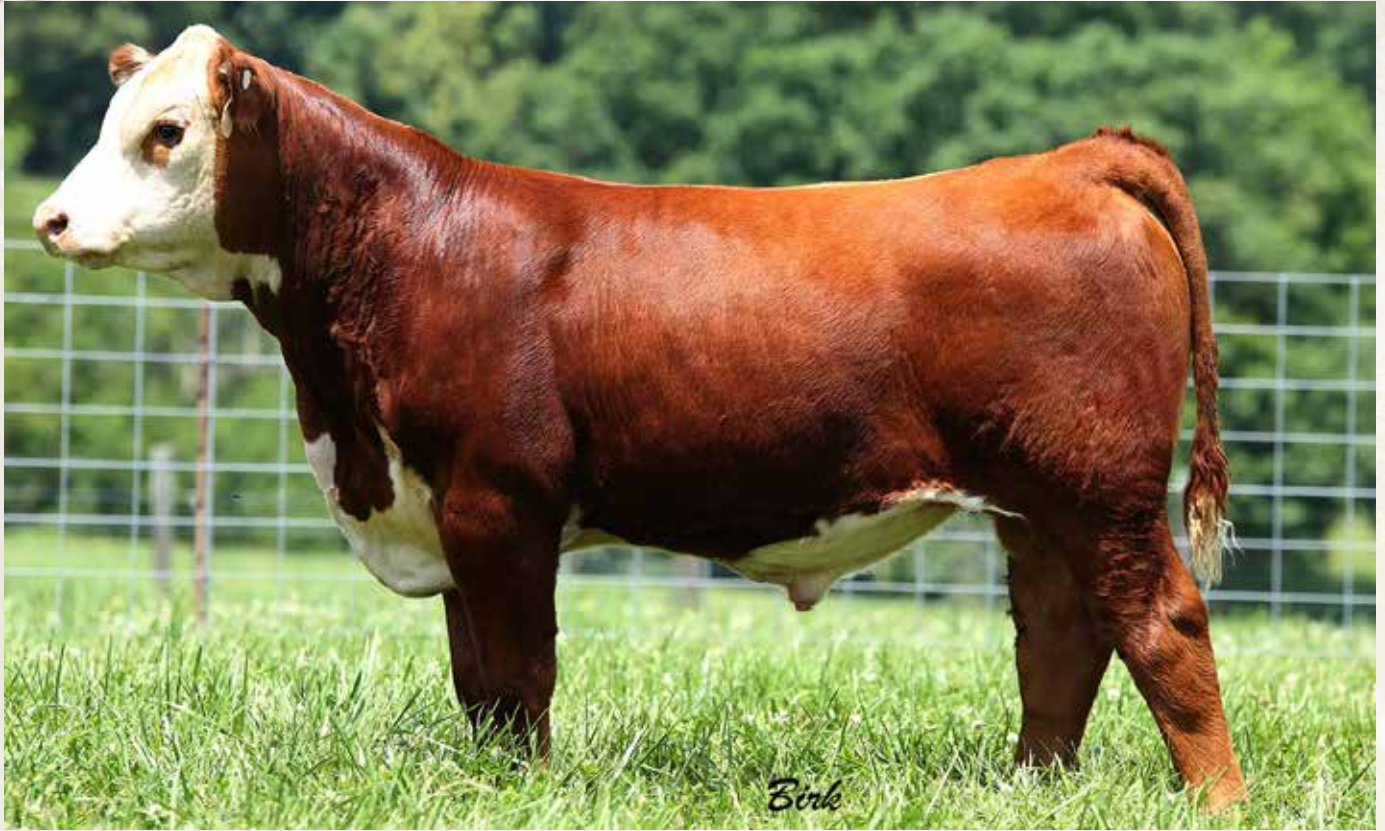
DSB 6Z HOMETOWN 302D - Lot 149A