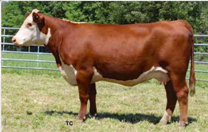
DSB Y143 0124 HOLLY 403C ET - Lot 33