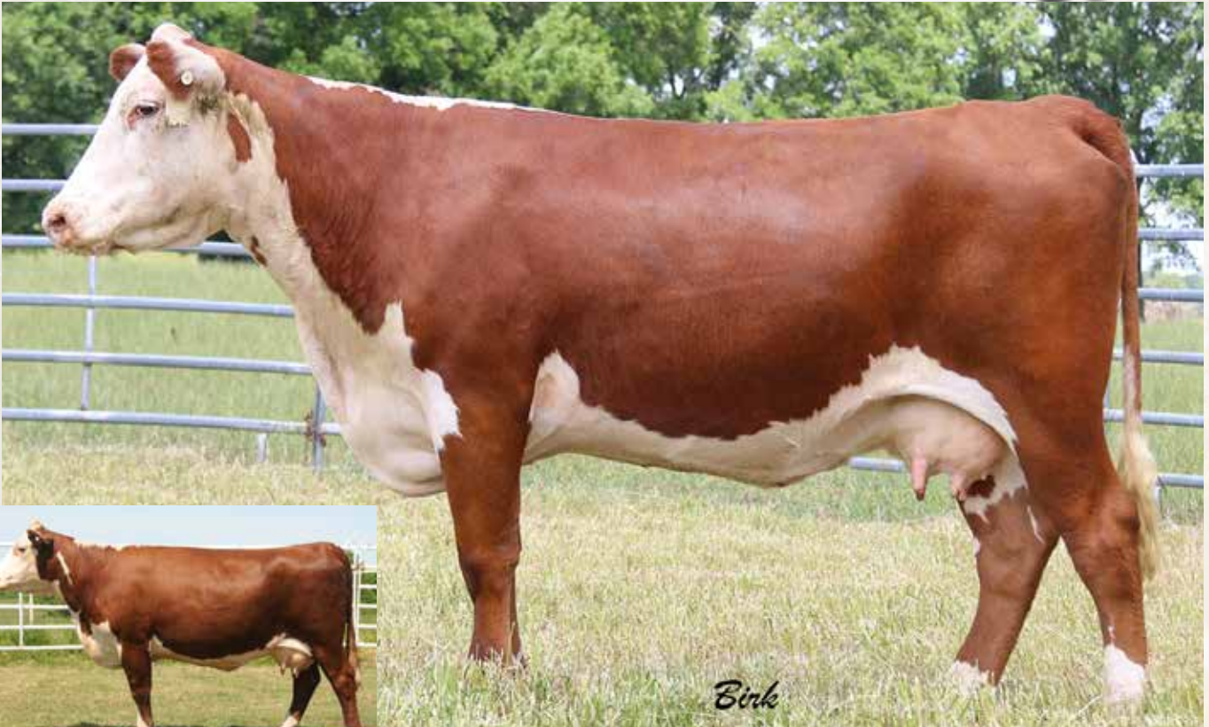
GV CMR L1003 MS 860U Z218 ET - Lot 123