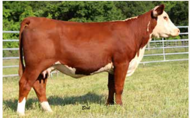
DSB 435Y 332 LORETTA 166C - Lot 27