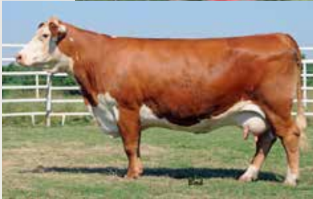
GV CMR 5030 MISS 0124 A132 - Lot 107