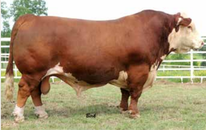
ALH WS KING TEN 8201 ET - Sire of Lots 89 and 90.