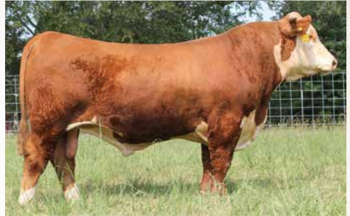
BP CB CHEVY 904B - Sire of Lots 94A and 96A. Herd Sire for 3D Cattle Company.

For General Questions Please Contact Our Office: (402) 316-5460 or support@dvauction.com