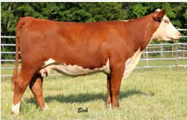
DSB 61235 11X CALLIE 401B ET - Lot 42