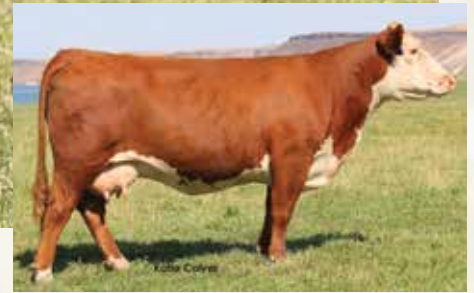
C 88X NOTICE ME 1311 ET - Full sister to the sire of Lot 74.