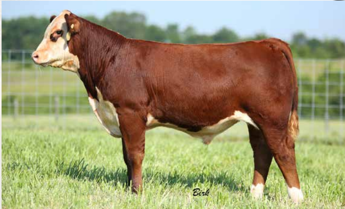
DSB 1039 ON TARGET 192E - Lot 148A