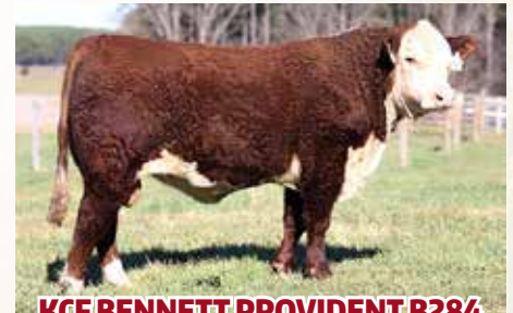
KCF BENNETT PROVIDENT B284

332 is proving his extraordinary breeding ability. 38 progeny of this $64,000 valued son of KCF Bennett Revolution X51 sell, including 5 first-calf heifers, 15 open heifers and 19 bulls.