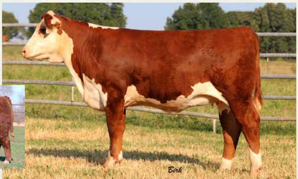
CMR C95 Y174 ROSY E160 - Lot 1A