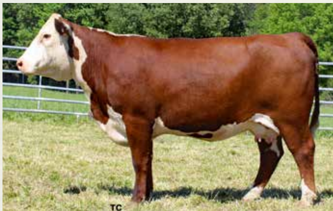
DSB 167X 50S GLORIA 153C - Lot 46