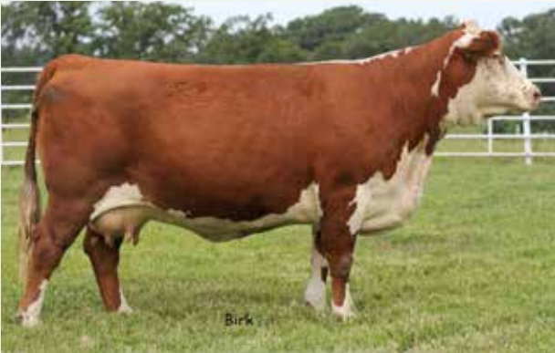
GRANDVIEW CMR MS MATERIAL 9328

★ CED -1.4, BW +4.0, WW +47, YW +74, MILK +33, REA +0.71, MARB +0.14