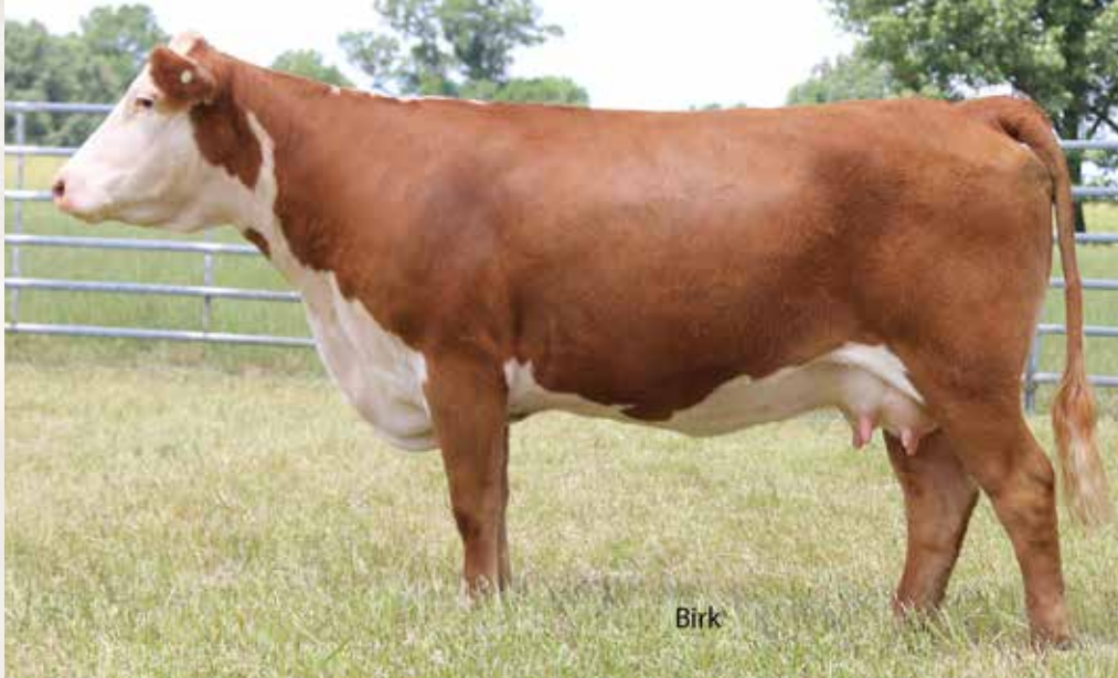
RKH SMITH VICTORIA 5P50 2T40 - Lot 125