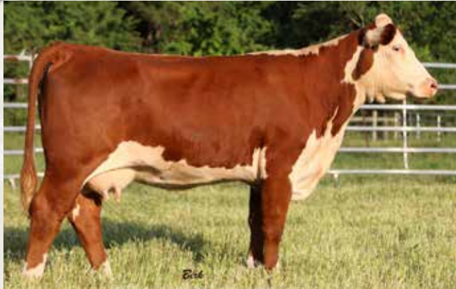
CSR U601 2059 LASS 412B ET - Lot 29