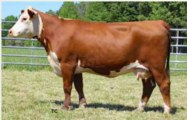
TRM DOLLY 4131 - Lot 22