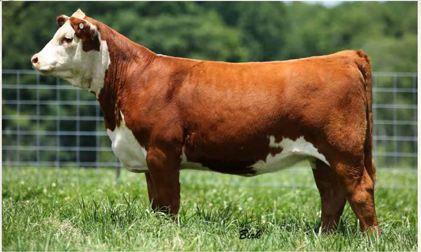
DSB 8106 X51 REBA 310D - Lot 155A