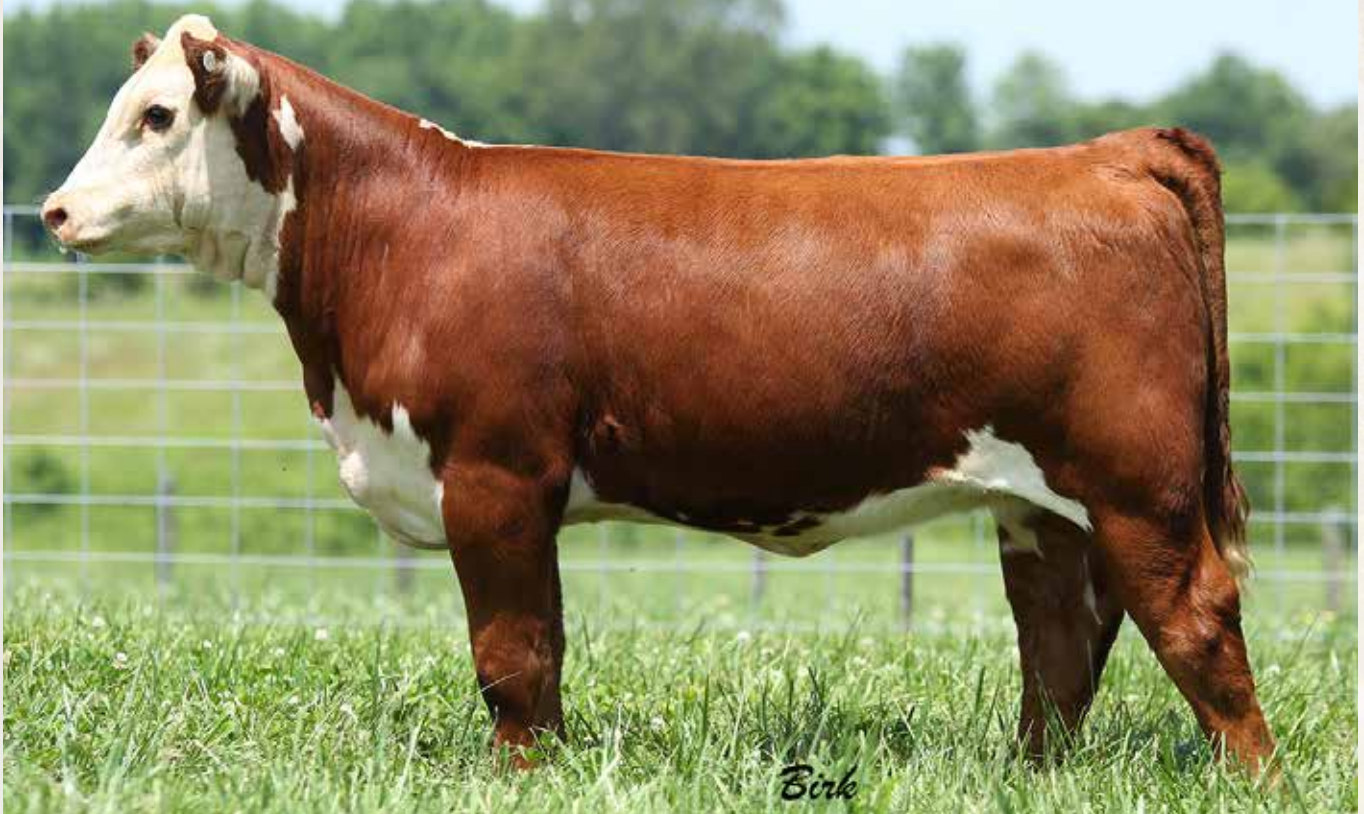
DSB 416Z B284 TREND A 314D - Lot 16A