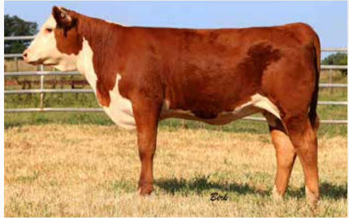
CMR A723 A710 MISS E130 - Lot 80A