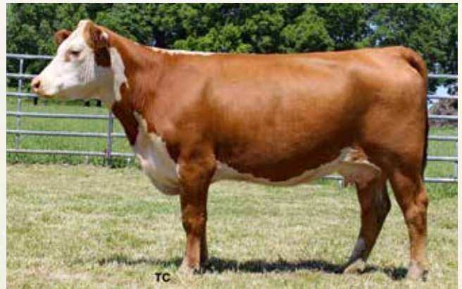
KCF MISS BONANZA B359 - Lot 32