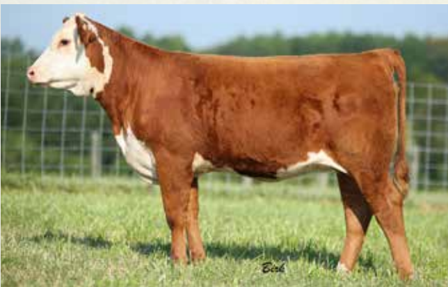
DSB 67X 407B BURGANDY 118E - Lot 137A