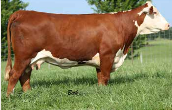
TH 122 71I DOMINETTE 448X ET - Lot 11