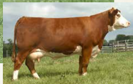
DJB 46B BETH 1L Dam of Lots 87 and 88 and full sister to PW Victor Boomer P606.