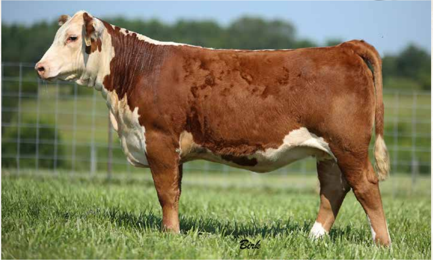
DSB 02X 27A VICKIE 149E - Lot 138A