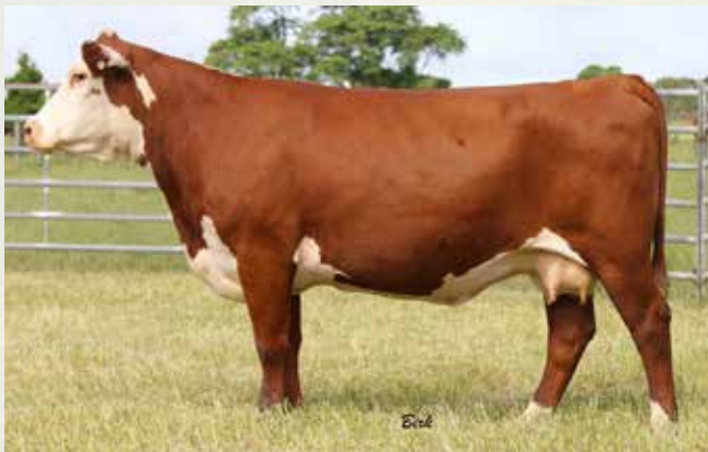
CMR 63 CHRIS P606 A135 ET - Lot 6