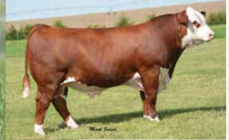
R LEADER 6964 AI Service Sire.