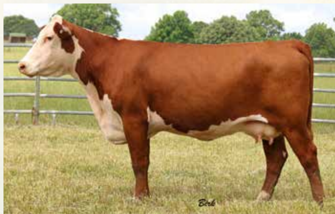
CMR Y449 731 LADY B212 - Lot 8