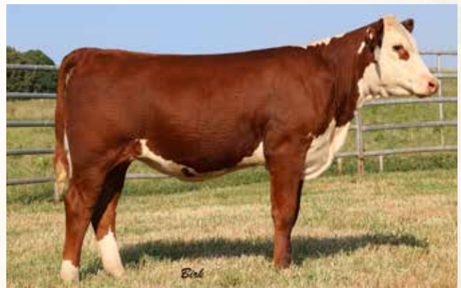
DSB 166C B284 LORETTA 113E - Lot 27A