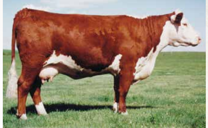
REMITALL CATALINA 24H - Maternal granddam of Lot 67.