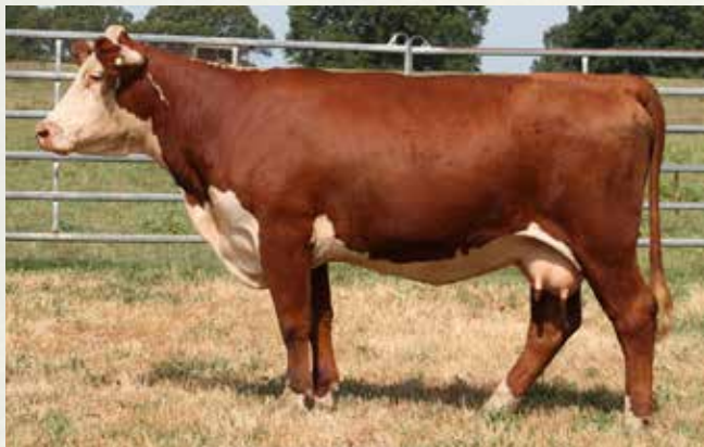
3D DELILAH P606 406B - Lot 69

★ CED +1.0, BW +2.4, WW +49, YW +71, MILK +26, REA +0.63, MARB +0.02