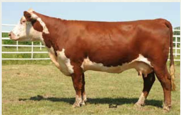
GRANDVIEW CMR P606 LASS U601ET Dam of Lots 29 and 30. U601 is in the herd of Jim Cravens, Buffalo, IL.