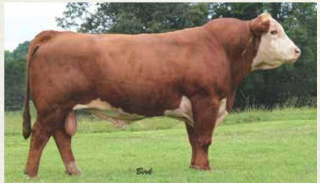
KCF BENNETT REVOLUTION X51 - Full brother to the dam of Lot 32. 10 progeny sired by X51 sell.