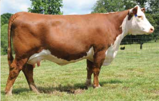
WALKER MISS 1030 545 7115 - Dam of Lot 72 and donor dam for Barnes Herefords.