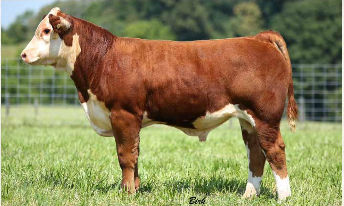
DSB 1116 PROVIDENT 143E - Lot 141A