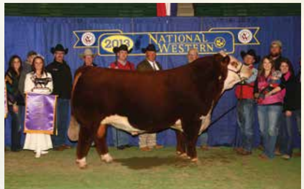
RST TIMES A WASTIN 0124 - Sire of Lot 55 and 56. Selling 13 daughters in production and 2 bred heifers sired by 0124.