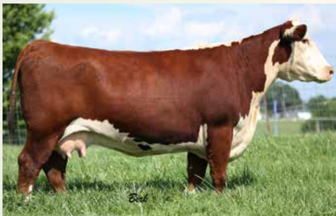
NLC 719T MS GIDGET 1090 - Dam of Lot 100, selling as Lot 144.