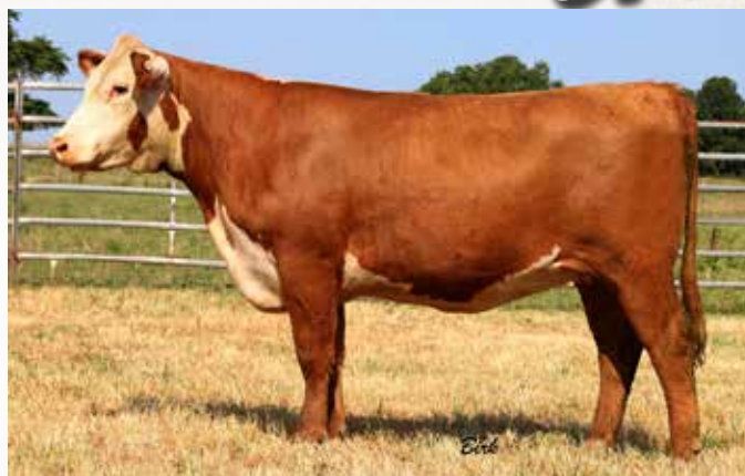
CMR Z3 A710 MISS 605D - Lot 211