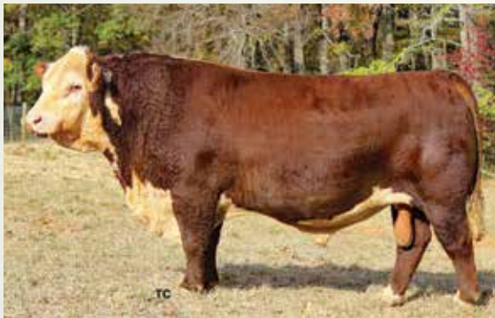
EFBEEF TFL U208 TESTED X651 ET - AI Service Sire.