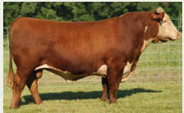
CMR X414 ADVANCE A723 ET - Sire of Lot 71A. Selling 4 bred heifers, 6 open heifers and 8 bulls sired by A723.

★ CED +1.5, BW +2.9, WW +54, YW +77, MILK +26, REA +0.47, MARB +0.07