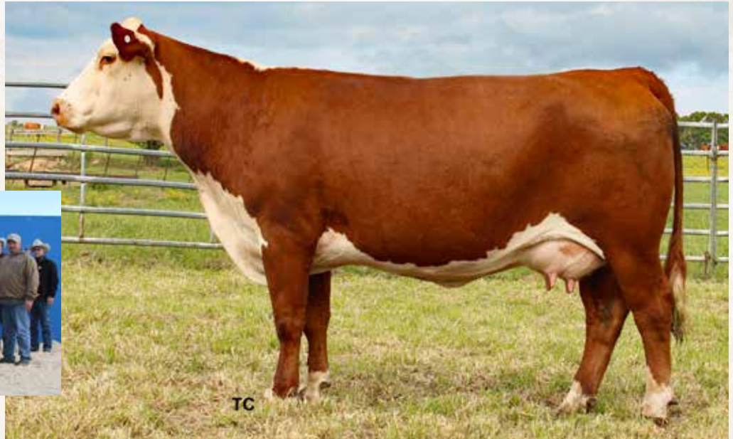
GV CMR P606 VICTORIA Y174 ET - Lot 1