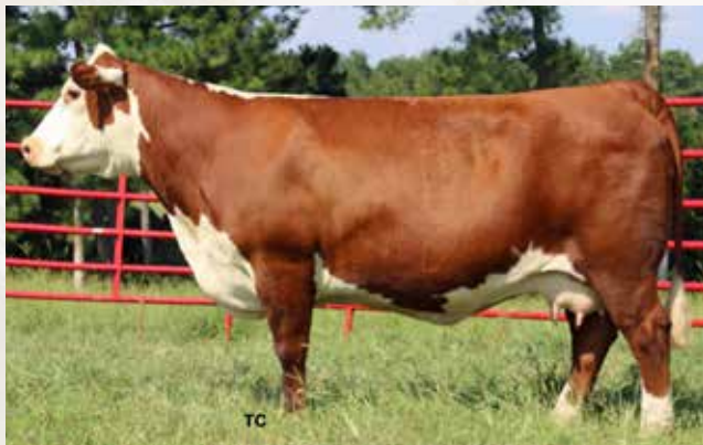
TH 122 45P DOMINETTE 120W Dam of Lot 25, selling as Lot 9.