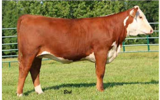
LF 0124 TINA 26D - Lot 221