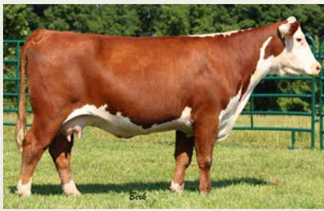
LF CMR 0514 MS PRIME 13A - Lot 118