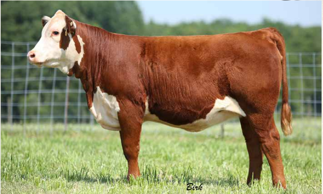
DSB 15X 407B JANET 321D - Lot 161A