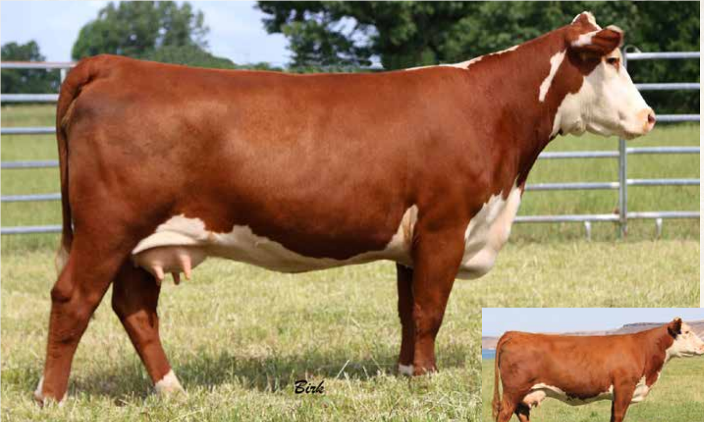
CMR 2059 72T LADY B205 - Lot 74