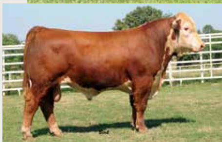
GV CMR X151 MR 847 Z210 - Sire of Lots 203 and 204 and herd sire for Sandhill Farms and NJW Polled Herefords.