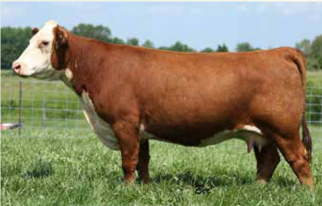
TH 810T 719T BURGUNDY 67X - Lot 137