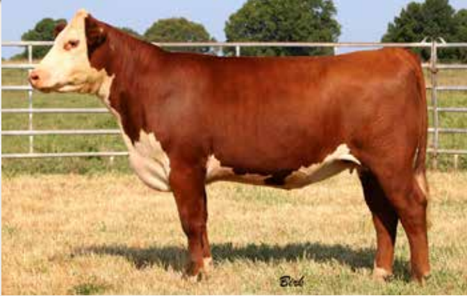
DSB 1090 100W GIDGET 407D ET - Lot 216