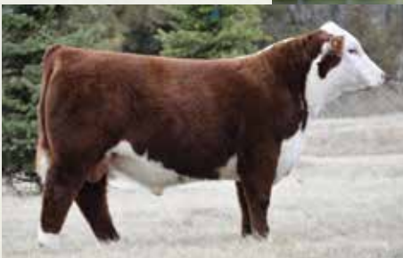
ECR RO CHOSEN ONE 424 ET Sire of Lot 128A.