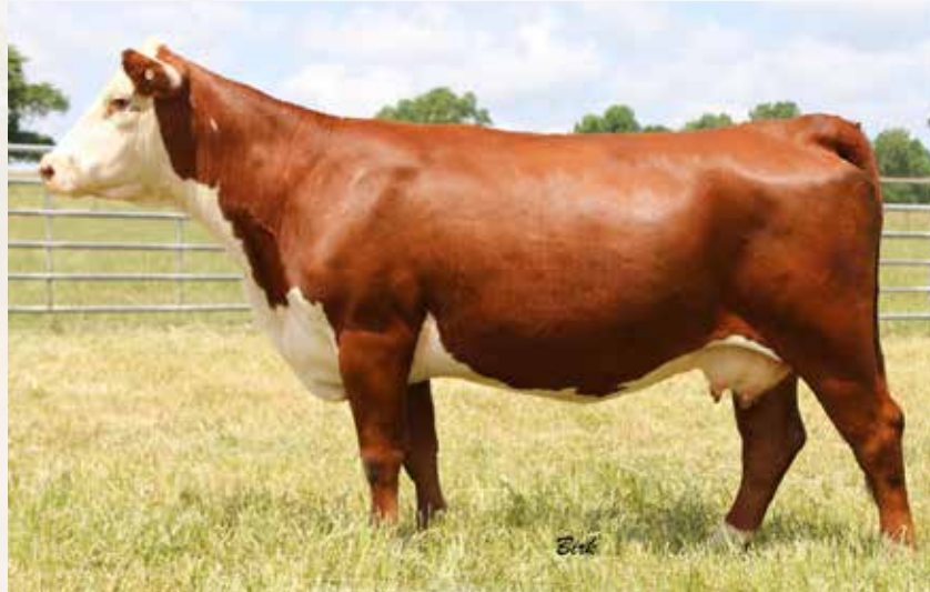
ORMON 530 MS 612 119 - Lot 129