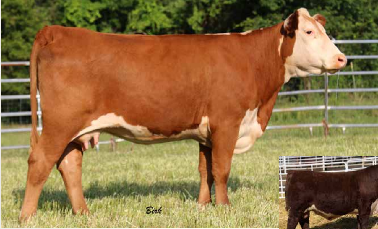
DSB 9020 475Z LASS 318B - Lot 65