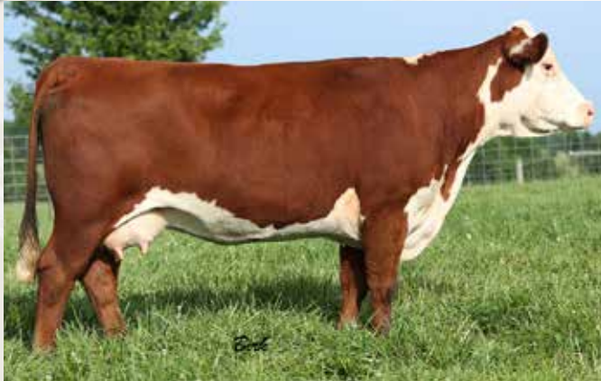
TH 40U 719T DANI 19X - Lot 139