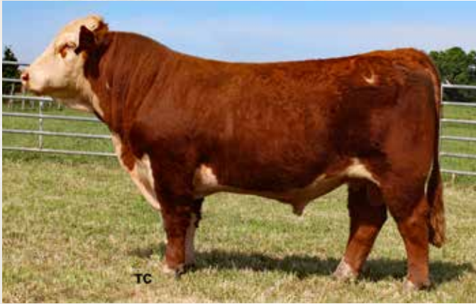
NJW 76S 88X CIRCLEBOSS 157C ET - Service Sire.