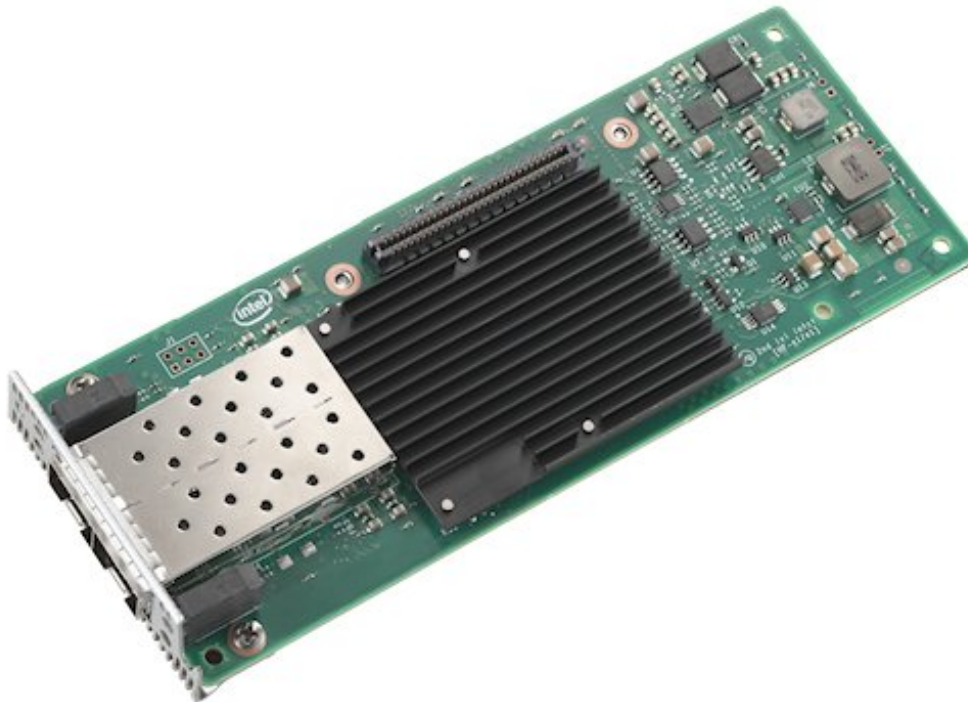
Figure 6. Intel X520 Dual Port 10GbE SFP+ Embedded Adapter

The following figure shows the Intel X520 Dual Port 10GbE SFP+ Embedded Adapter.