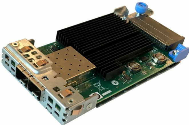
Figure 7. ThinkServer X520-DA2 AnyFabric 10Gb 2 Port SFP+ Ethernet Adapter

The following figure shows the ThinkServer X520-DA2 AnyFabric 10Gb 2 Port SFP+ Ethernet Adapter.