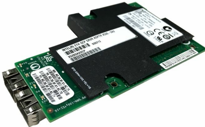
Figure 4. Intel X520 Dual Port 10GbE SFP+ OCP Mezz

The following figure shows the Intel X520 Dual Port 10GbE SFP+ OCP Mezz adapter for use in the ThinkServer sd350.