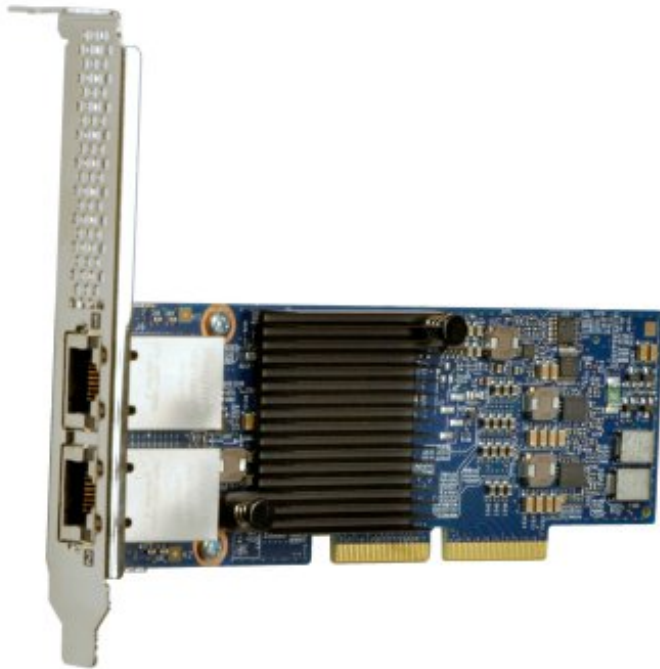
Figure 5. Intel X540 ML2 Dual Port 10GbaseT Adapter

The following figure shows the Intel X540 ML2 Dual Port 10GbaseT Adapter for those System x servers with an ML2 adapter slot.