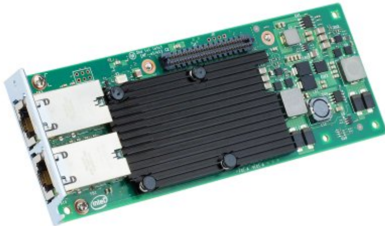
Figure 3. Intel X540 Dual Port 10GBase-T Embedded Adapter

The following figure shows the Intel X540 Dual Port 10GBase-T Embedded Adapter.