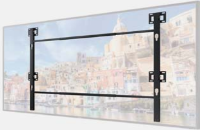
Figure 4. Default wall mount comes with QM105D

To save our customer's time and efforts in finding the right installation options that satisfy the required mechanical dimension and strength, QM105D Signage comes with a dedicated wall mount option which is specially designed for it.