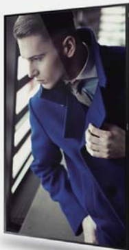
Figure 4. Pivot mode to fit an aesthetic setting while delivering dynamic content.