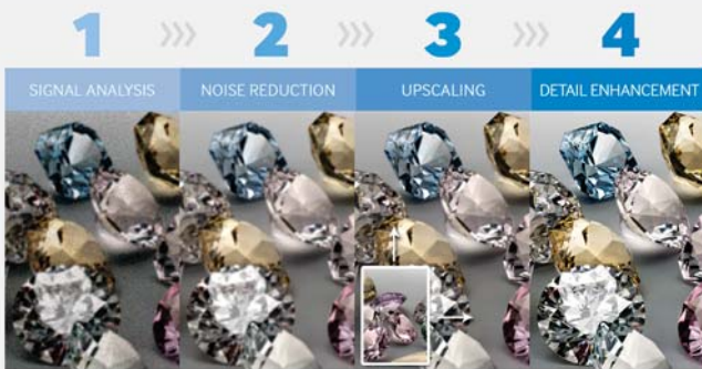
Figure 2. The ultimate details with a 4-step upscaling process, no matter what you're displaying

Because commercial UHD content display is still new within the industry, it's important for UHD displays to also deliver the range of FHD content currently in use. Samsung upscaling technology, one of the best in the industry, adjusts lower resolution content to optimally display on the UHD resolution of the QM105D display.