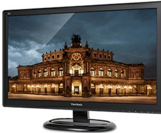
3000:1 Static Contrast Ratio