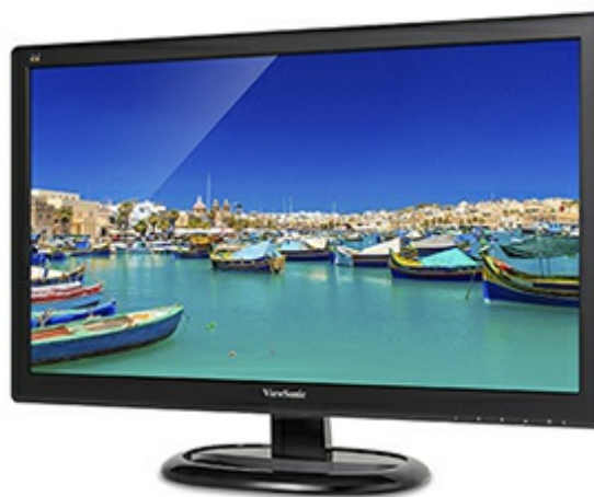
ViewSonic Flicker-Free Technology