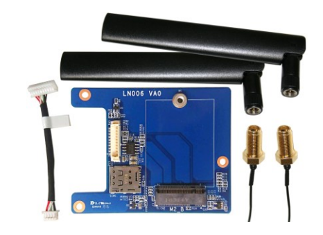
Note: M.2-LTE card and SIM card are not included.

LTE adapter kit for the 2.5" bay including two external LTE antennas