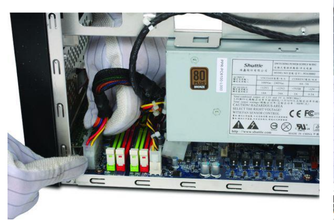
③ Attach the 20-pin ATX and 2x2-pin (or 1x4-pin) power supply plugs to the mainboard.