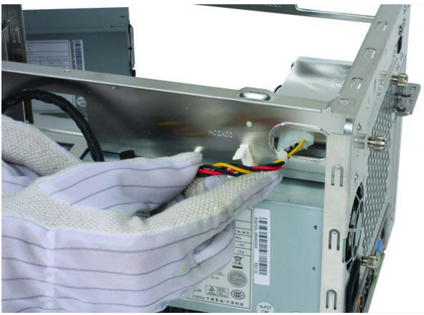
② Feed the HDD cable through the reverse hole as shown and attach to storage devices.