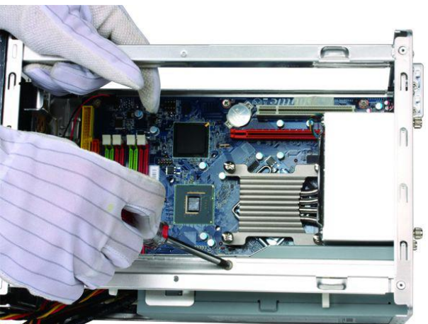
In Finally, secure again from top with Phillips head screw.