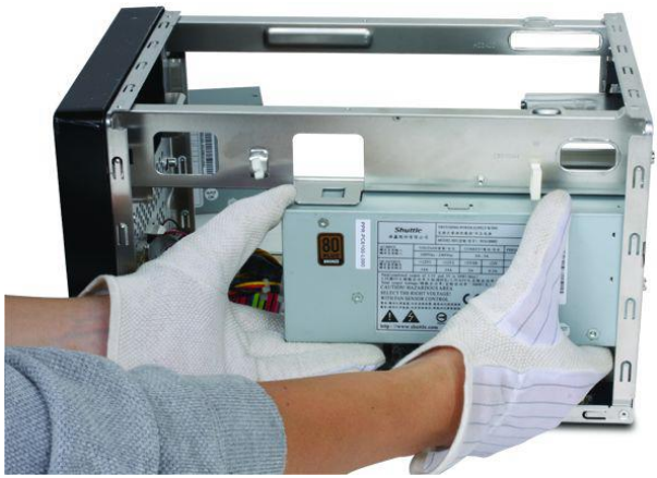
• Place the power supply in position. Secure from the back with three Phillips head screws.