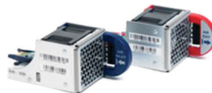
Figure 6: Hot-swappable fan modules