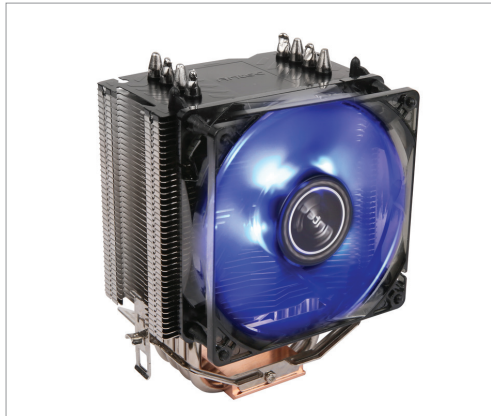
Whisper-quiet, 92mm blue LED PWM fan