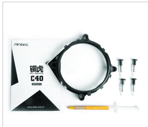
Compatibility with the newest Intel and AMD platforms, and the push-pin mounting system and included gold thermal paste make for a fast, simple installation