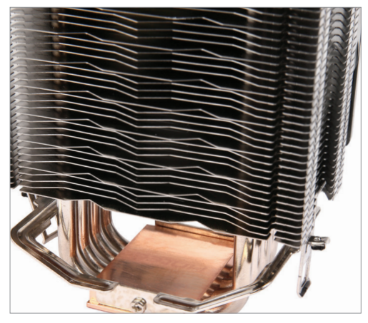
Unique fin structure dissipates heat efficiently, while aluminum oxide coating prevents oxidation