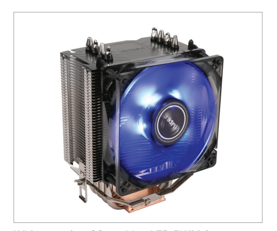
Whisper-quiet, 92mm blue LED PWM fan