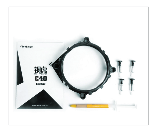
Compatibility with the newest Intel and AMD platforms, and the push-pin mounting system and included gold thermal paste make for a fast, simple installation