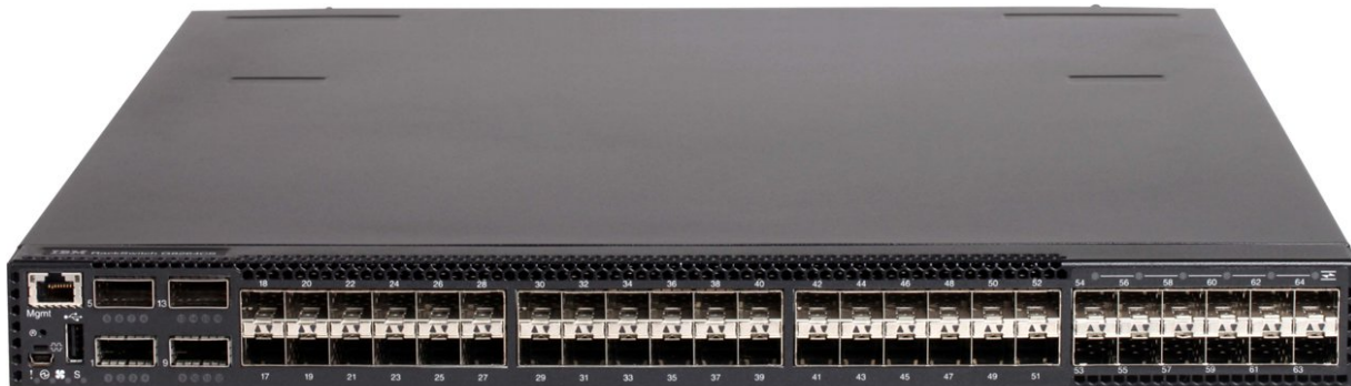
Figure 1. Lenovo RackSwitch G8264CS

The RackSwitch G8264CS is shown in the following figure.