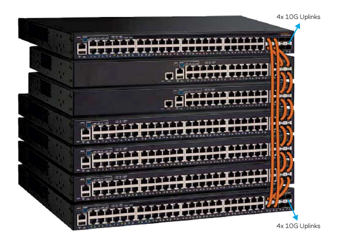
Figure 1: Up to 12 RUCKUS ICX 7150 Switches can be stacked together using up to four SFP+ 10 Gbps ports per switch for a fully redundant backplane delivering 480 Gbps of aggregated stacking bandwidth.