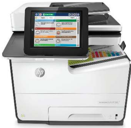
HP PageWide Managed Color MFP E58650dn